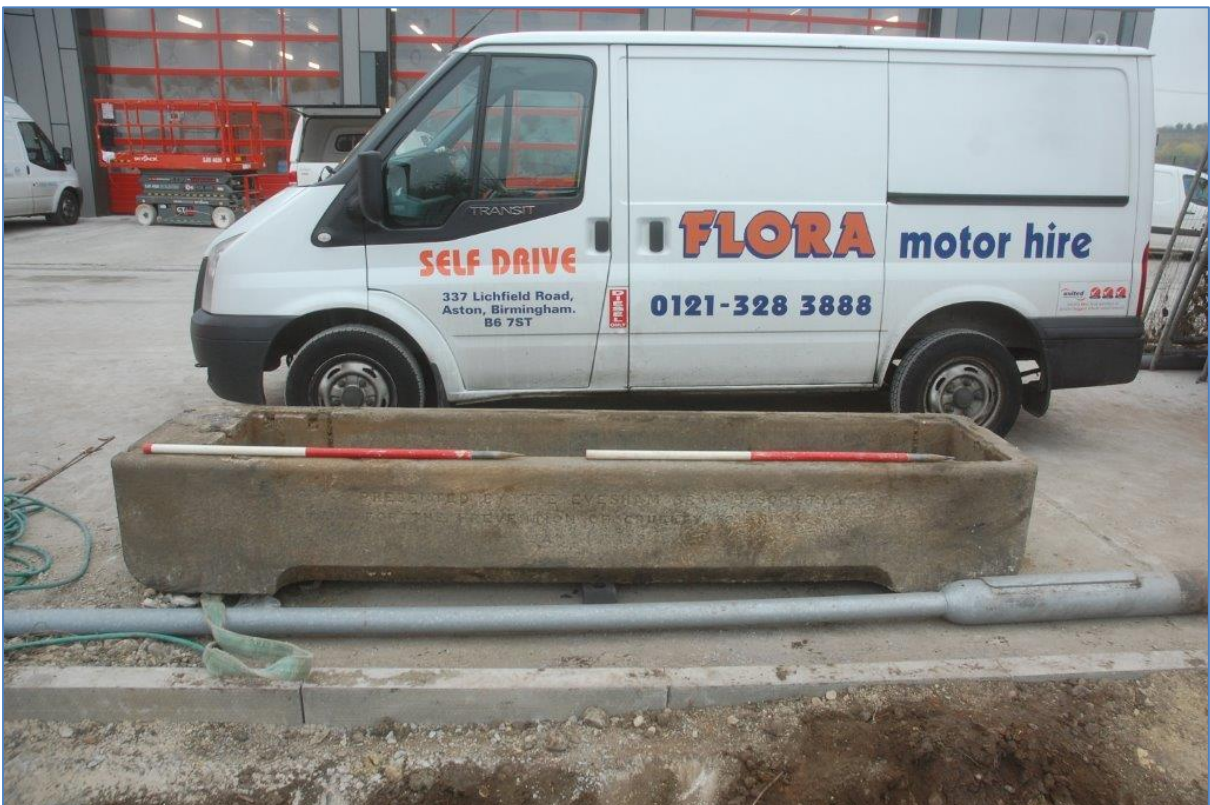
Plate 2: Granite animal trough