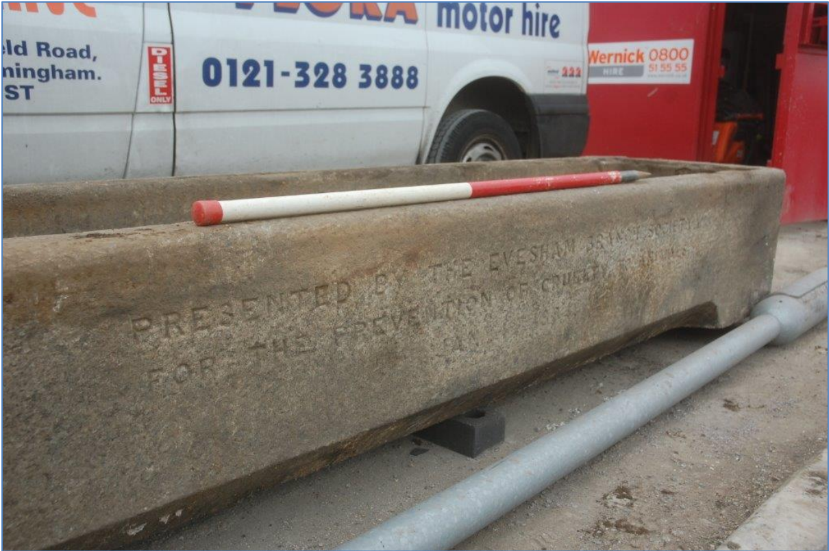
Plate 3: Inscription on side of trough