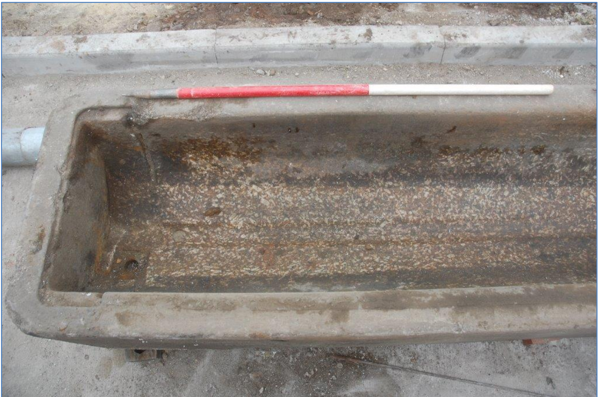
Plate 6: Internal trough close up of grooves and drainage