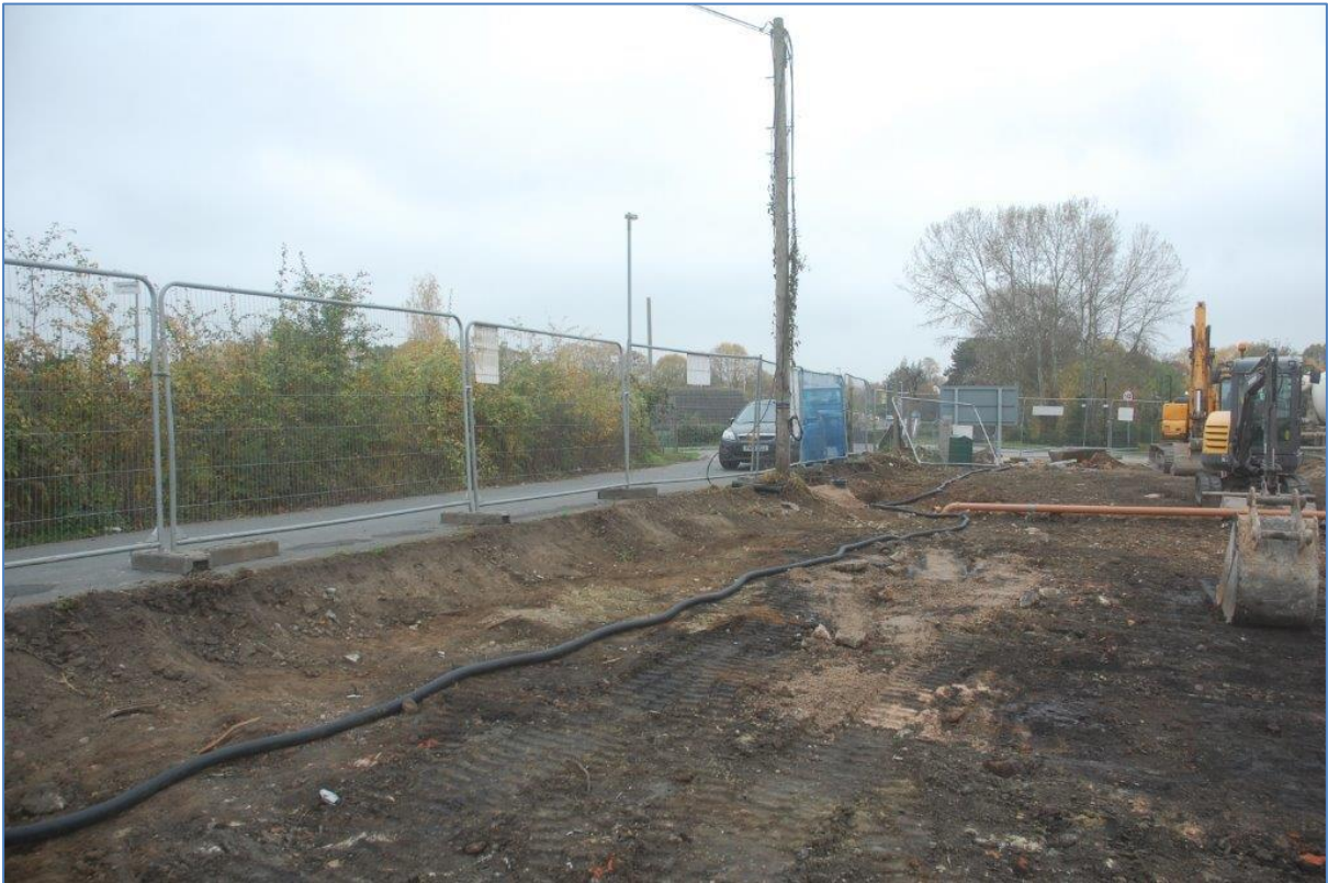
Plate 1: Site location – found close to the telegraph pole, in line with the black duct