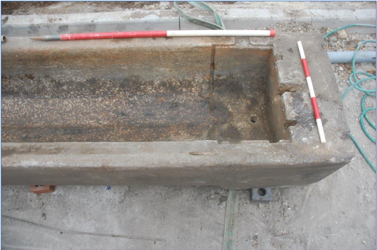
Plate 5: Internal trough, close up of grooves and drainage holes.