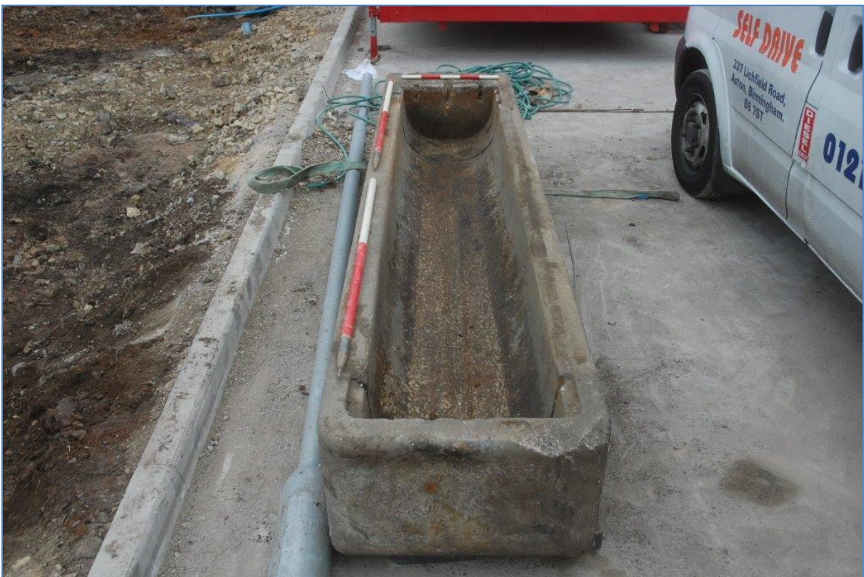
Plate 4: Internal trough