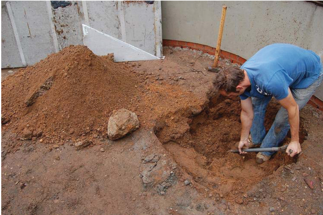
Plate 1 The Soakaway hole being excavated looking southeast