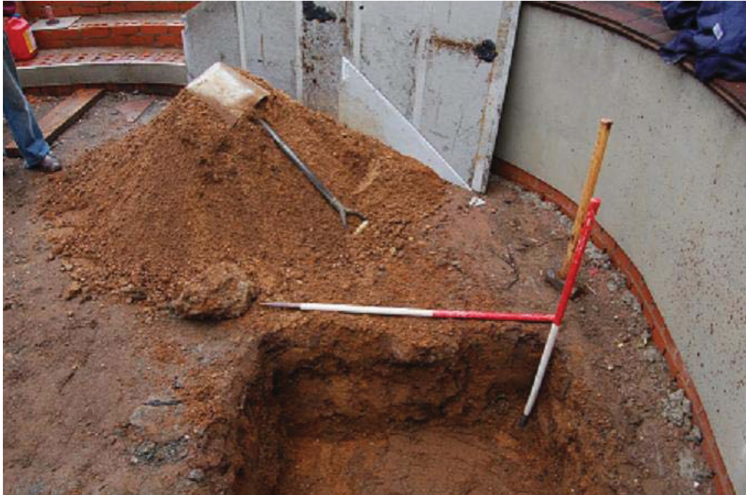
Plate 3 The west facing section of the soakaway and the spoil heap including the concrete base removed