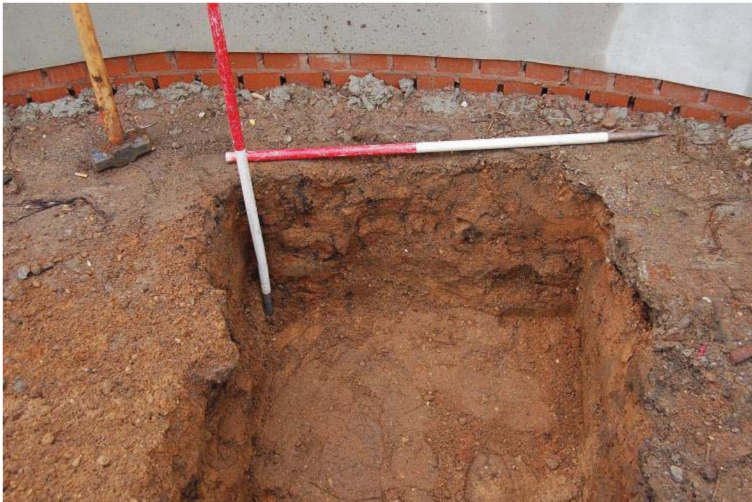
Plate 2 The soakaway excavated to full depth looking south