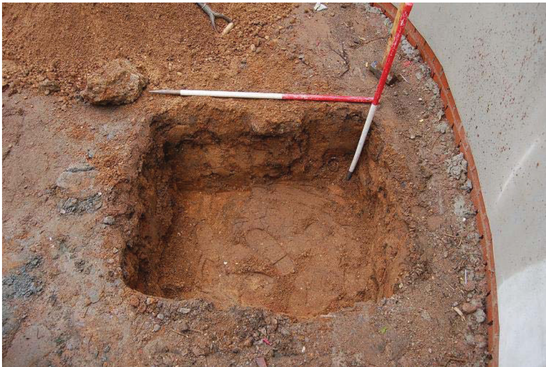
Plate 4 Plan of the soakaway and the west facing section with the spoil heap including the concrete base removed