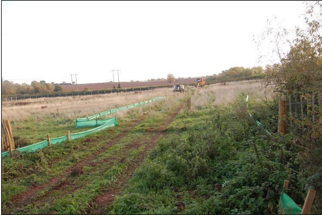
Plate 11, General shot of east field in advance of soil strip for road and pumping station, looking east