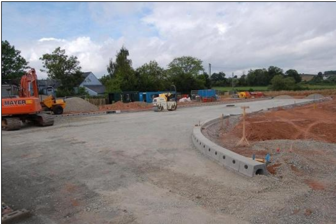
Plate 6, Access road off Roman Road complete, looking north-west