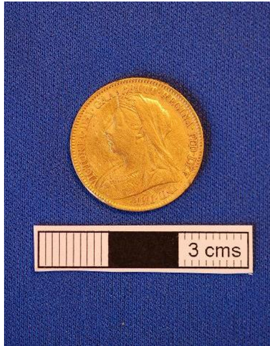
Plate 1, The obverse side of the gold Victorian half sovereign with the old head of Queen Victoria, found within spoil from the access road