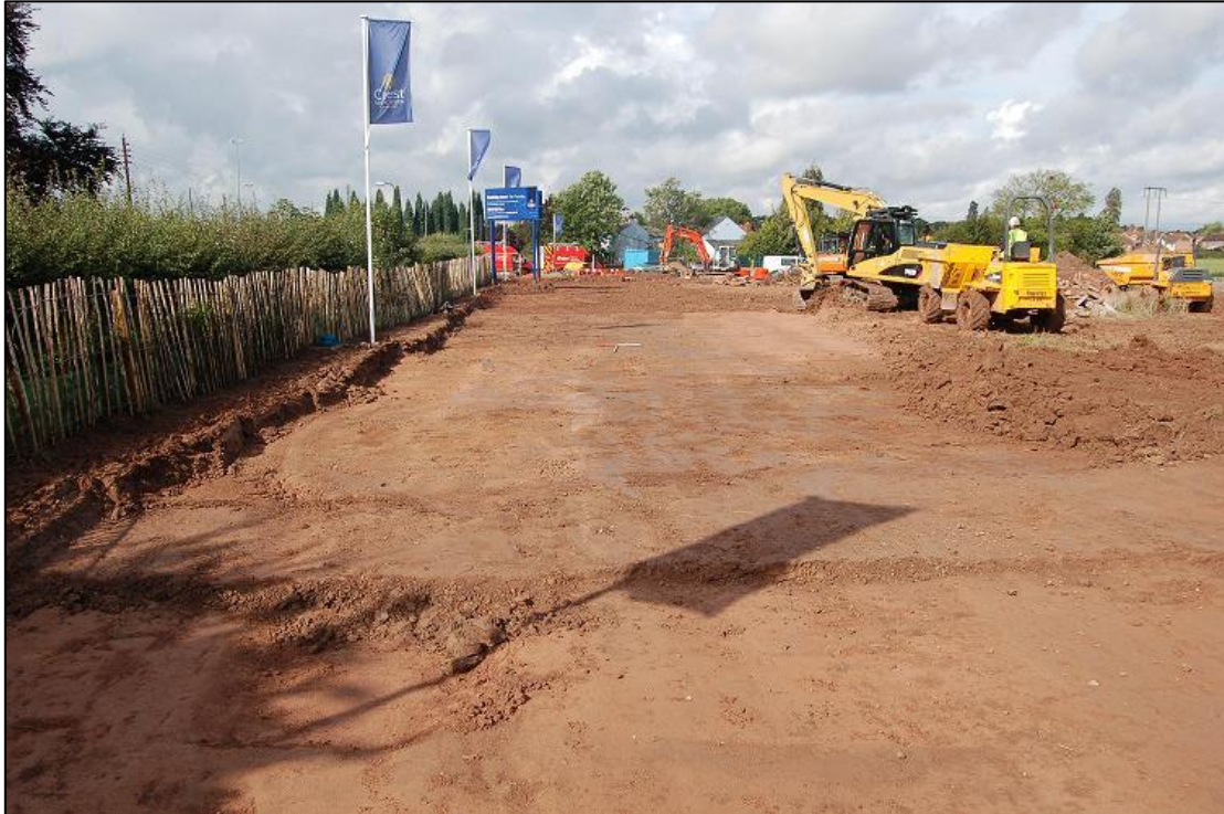
Plate 7, Soil strip in advance of excavation of house footings along south side of site, looking west