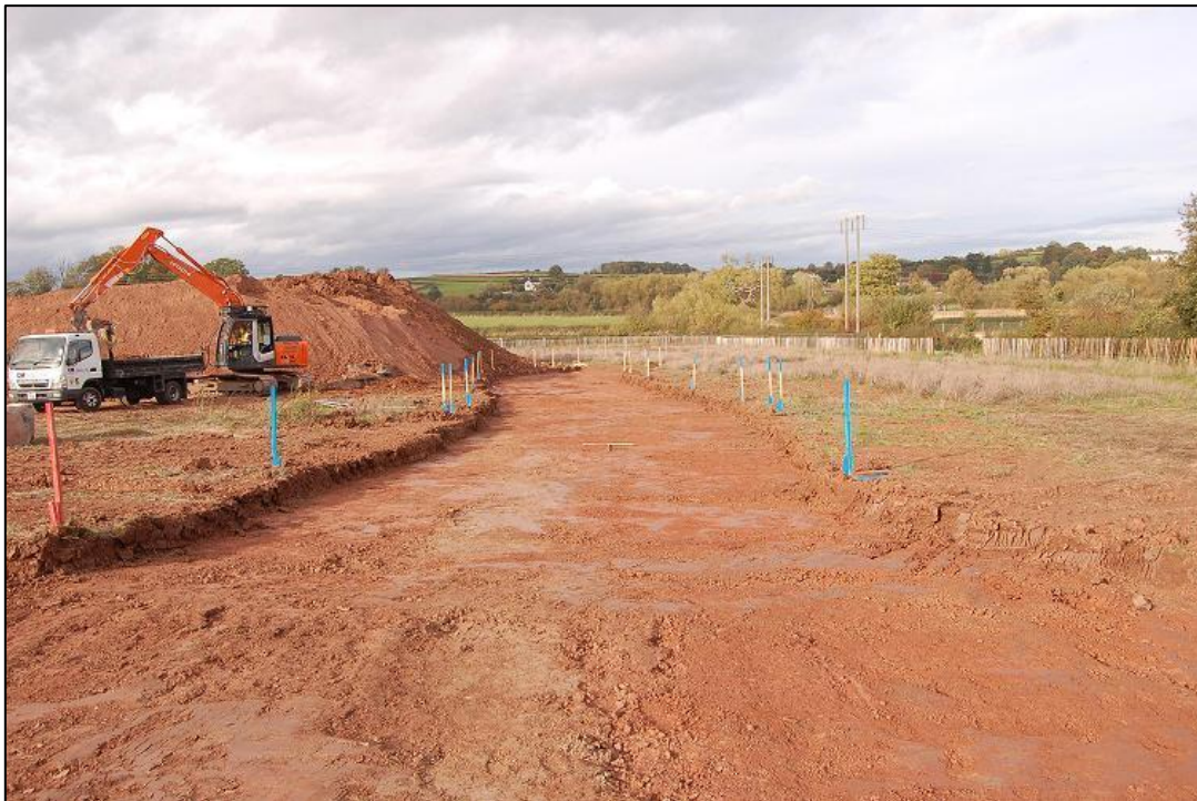
Plate 10, Soil strip to east in advance of excavation of house foundations, looking north