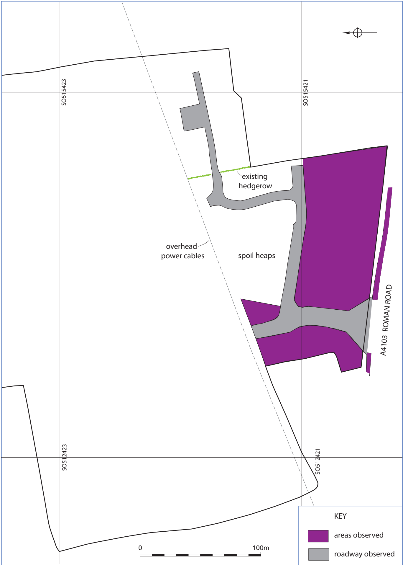
Areas observed during Watching Brief