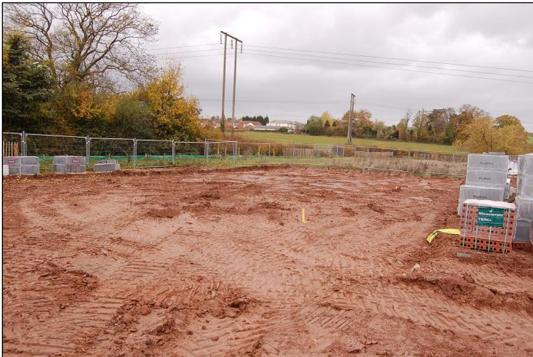
Plate 16, Soil strip of north-west area in advance of excavation of house foundations, looking north-west