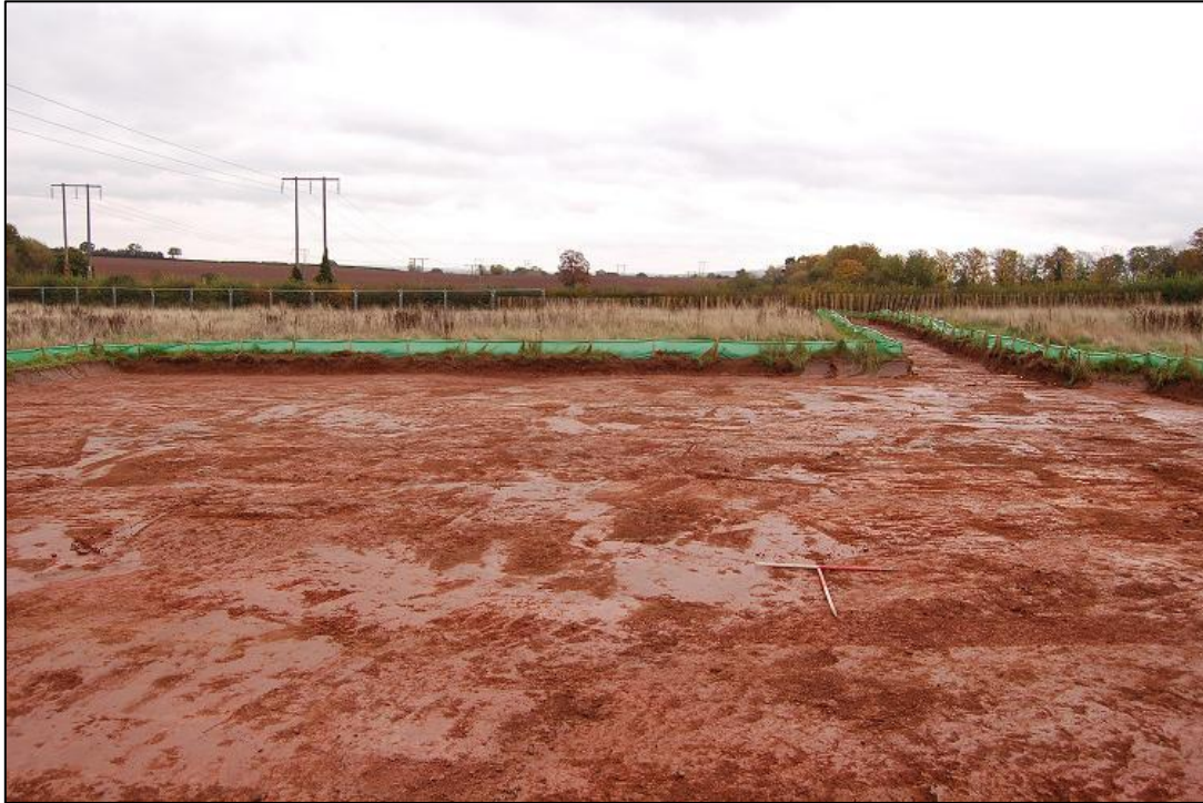
Plate 13, Soil strip for east road and pumping station, looking east