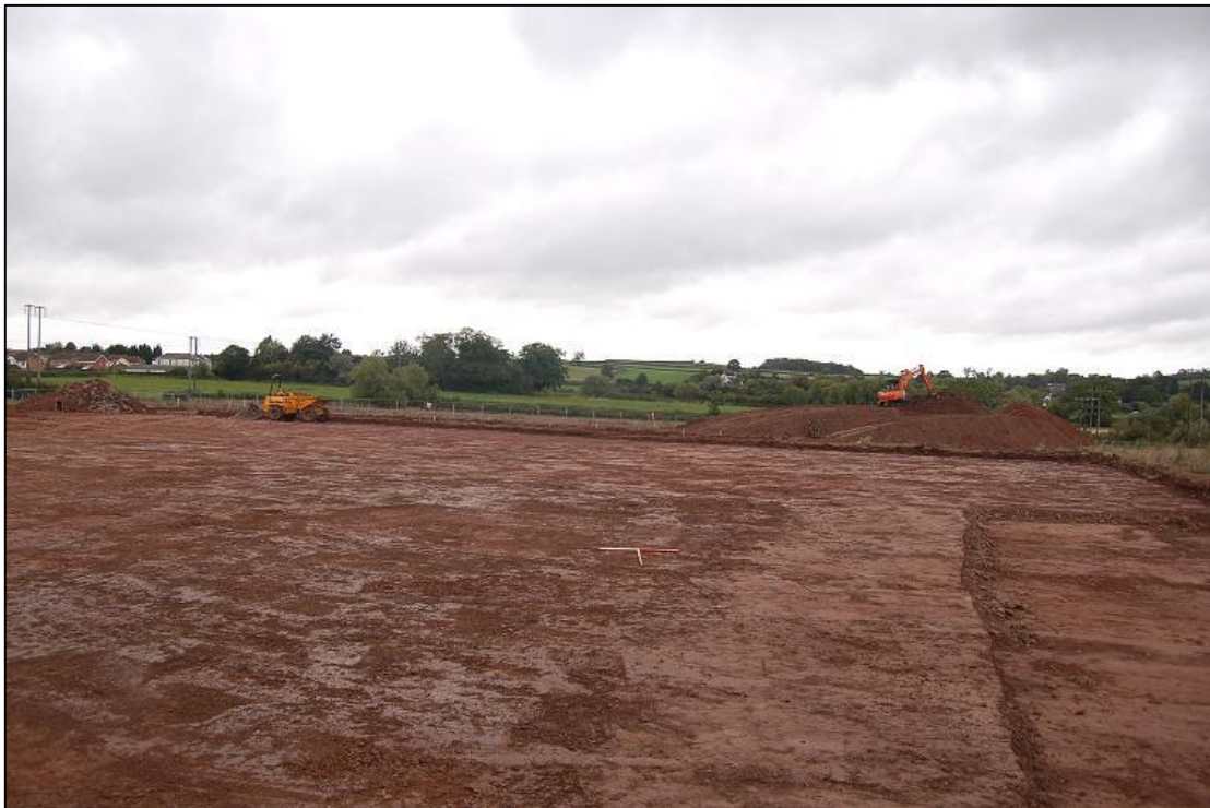
Plate 8, Soil strip in advance of excavation of house foundations toward the east side of site, looking north