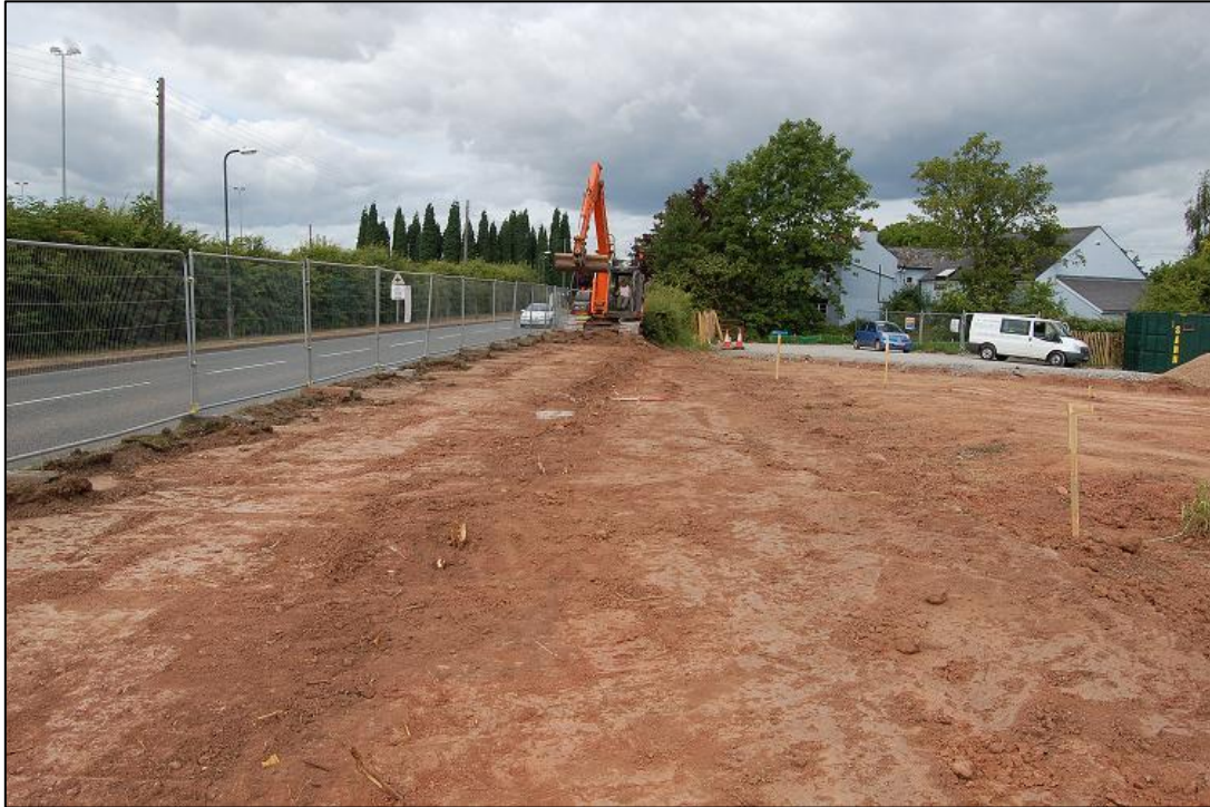
Plate 5, Hedgerow removed and area stripped alongside Roman Road, looking west