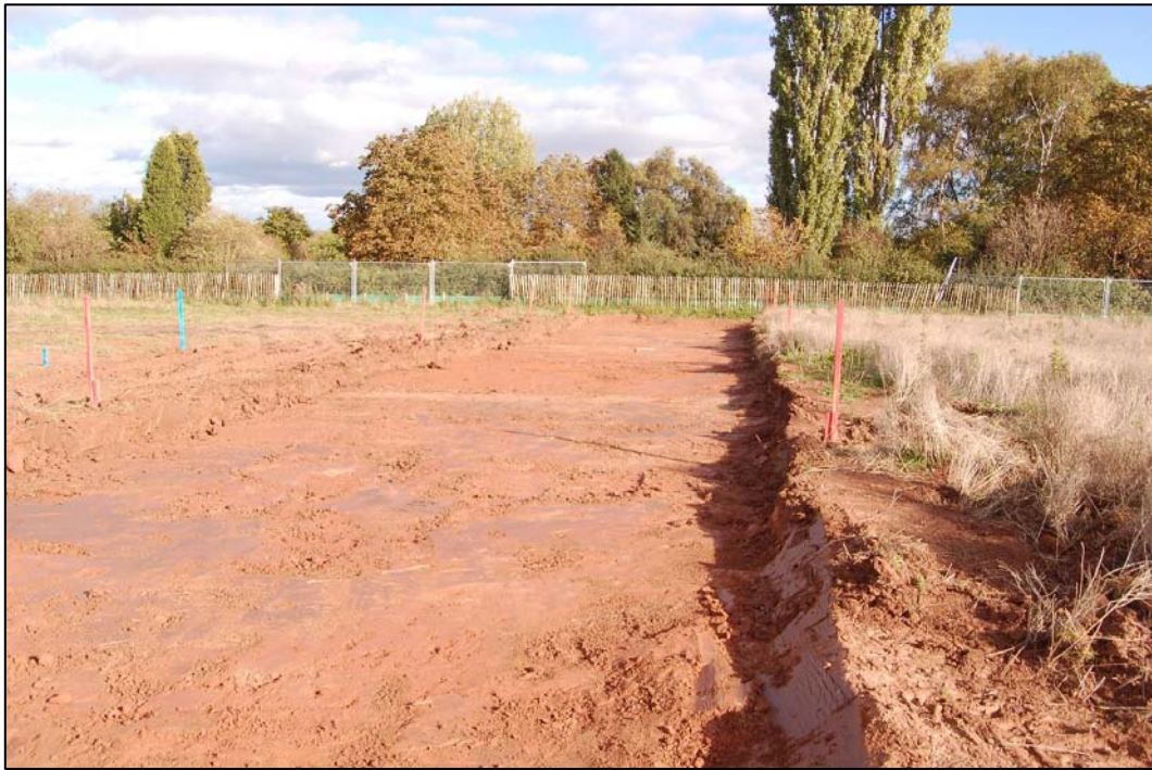
Plate 9, Soil strip for east road, looking north