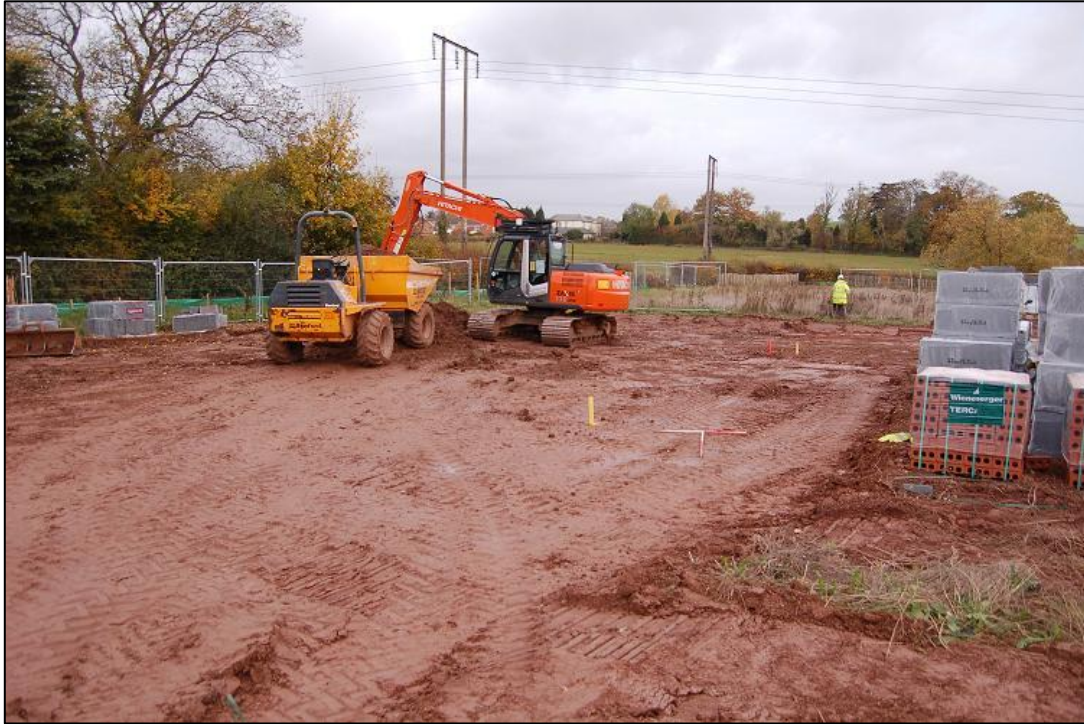
Plate 15 Soil strip of north-west area in advance of excavation of house foundations, looking north-west