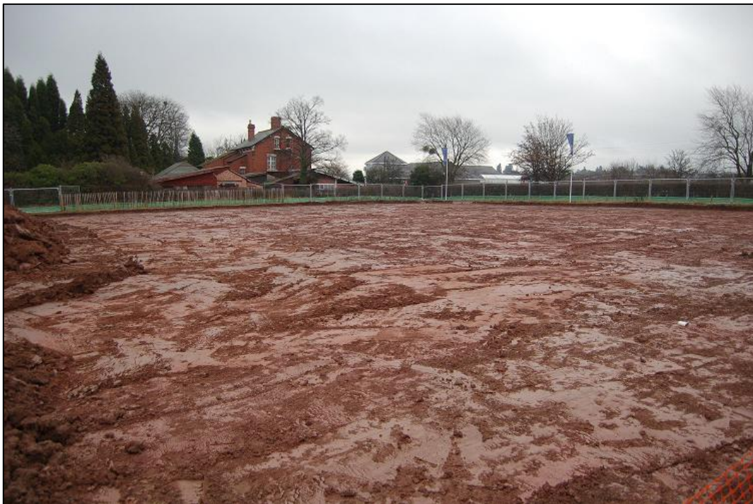
Plate 18, Soil strip of south-west area in advance of excavation of house foundations, looking south-west