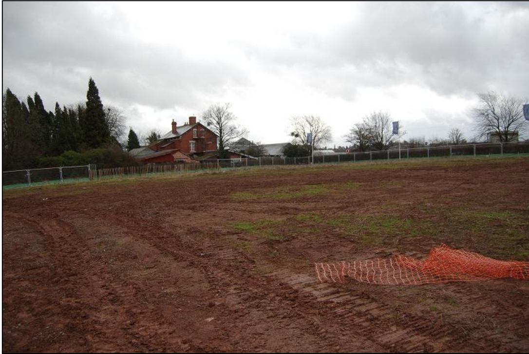
Plate 17, South-west area in advance of soil strip, looking south-west