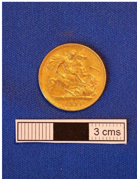
Plate 2, The reverse of the gold Victorian half sovereign dated 1896, found within spoil from the access road