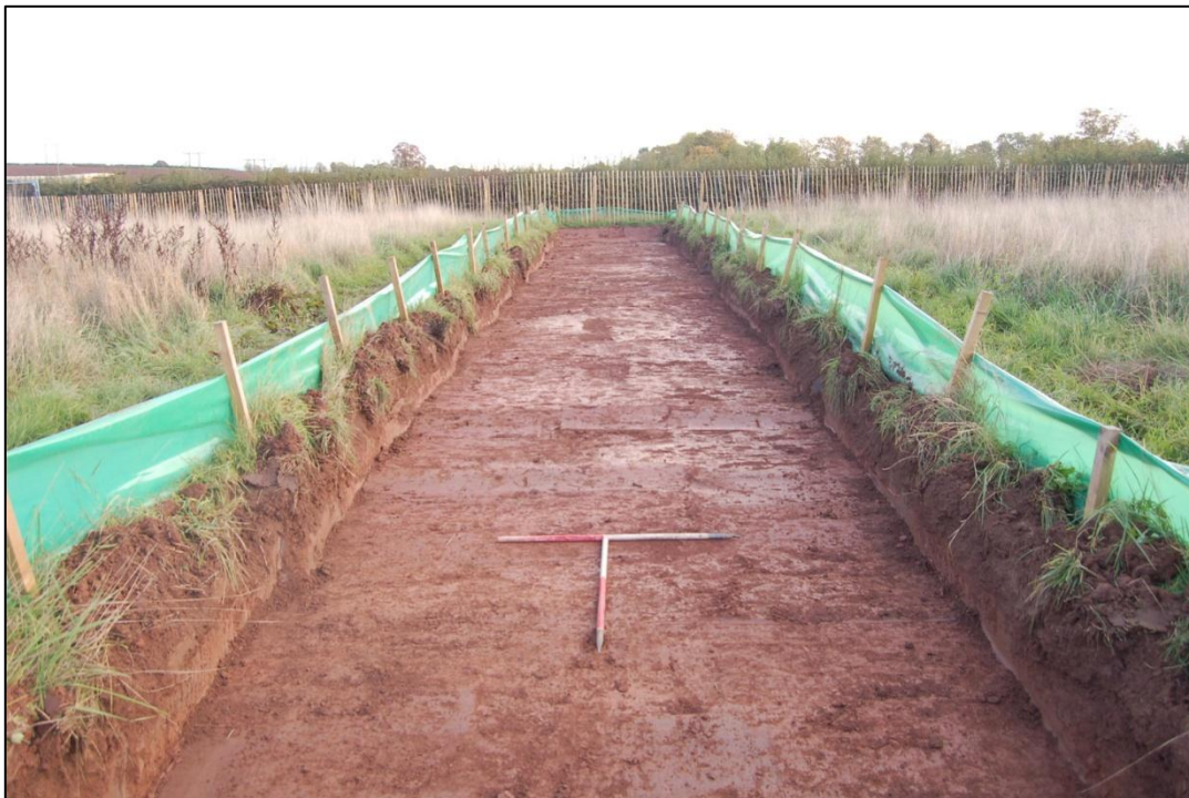
Plate 12, Soil strip for east road, looking east