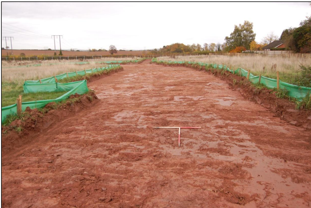
Plate 14, Soil strip for east road and pumping station, looking east