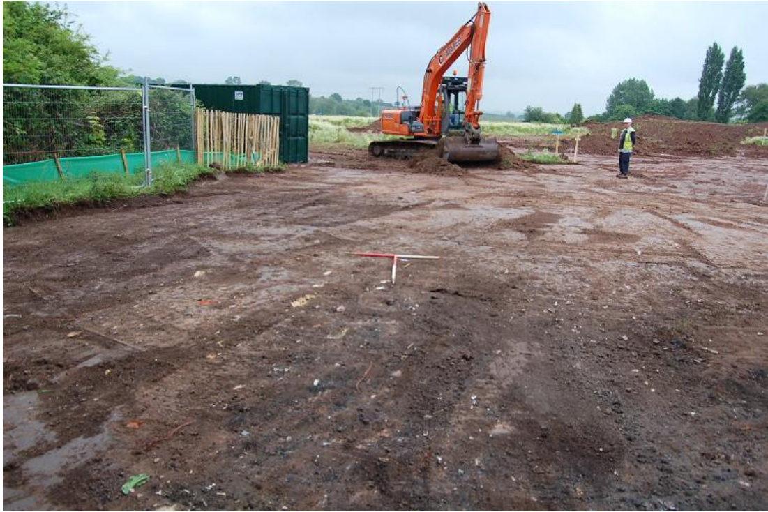
Plate 3, Soil strip in progress for access road into site, showing a hardcore spread within topsoil, looking north-east