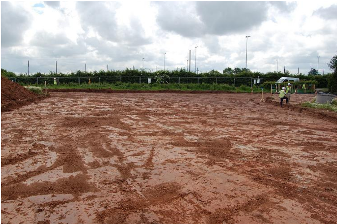
Plate 4, Soil strip for access road into site after excavation, looking south to Roman Road