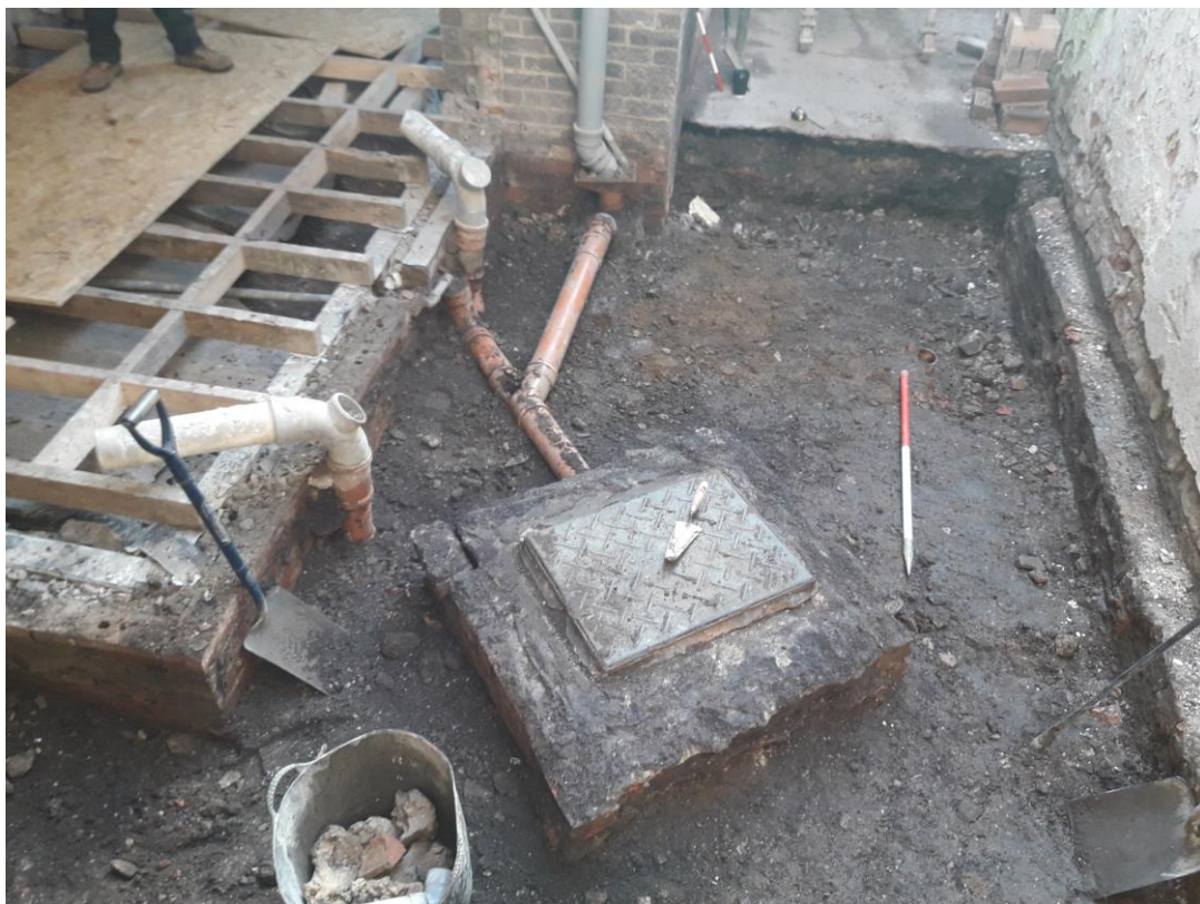
Plate 6: Site overview completed. Facing South-East. 1m Scale.