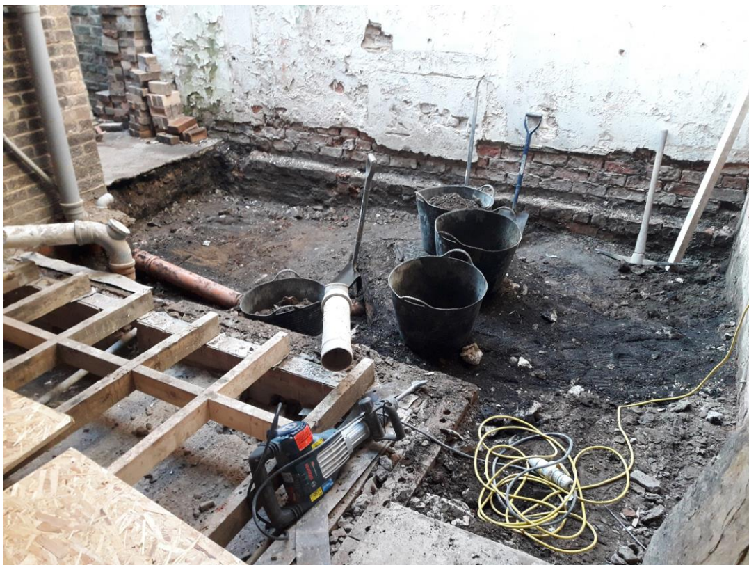
Plate 4: Site overview during work. Facing South.