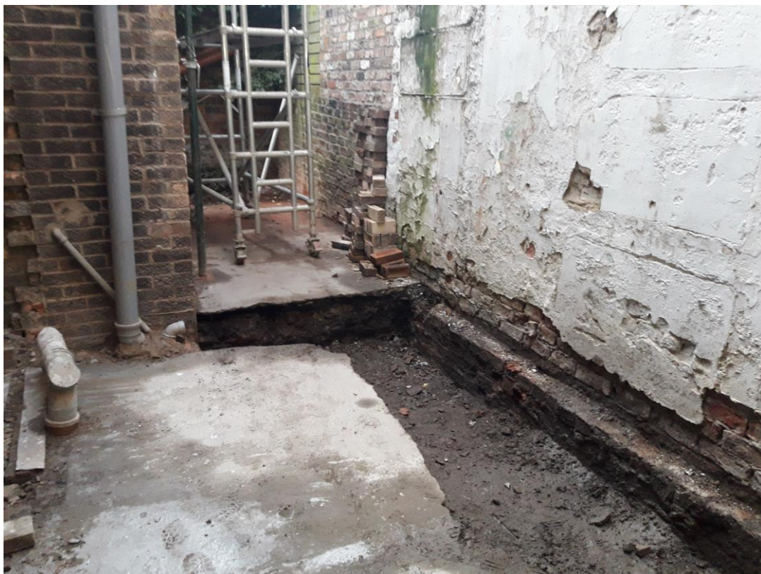
Plate 2: Site overview prior to work. Facing South-East.