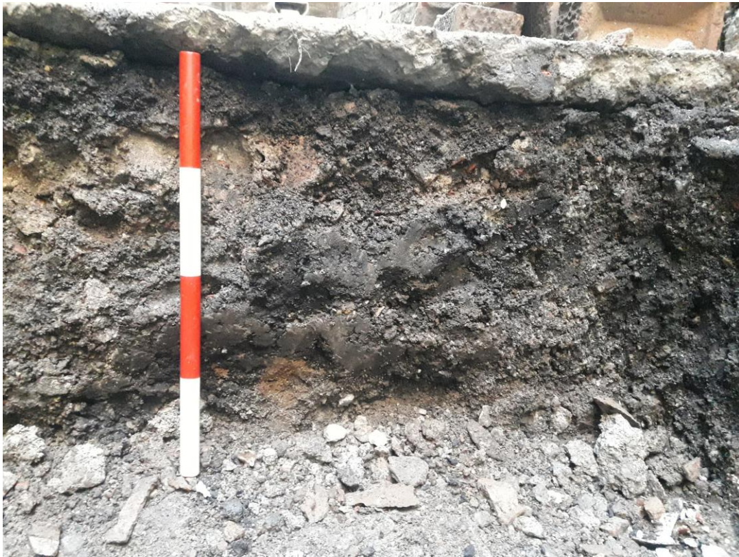
Plate 5: North-West Facing Section of removed material. Facing South-East. 0.4m Scale.