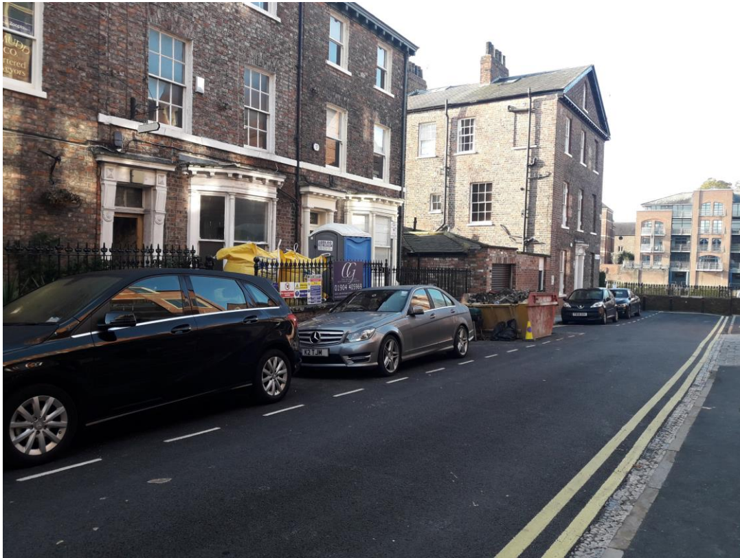
Plate 1: View of Peckitt Street. Facing South-East