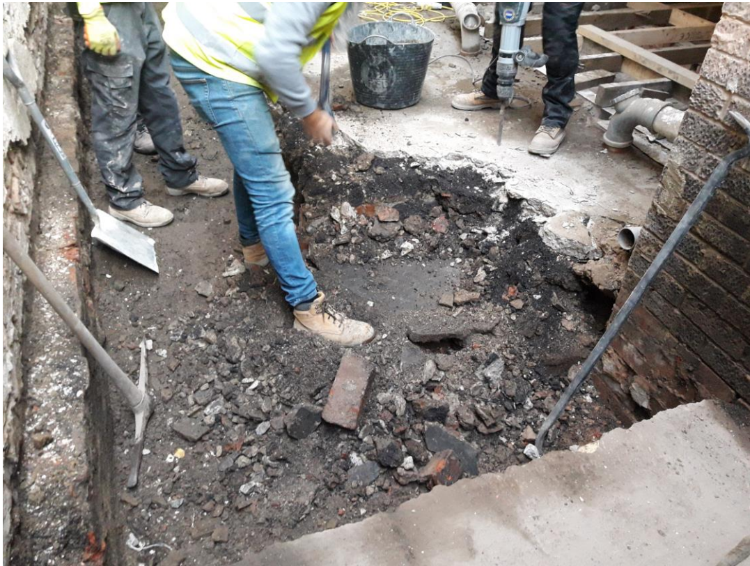
Plate 3: Removal of concrete and debris. Facing North-West.