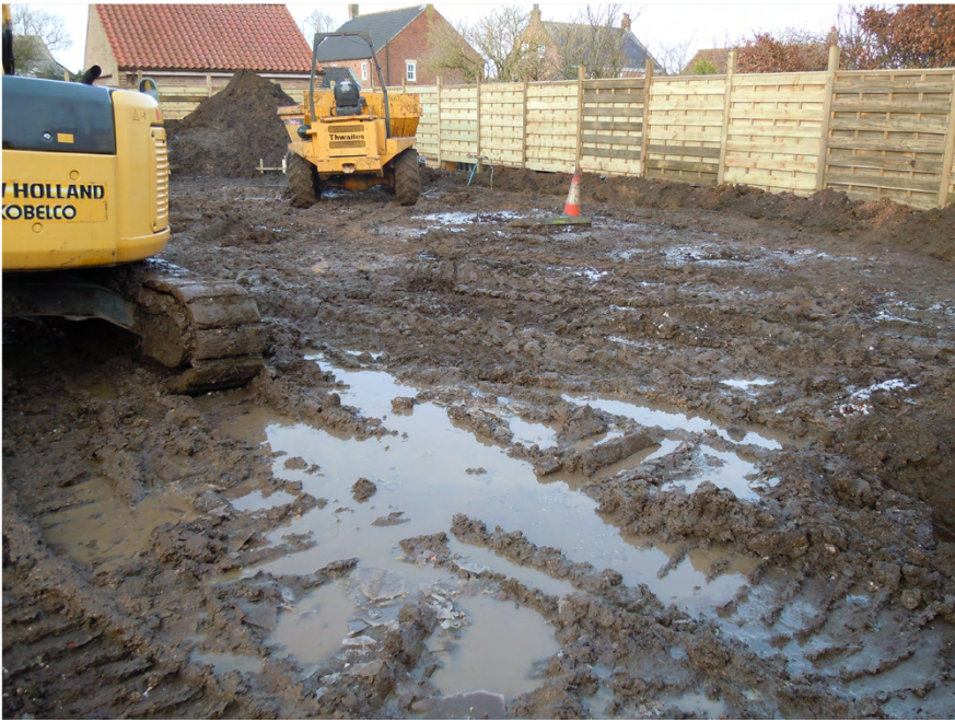
Plate 1. Site Pre-excitation. Facing North-west.