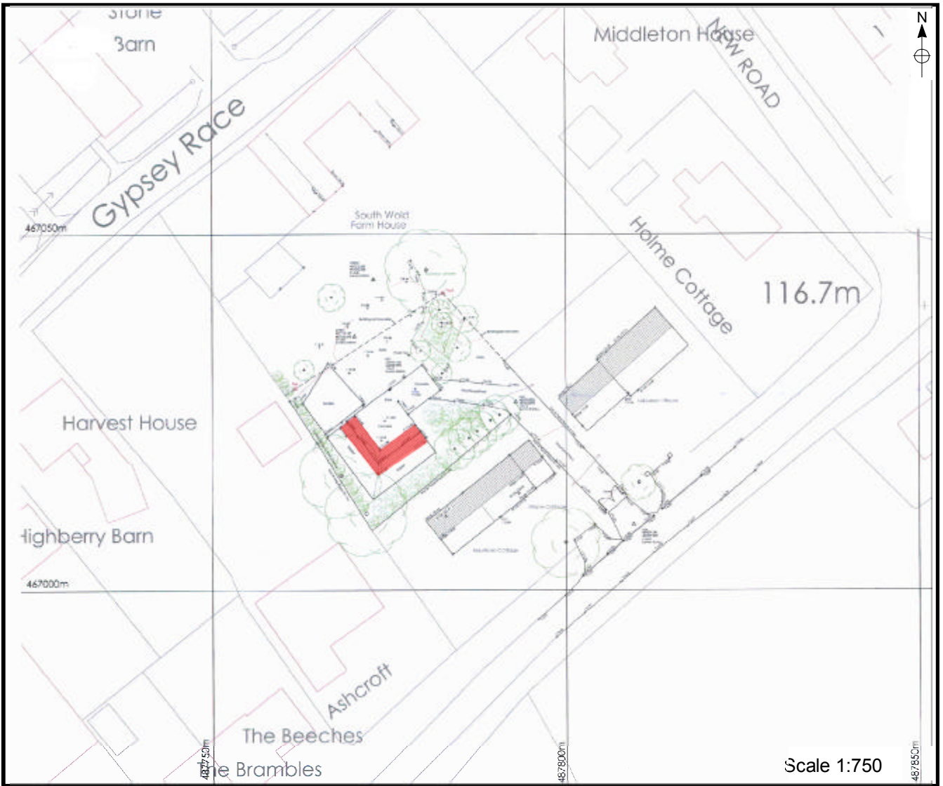
Figure 2. Location of Archaeological Watching Brief.