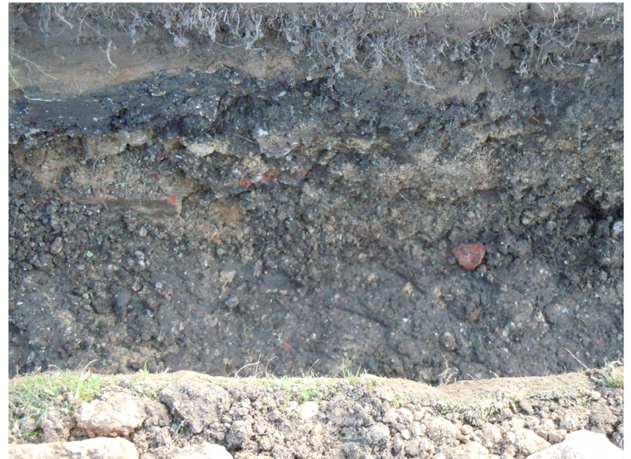
Plate 6. Service Trench showing Demolition Rubble. Facing North.