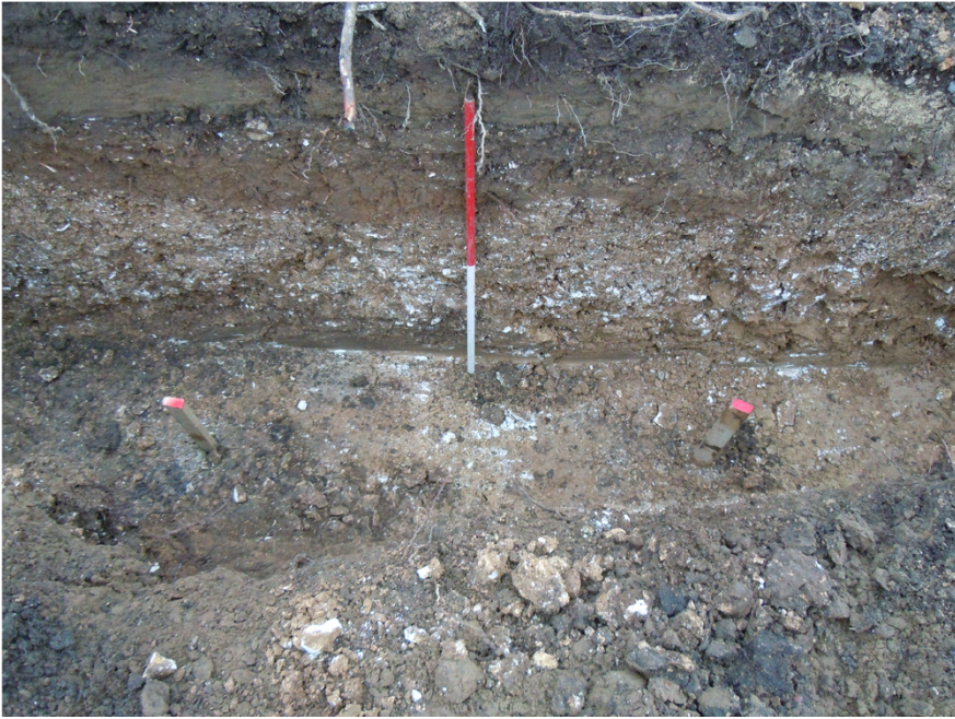
Plate 3. Southern Foundation Trench. Facing South.