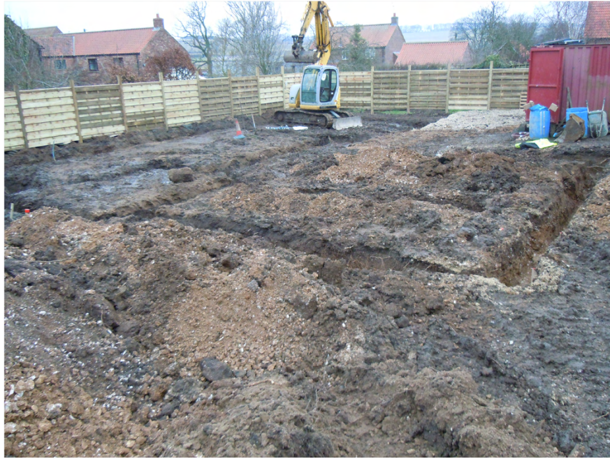
Plate 4. Completed Foundations. Facing North-east.