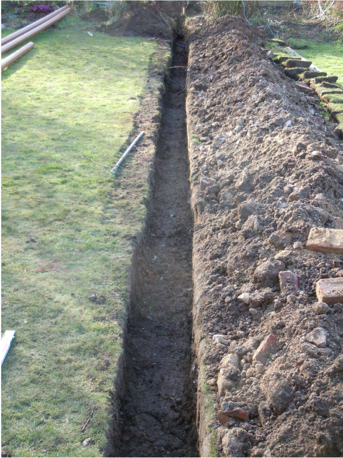
Plate 5. Service Trench. Facing West.