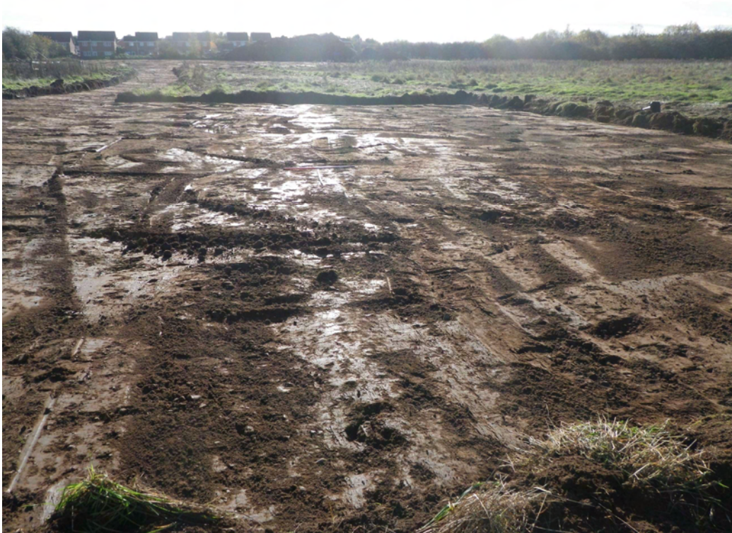
Plate 12. Watching Brief Area after Stripping (Compound). Facing South.