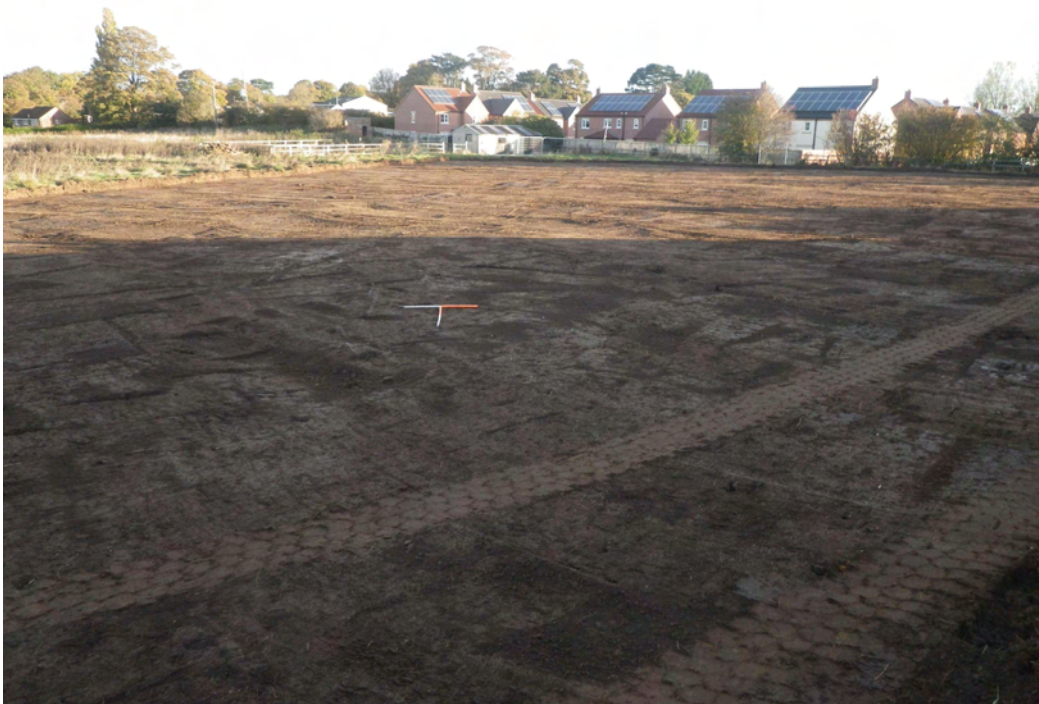
Plate 10. Strip & Record Area after Stripping. Facing North-east.