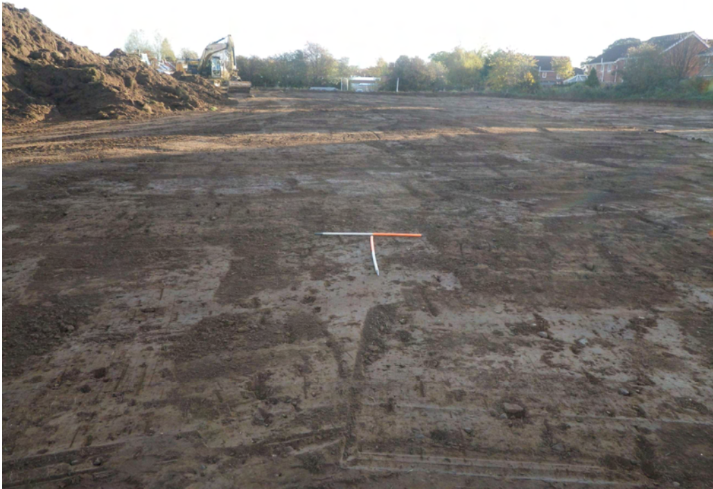
Plate 7. Strip & Record Area after Stripping. Facing East.