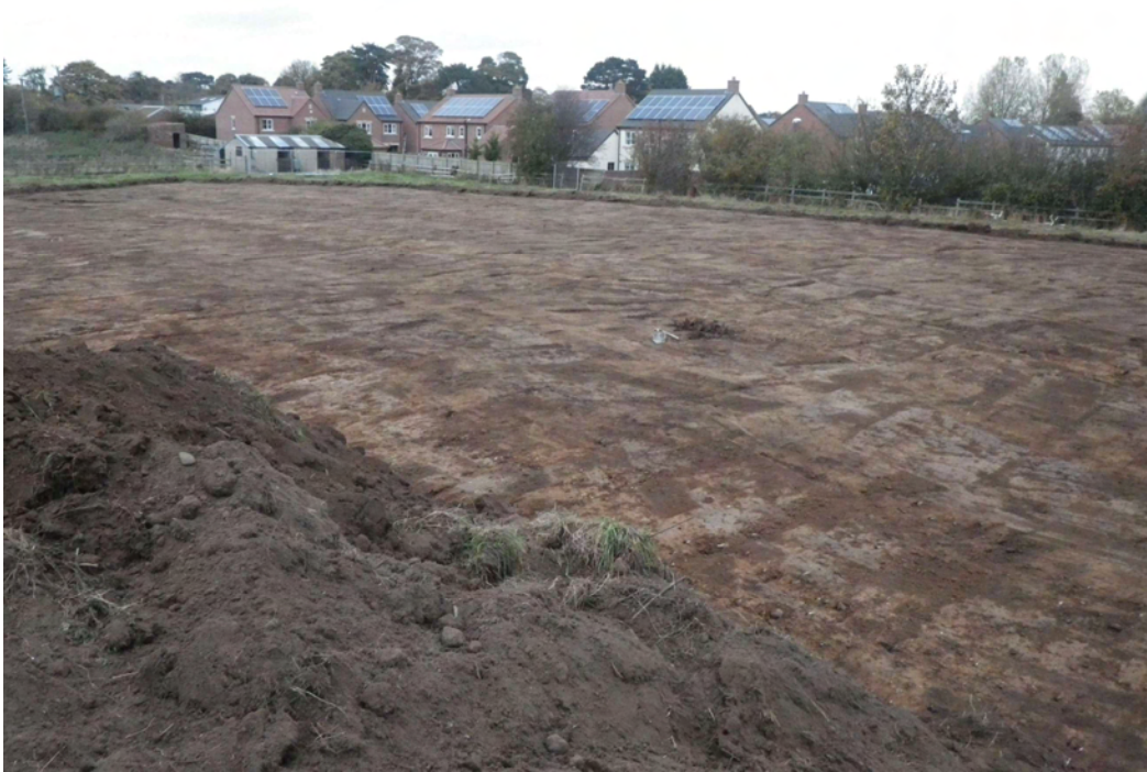
Plate 9. Strip & Record Area after Stripping. Facing North-east.