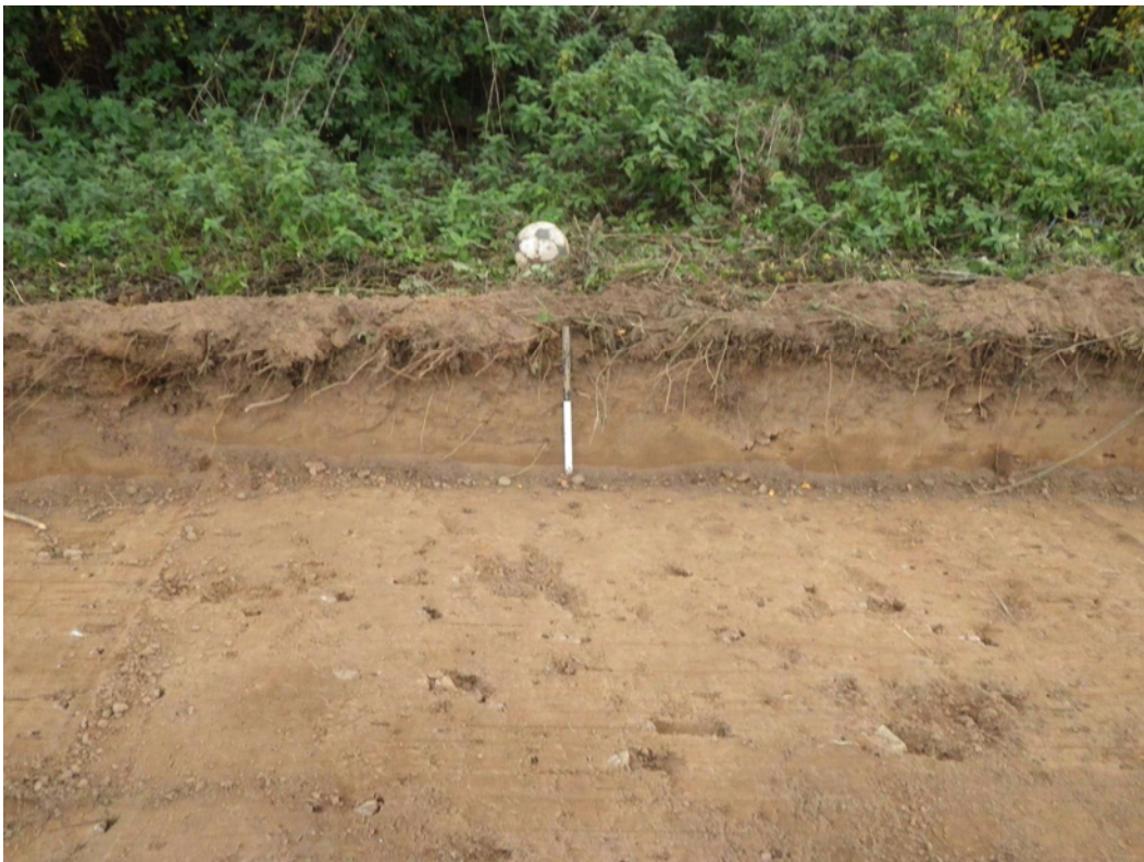
Plate 4. Strip & Record Area after Stripping. Facing South.