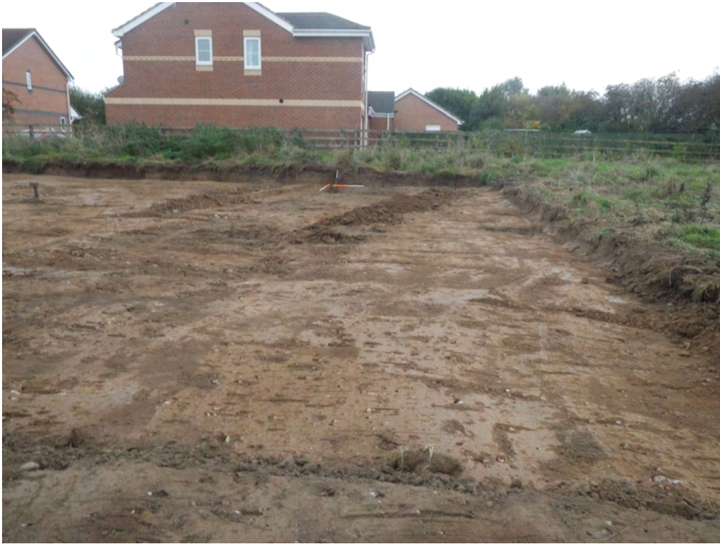
Plate 5. Strip & Record Area after Stripping. Facing South.