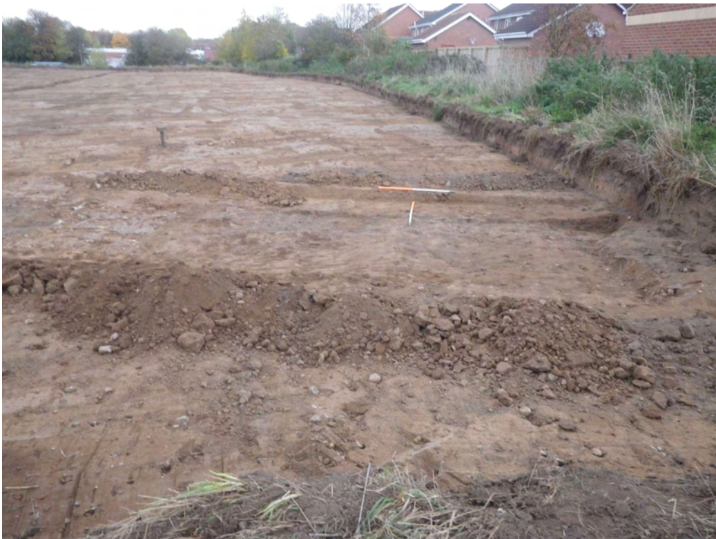
Plate 6. Strip & Record Area after Stripping. Facing East.