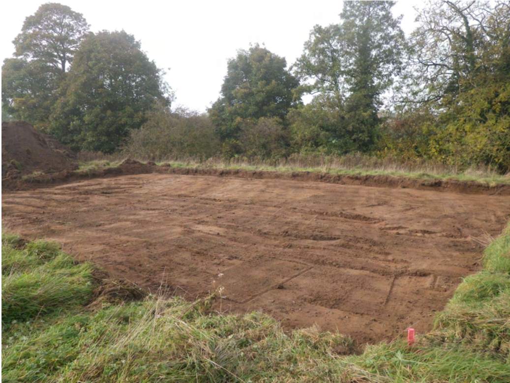
Plate 1. Watching Area after Stripping (Soil Bund). Facing North-west.