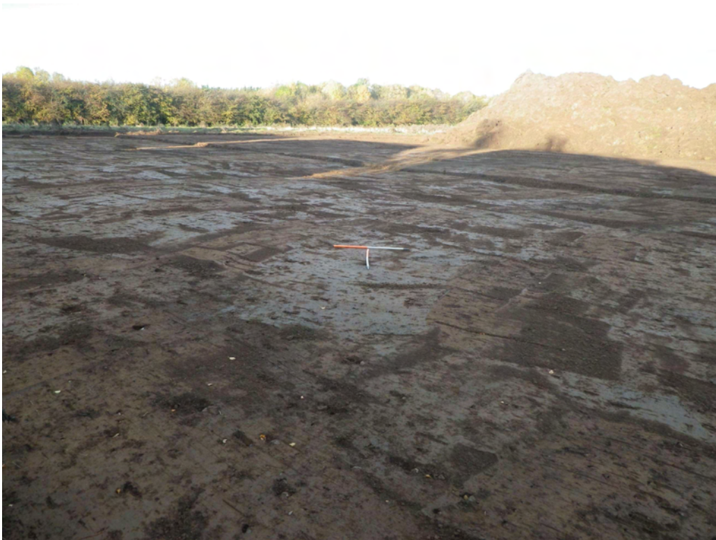
Plate 8. Strip & Record Area after Stripping. Facing North-west.