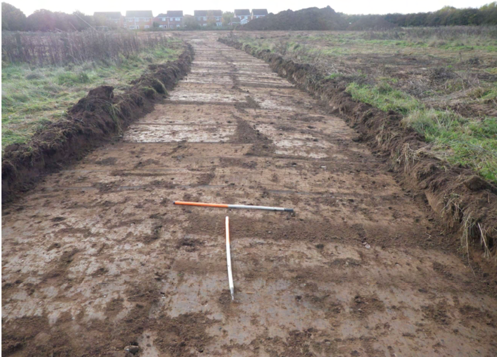
Plate 11. Watching Brief Area after Stripping (Road). Facing South.