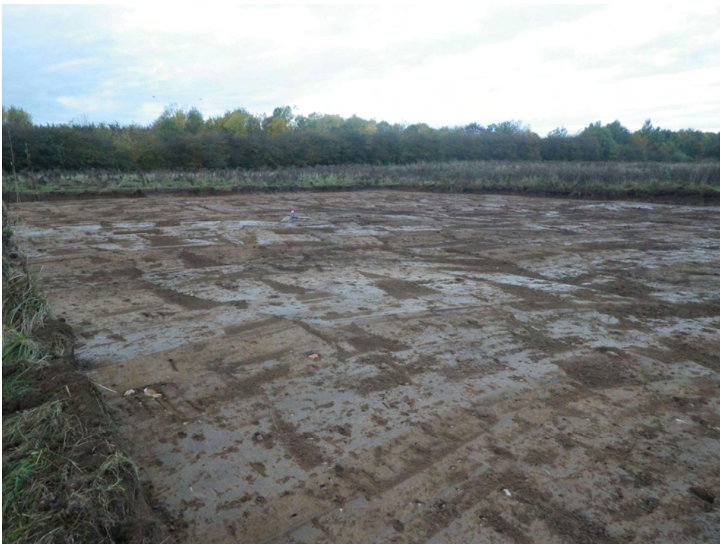
Plate 2. Strip & Record Area after Stripping (Soil Bund). Facing North-west.