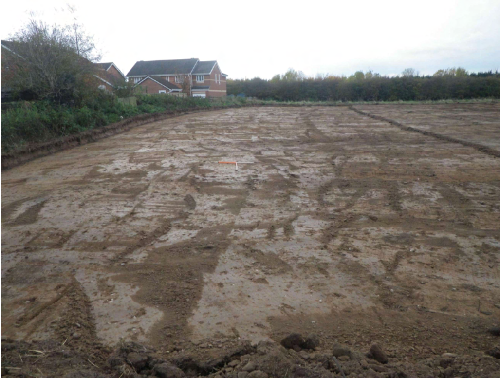
Plate 3. Strip & Record Area after Stripping. Facing West.