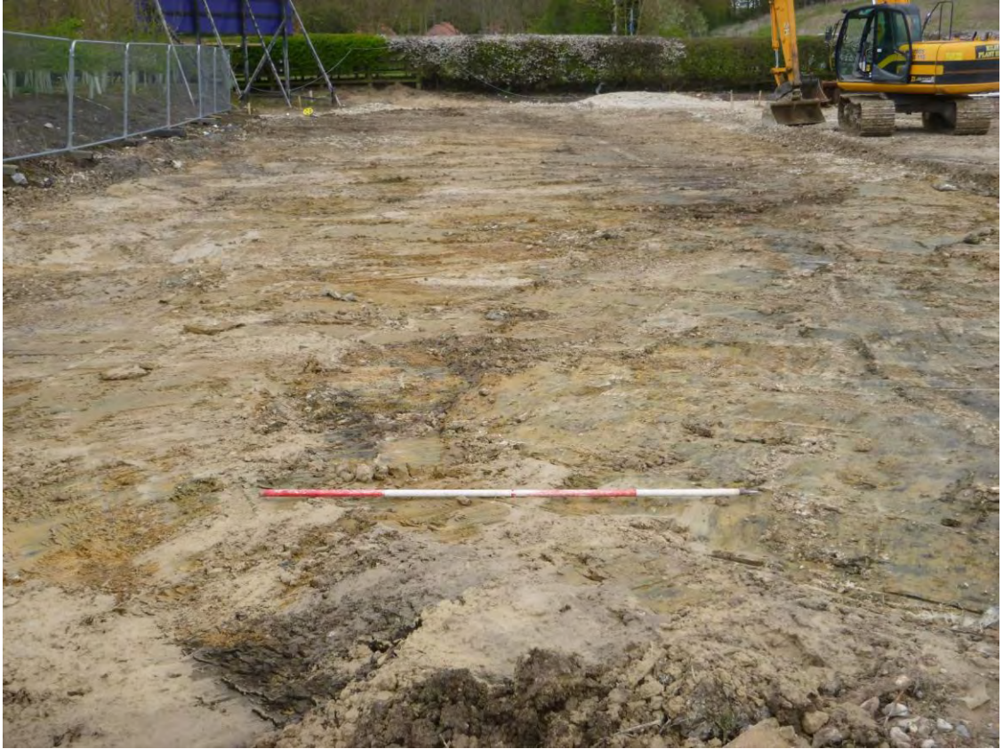
Plate 2. General view of stripped area. Facing north.