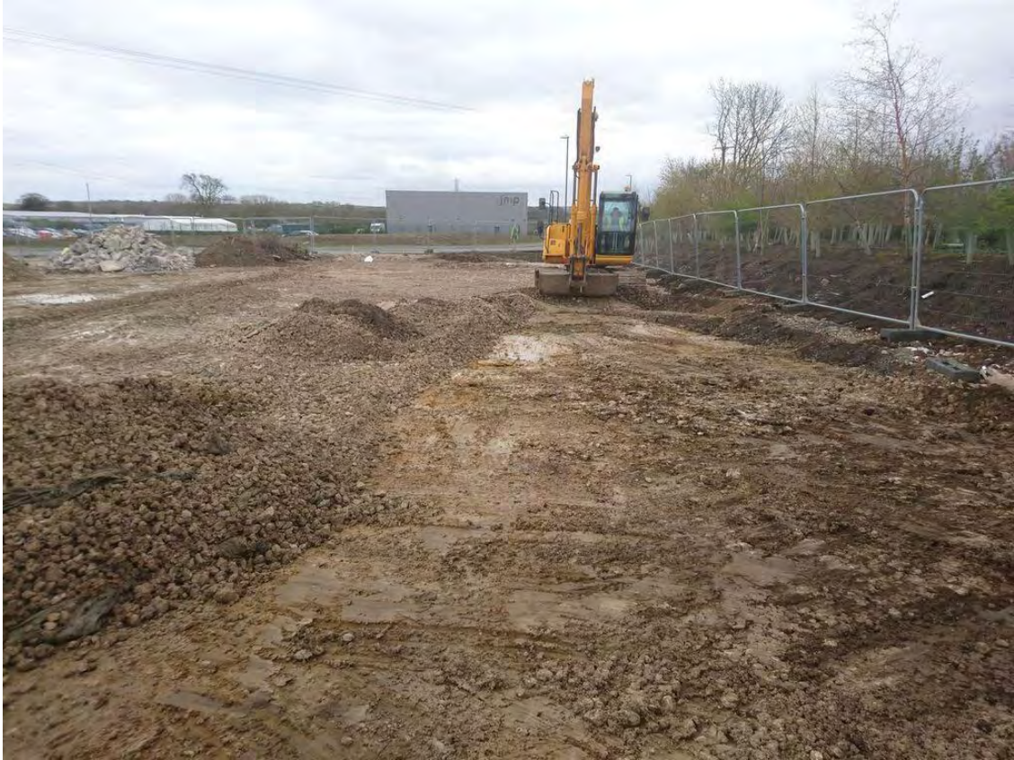
Plate 1. General site view. Facing south.