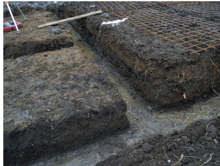
Plate 4. Foundation Trenches.