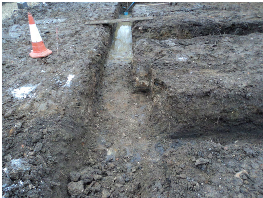
Plate 1. Foundation Trenches.