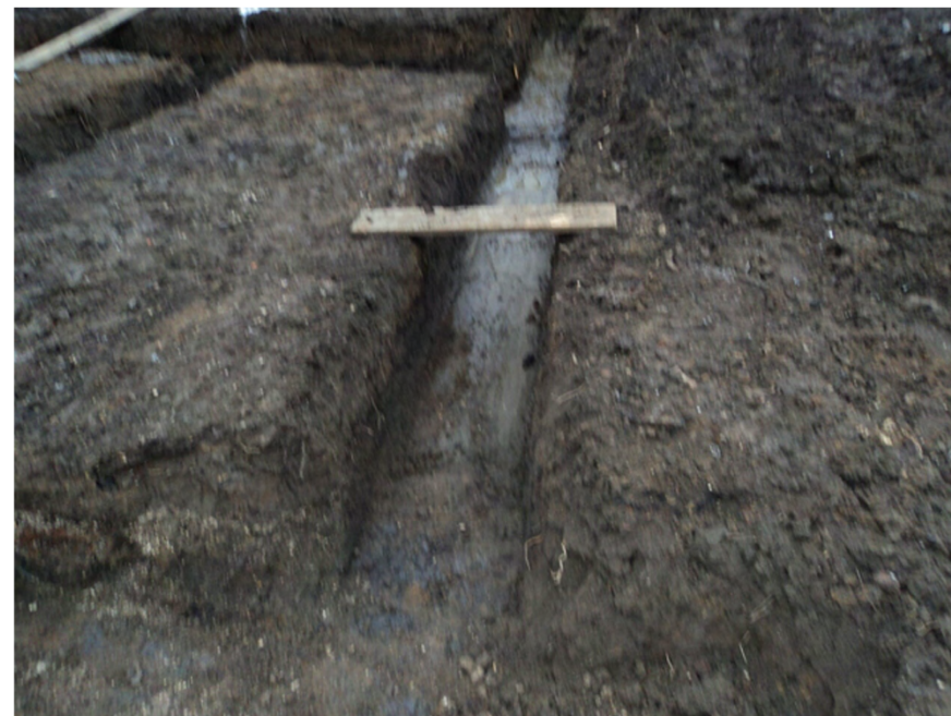
Plate 2. Foundation Trenches.