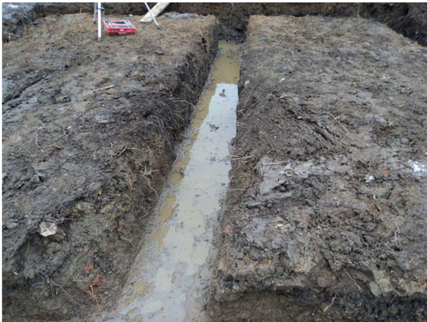
Plate 3. Foundation Trenches.