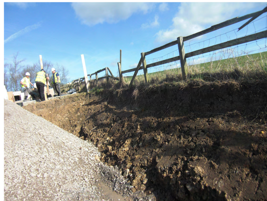
Plate 2. Drainage Trench. Facing North.