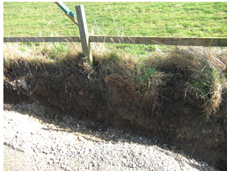
Plate 4. Section. Facing East.