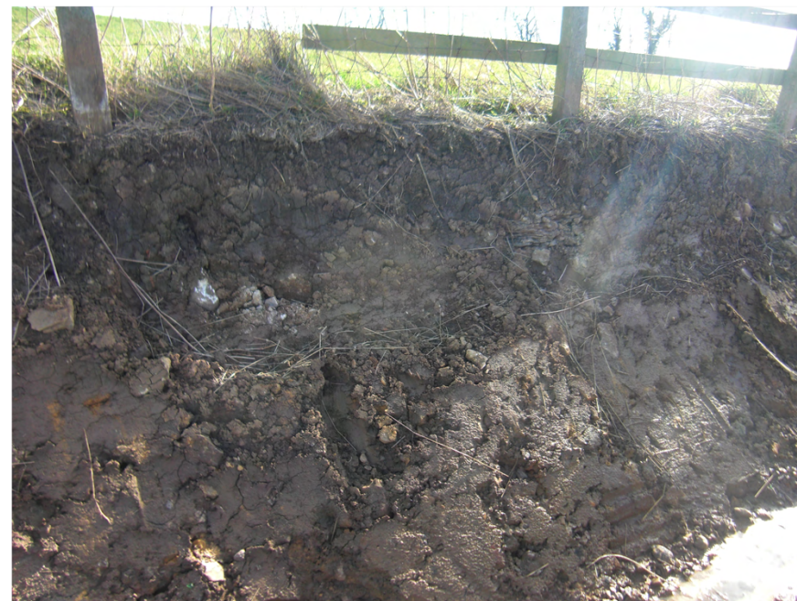
Plate 6. Section. Facing East.