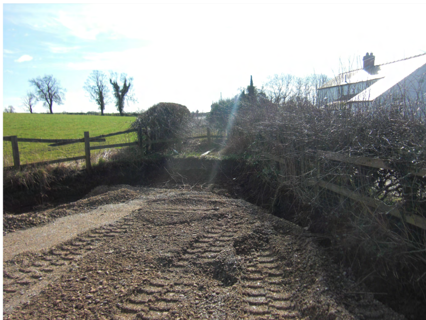
Plate 5. Area after stripping. Facing South.