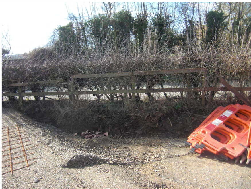
Plate 3. Section. Facing West.