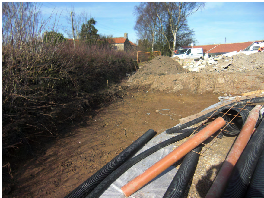
Plate 1. Site after stripping. Facing North.