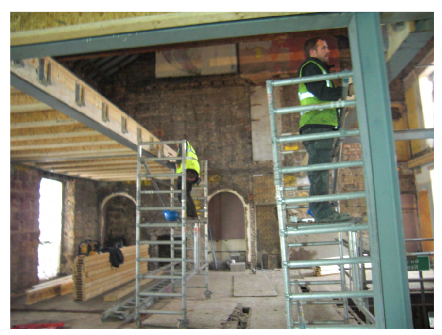
Plate 3. Interior of The West Parl Hotel. Facing North.