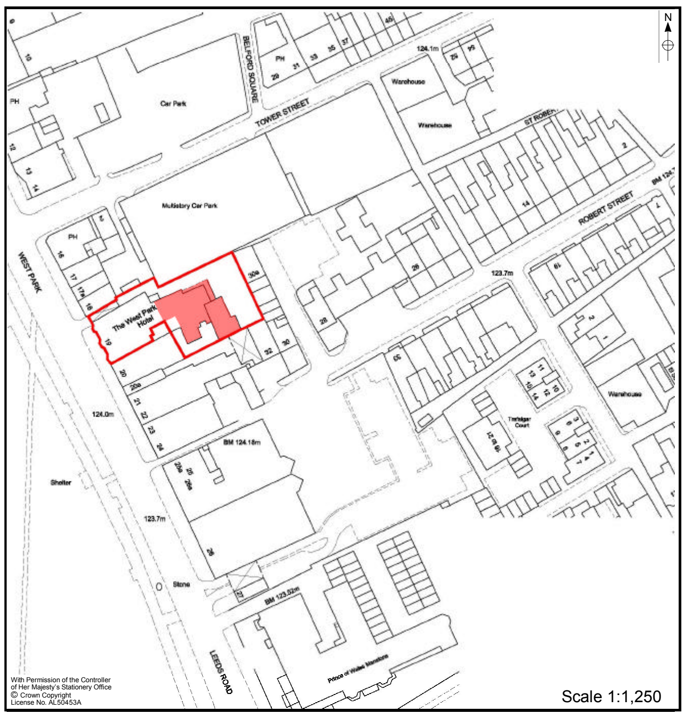
Figure 2. Location of Archaeological Watching Brief Area.