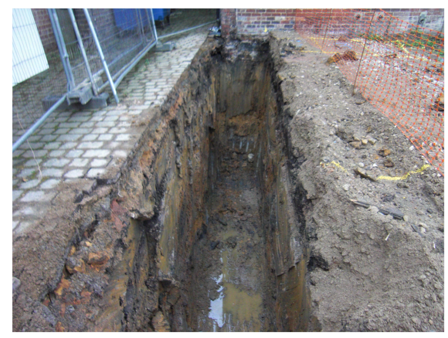
Plate 2. Foundation Trench. Facing North.