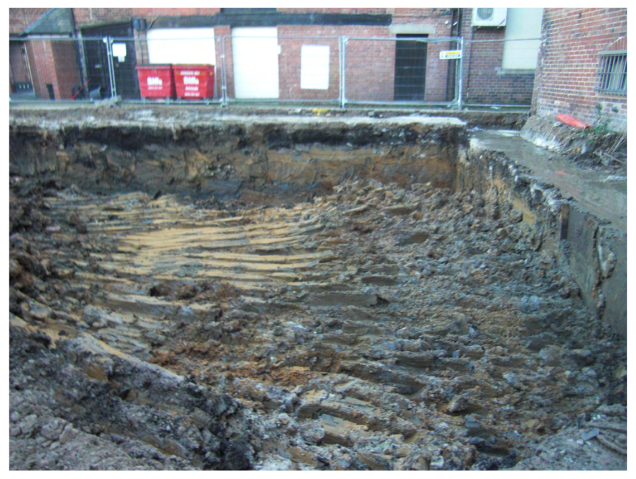
Plate 4. Excavation of Cellar. Facing North.