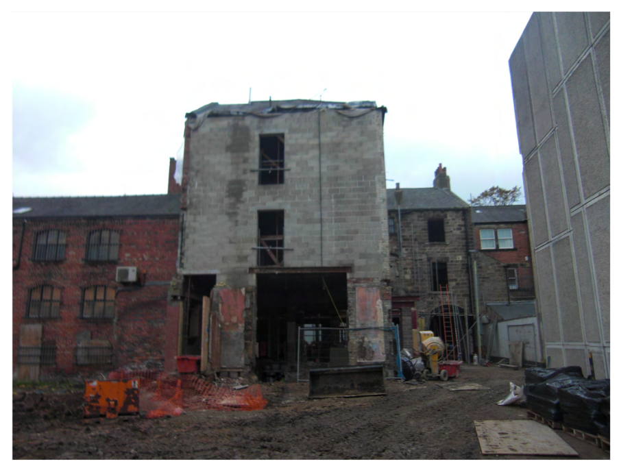
Plate 1. View of Site. Facing West.