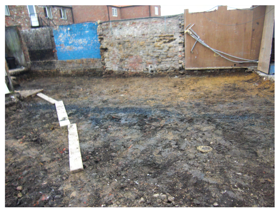
Plate 3. Area of Ground Reduction, Facing East.