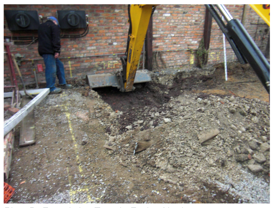
Plate 5. Foundation Trench. Facing North.