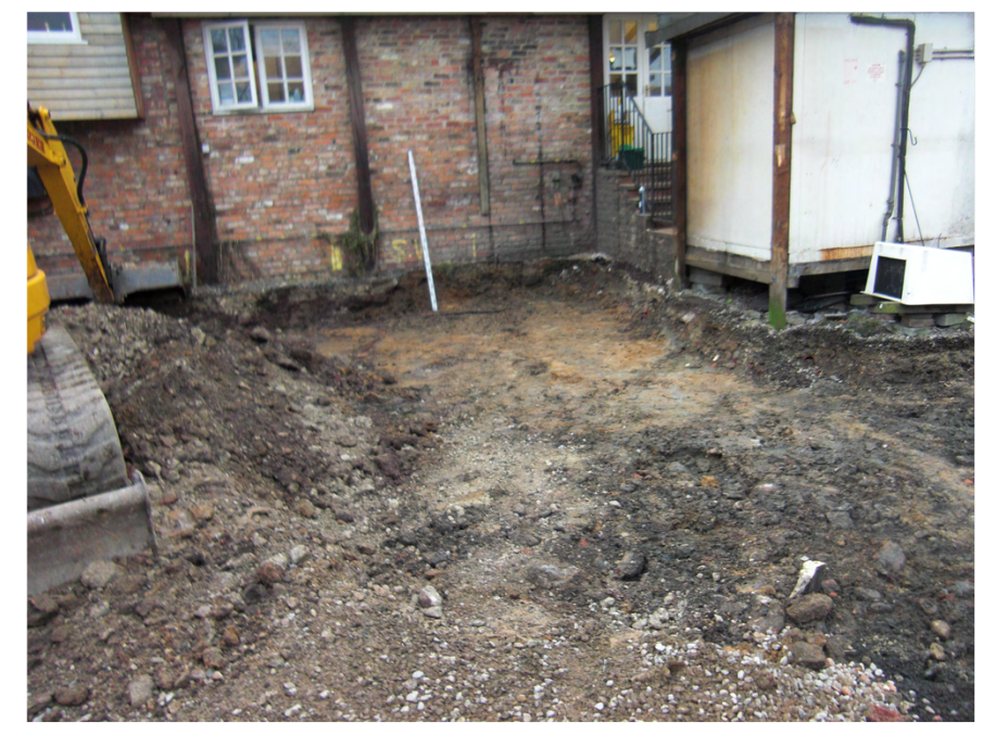
Plate 2. Site during ground reduction. Facing North.