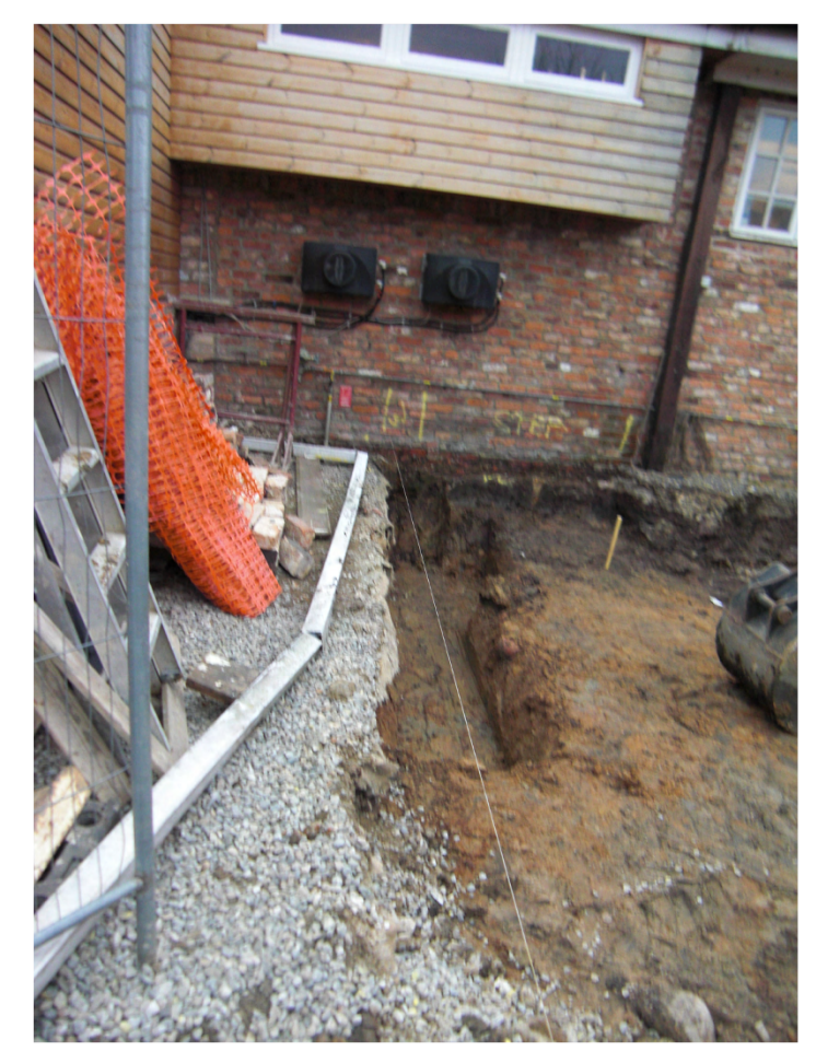
Plate 8. Foundation Trench. Facing North