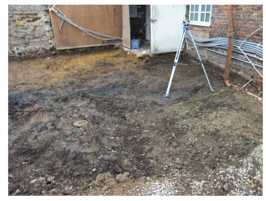
Plate 4. Area of Ground Reduction. Facing East.