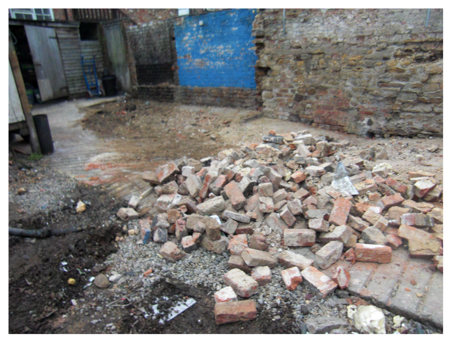
Plate 1. Site after clearance. Facing North-east.