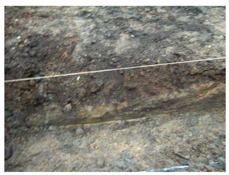
Plate 7. Foundation Trench. Facing East.