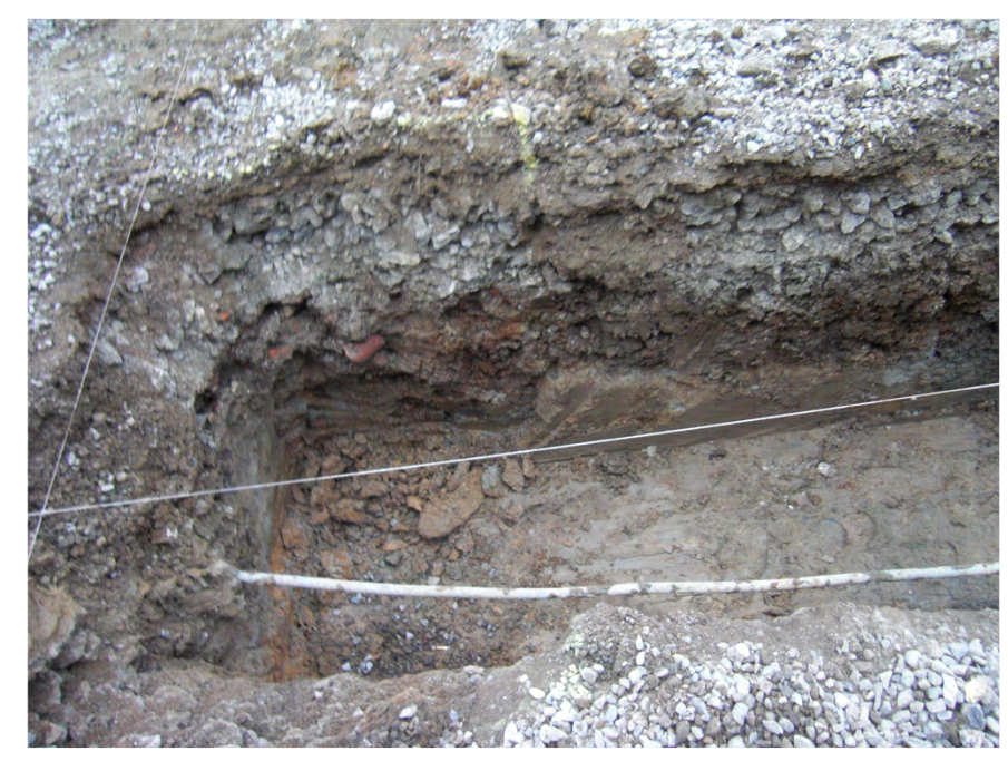
Plate 6. Foundation Trench. Facing East.