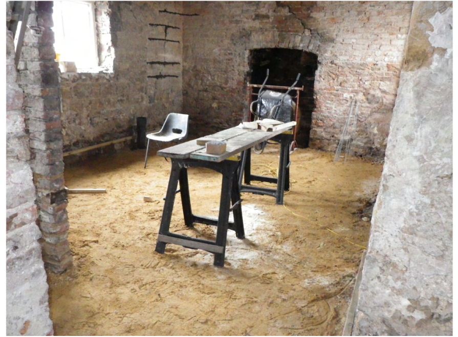
Plate 8. Interior of the Old Manor House.