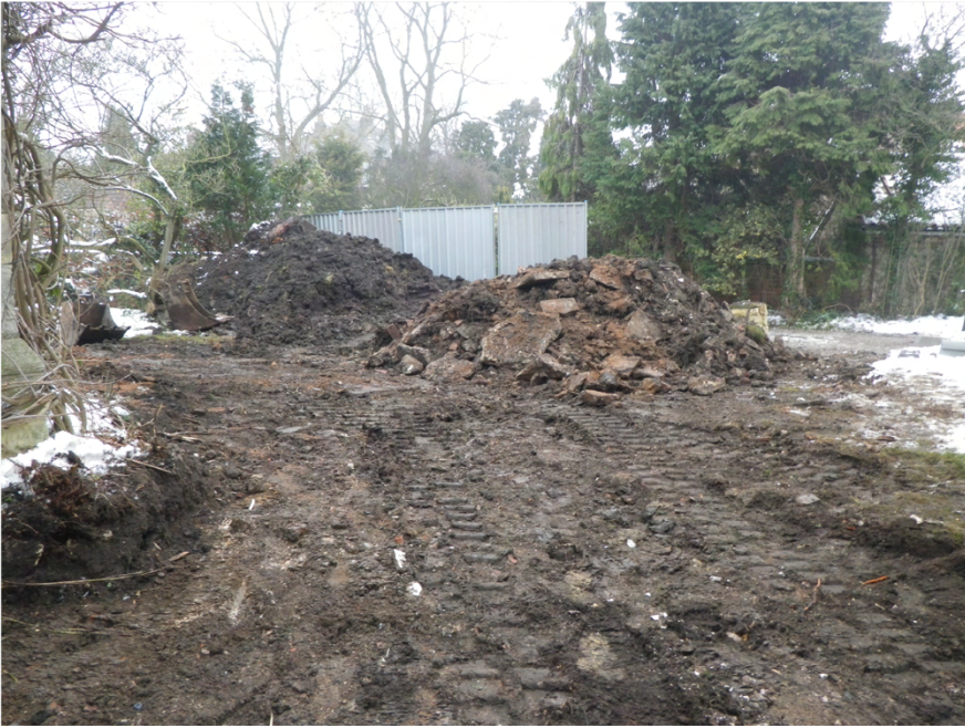
Plate 2. View of site during topsoil Strip.