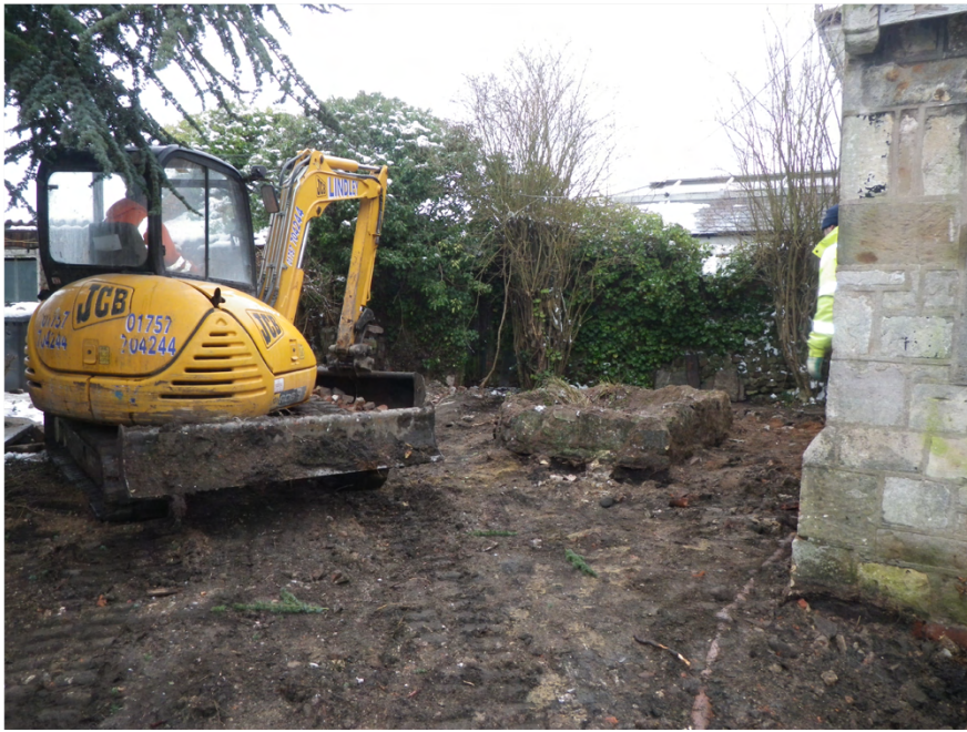
Plate 5. General View of Footings.