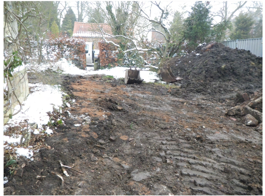
Plate 6. General View of Footings.