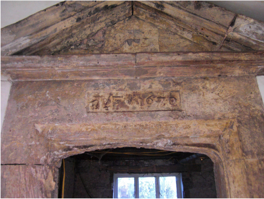
Plate 9. View of original Door.