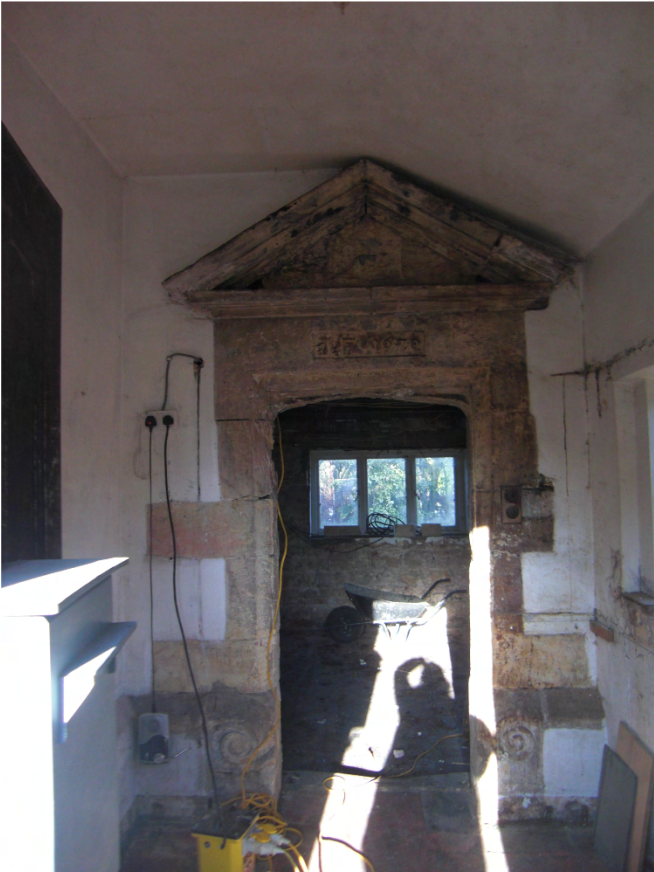
Plate 10. View of original entrance.