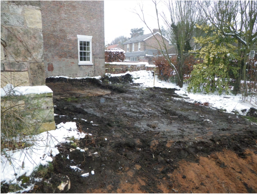
Plate 7. General View of Footings.