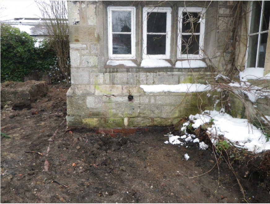
Plate 4. General View of Footings.