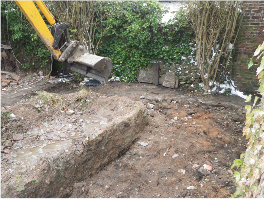
Plate 3. General View of Footings.