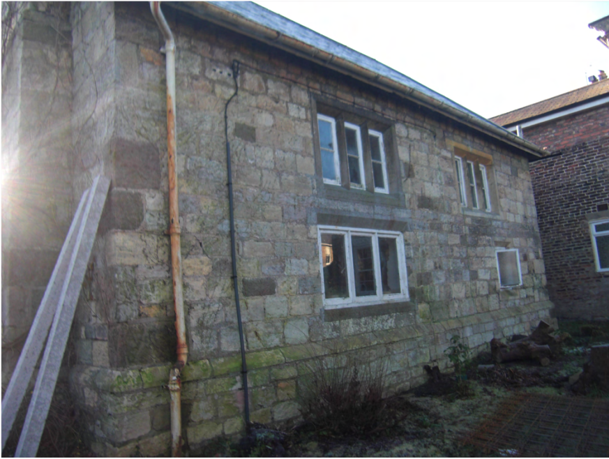
Plate 1. View of site before Strip.