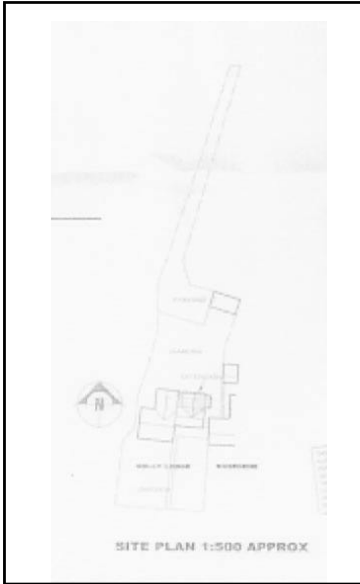
Figure 2. Proposed Development Area.