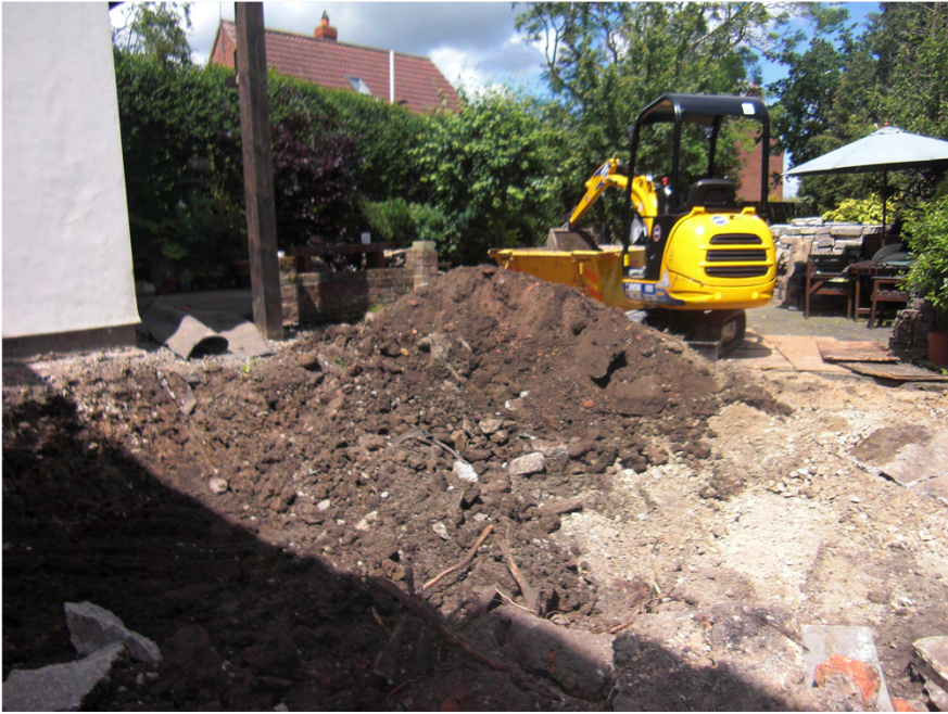
Plate 3. Area of New Extension.