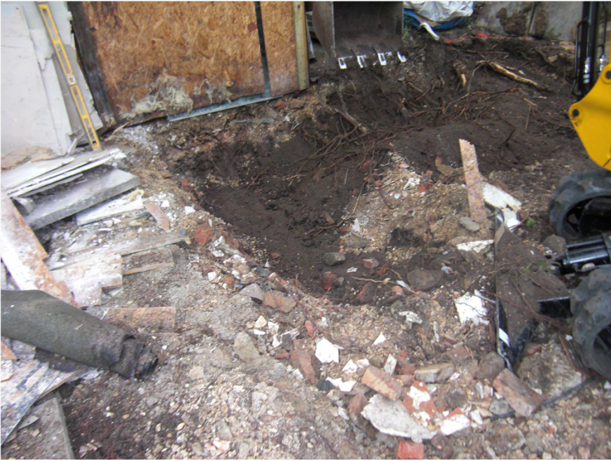
Plate 4. Area of New Extension.