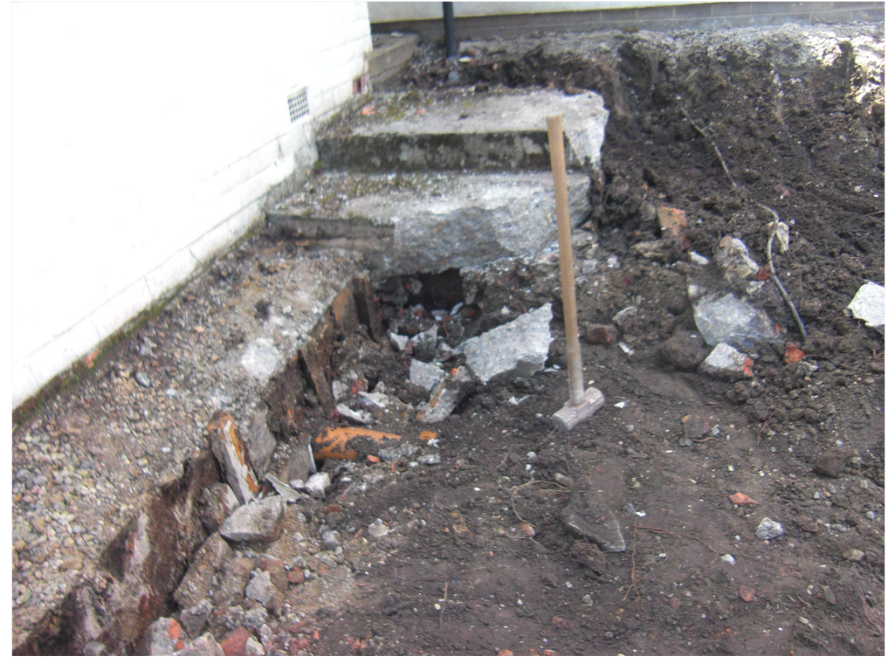
Plate 2. Area of prior disturbance.