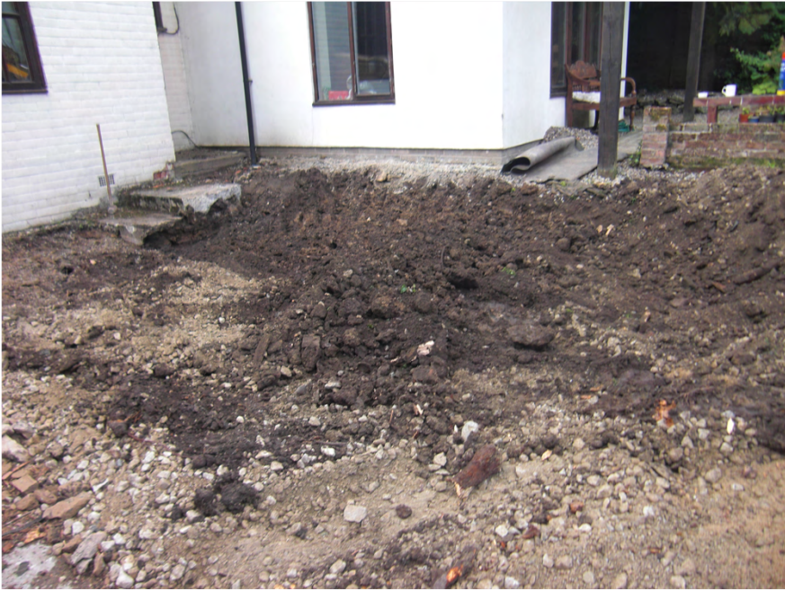
Plate 1. General View of Site.