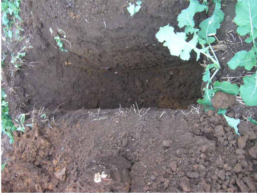
Plate 3. Testpit 122 (Evaluation Trench 17).