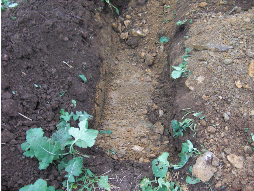
Plate 1. Testpit 102 (Evaluation Trench 8).