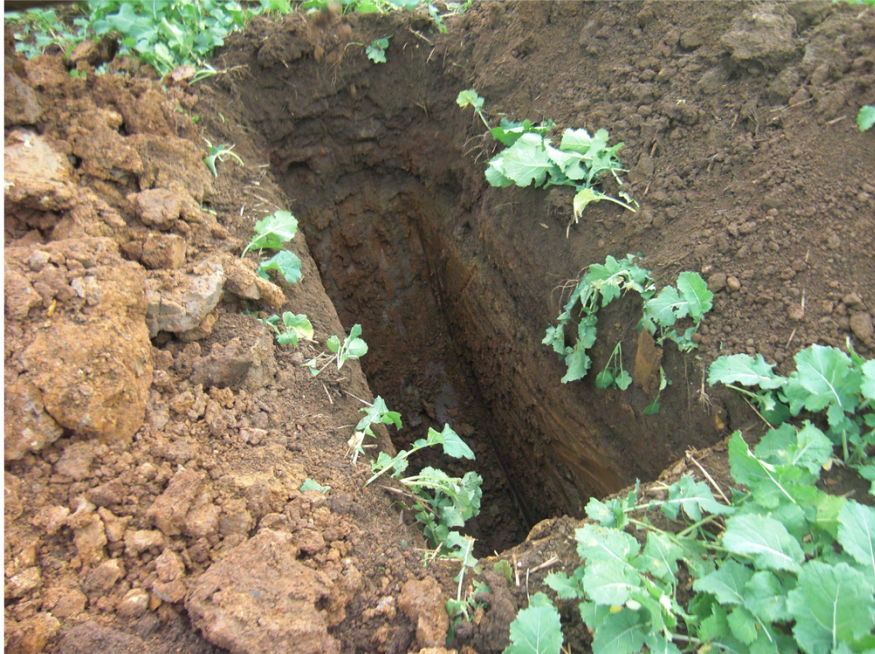
Plate 5. Testpit 127 (Trench 11).