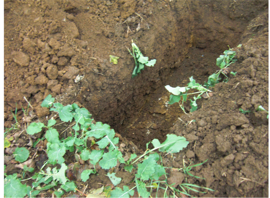
Plate 2. Testpit 119 (Evaluation Trench 9)