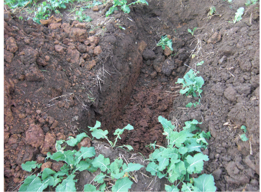
Plate 4. Testpit 126 (Evaluation Trench 126)