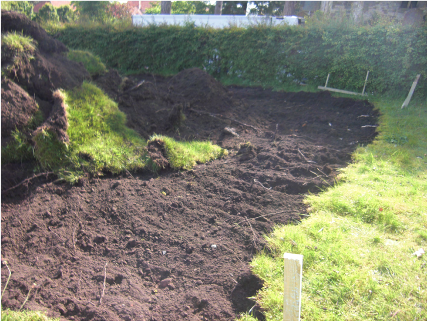
Plate 1. Topsoil Strip. Facing East.