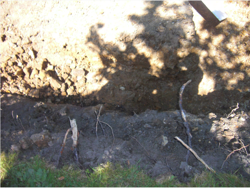
Plate 6. View of Footings.