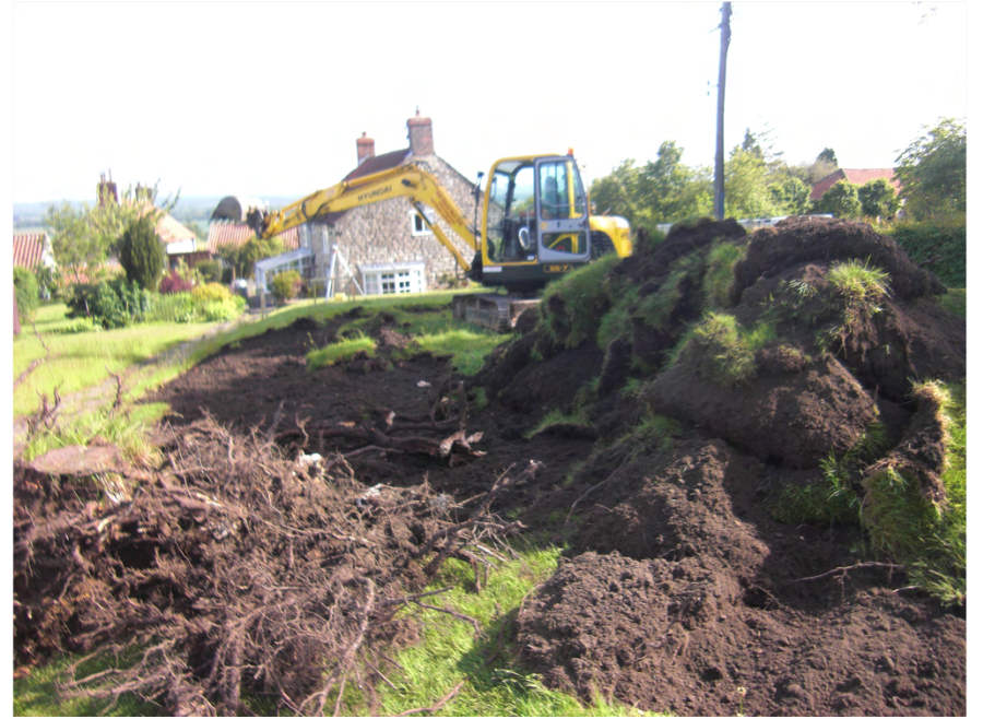
Plate 2. Topsoil Strip. Facing North.