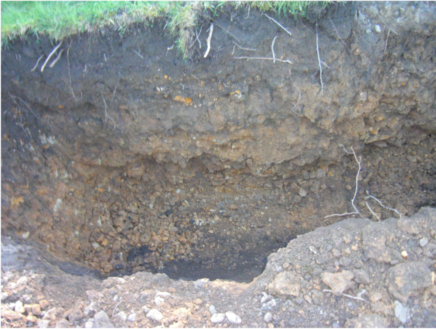
Plate 5. View of Footings.