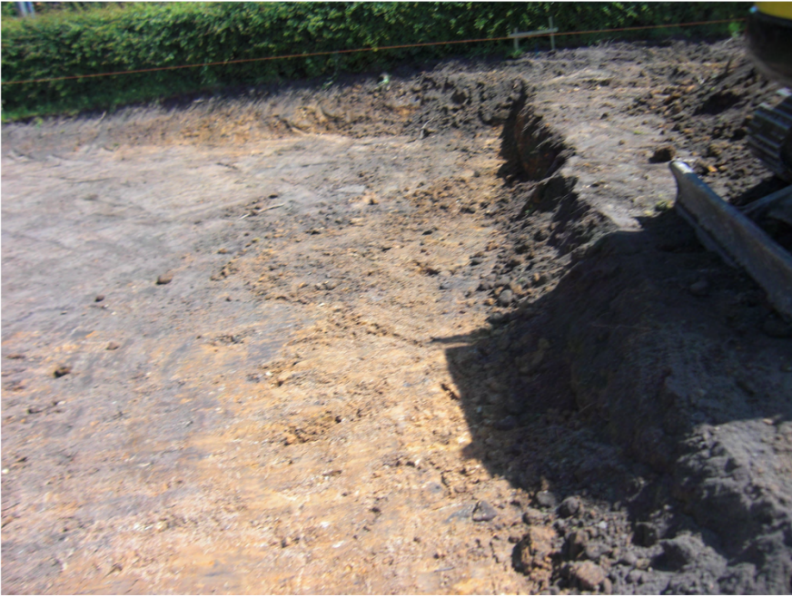
Plate 4. View of area of Footings.