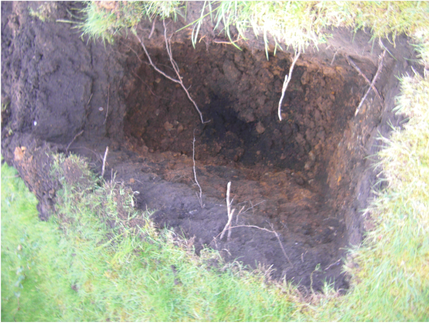
Plate 3. Testpit to show depth of foundation.