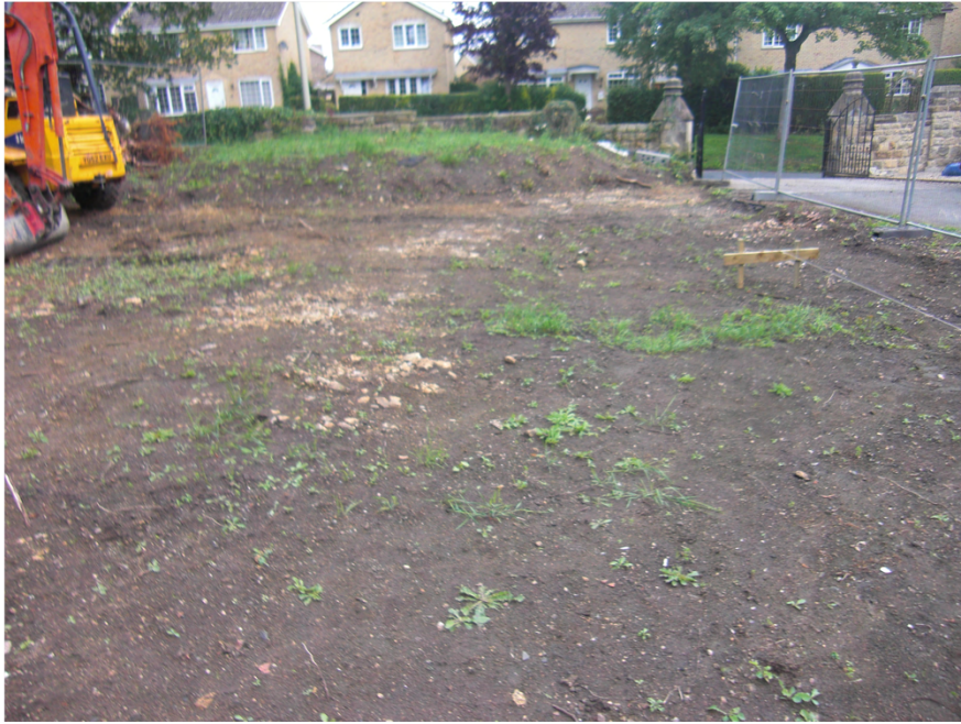
Plate 2. General View of Site. Facing North-East.