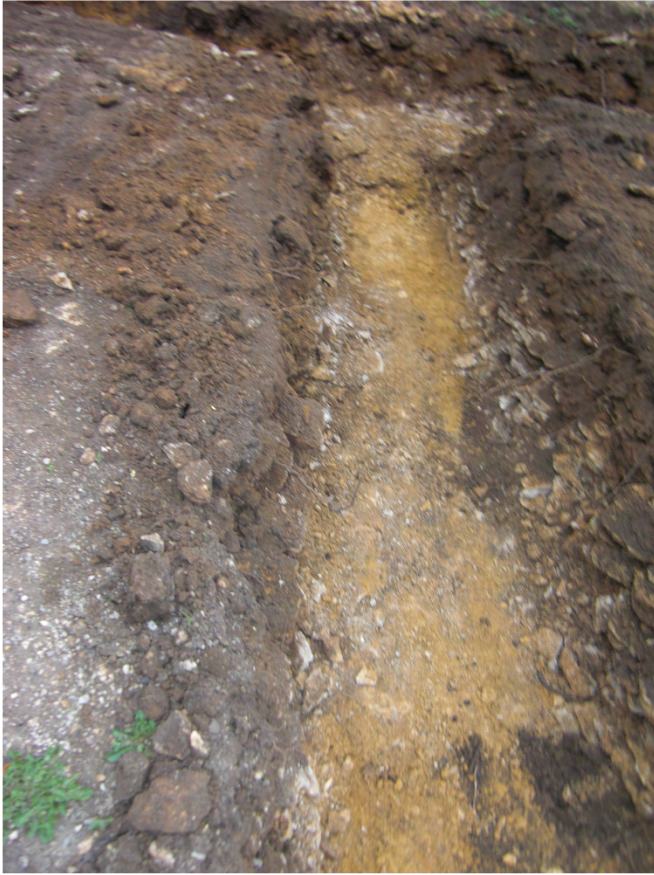
Plate 5. Foundations.