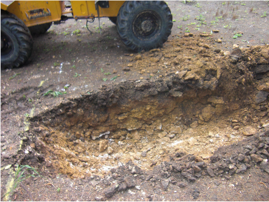
Plate 3. Foundations.