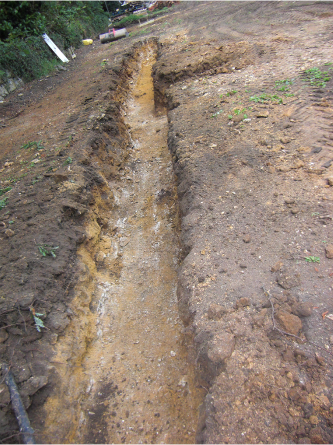
Plate 4. Foundations.