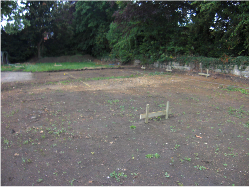
Plate 1. General View of Site. Facing South-west.