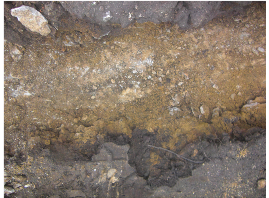
Plate 6. Foundations.