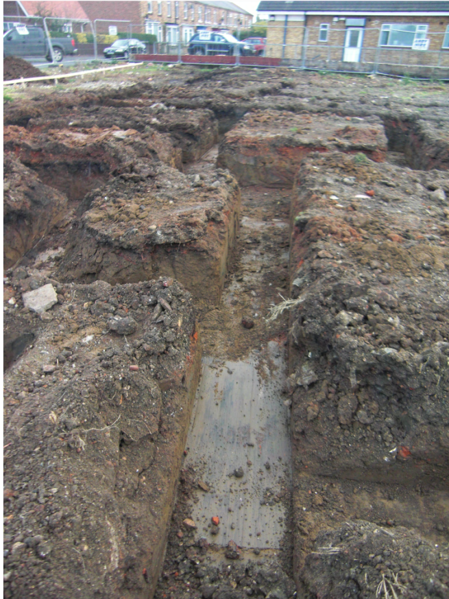
Plate 5. Strip Footings. Facing West.