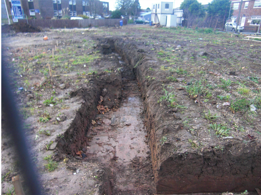
Plate 3. Strip Footings. Facing East.