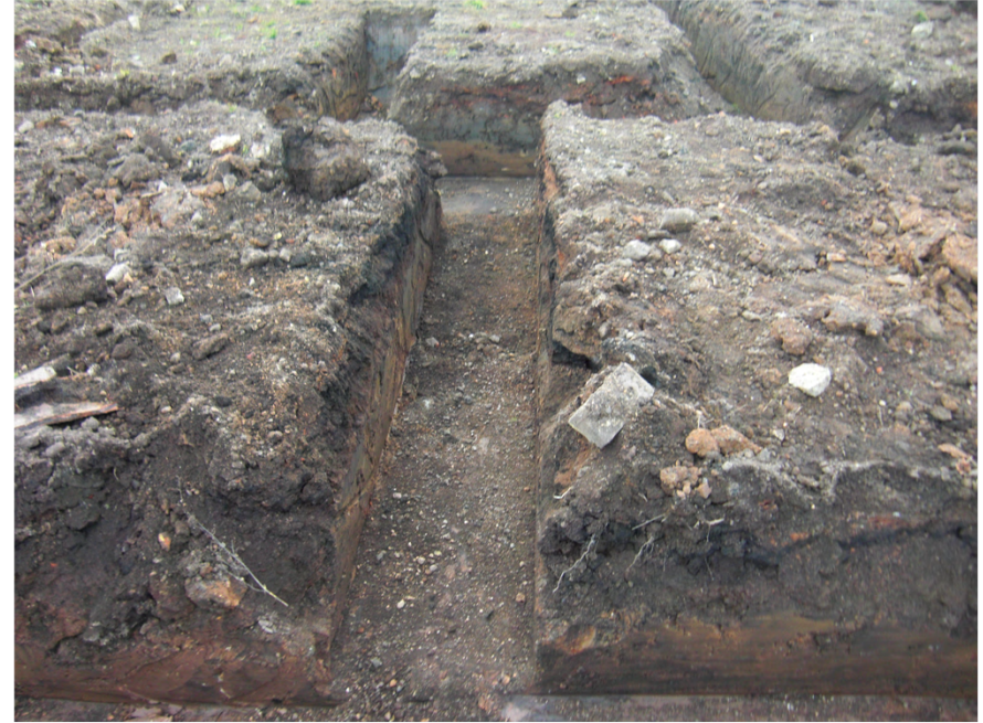
Plate 8. Strip Footings. Facing North.