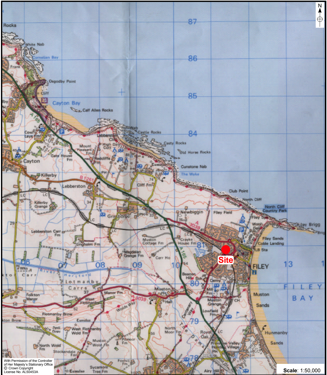
Figure 1. Site Location Plan