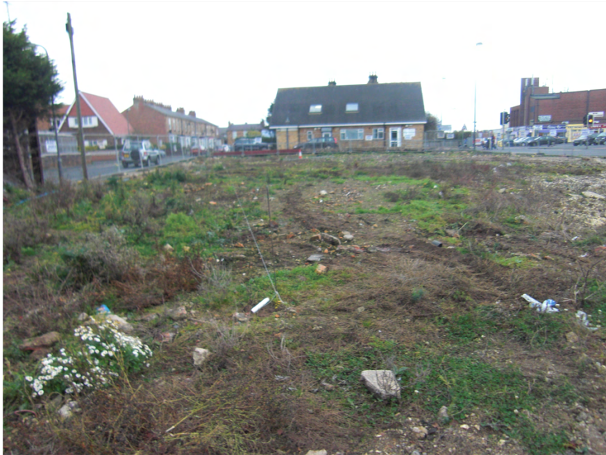
Plate 1. View of Development Area. Facing East.