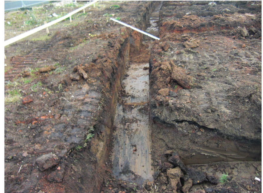
Plate 6. Strip Footings. Facing West.