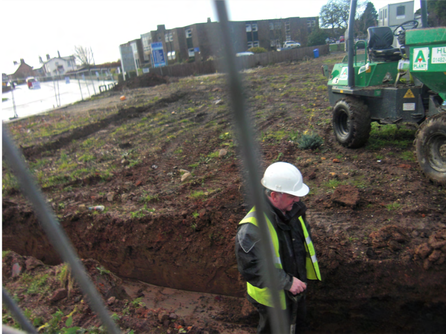
Plate 4. Strip Footings. Facing East.