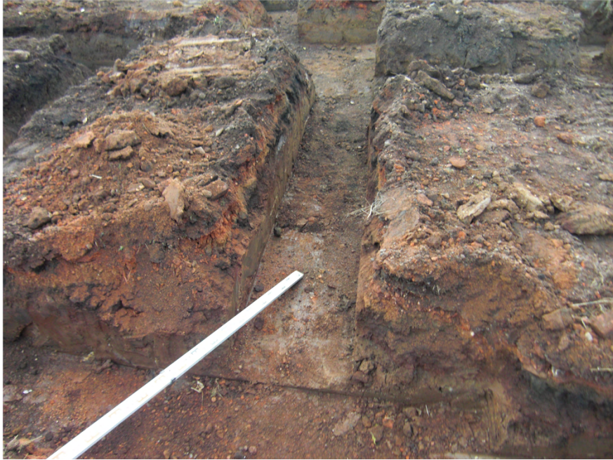
Plate 7. Strip Footings. Facing North.