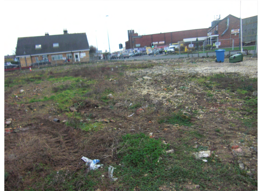
Plate 2. View of Development Area. Facing South-east.