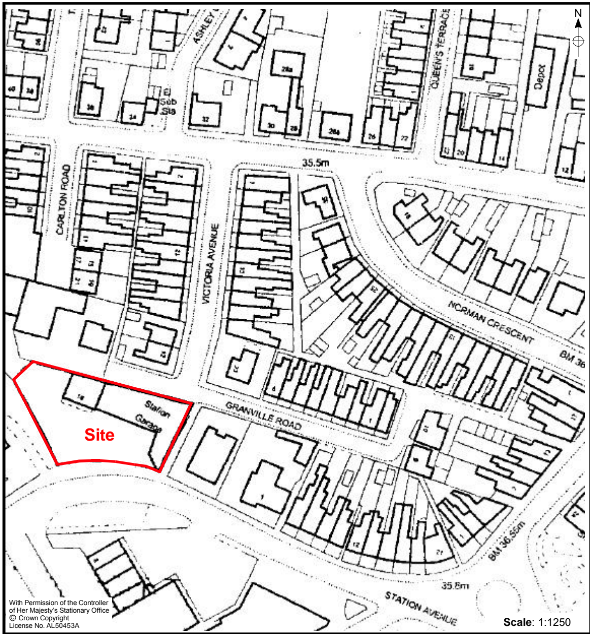
Figure 2. Area Of Archaeological Strip and Record.