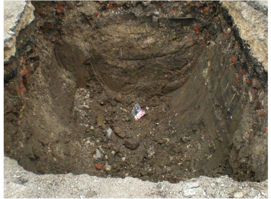
Plate 2. Trench after Excavation. Facing North.