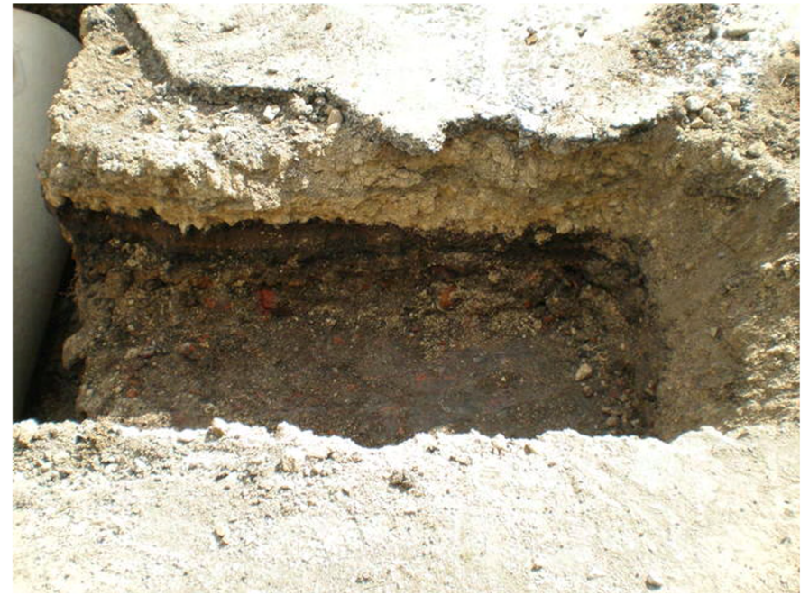
Plate 4. Section through Silt Trap. Facing South.