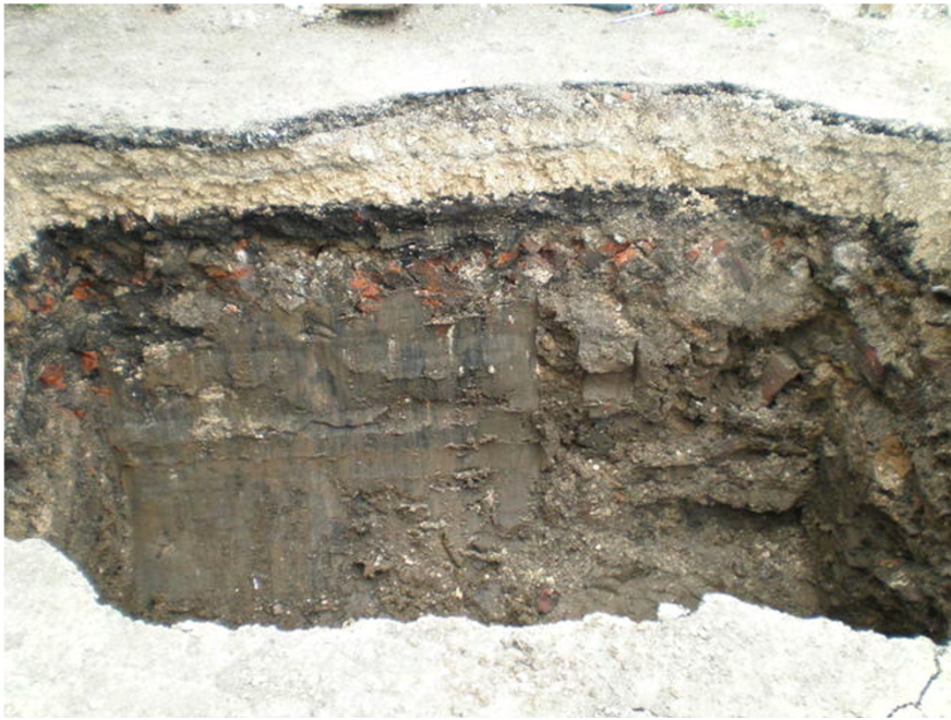
Plate 3. Section through Excavation Trench. Facing East.