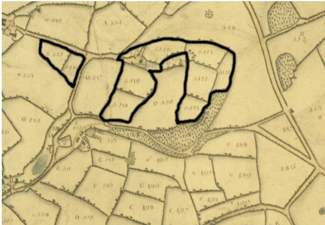
Figure C.1: 18 th Century enclosure map of Alderley Edge. Cheshire Archives.