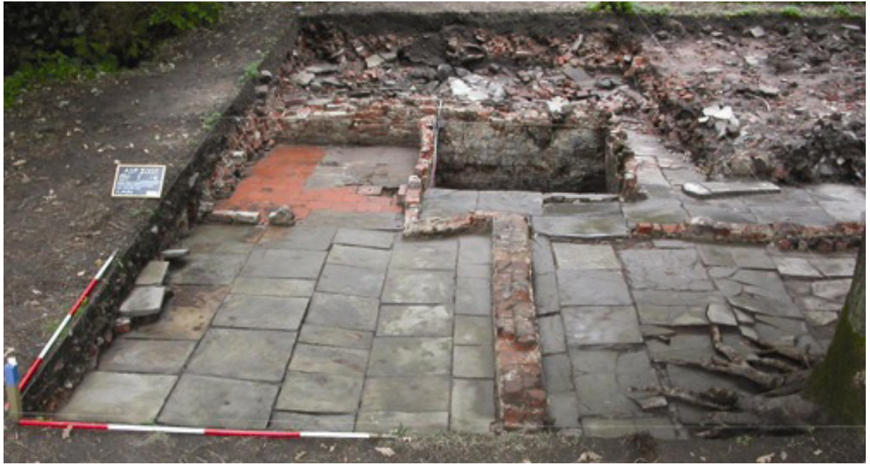
Figure E.5: Northern section of Area A, including cellar and kitchen features.