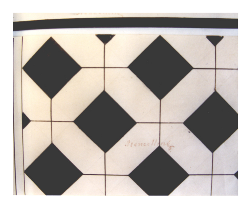
Figure H.1: Pattern for stencilling, 18<sup>th</sup> century.