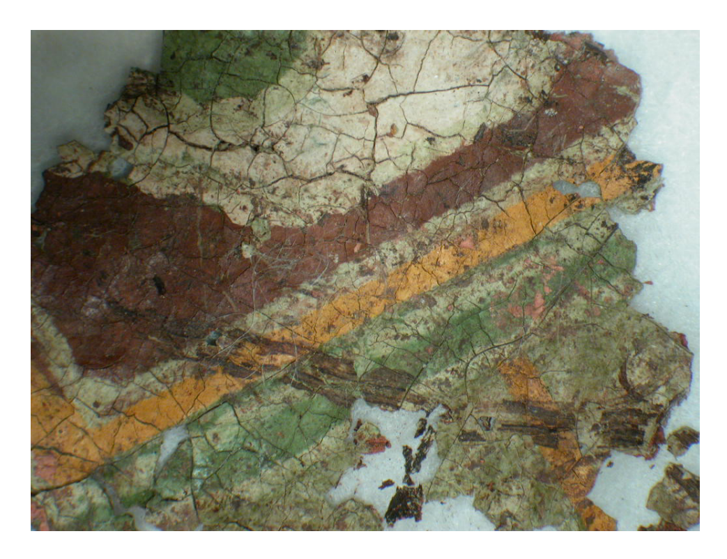
Figure K.1: Design 4: green, yellow and brown lines or tiles on a white background.