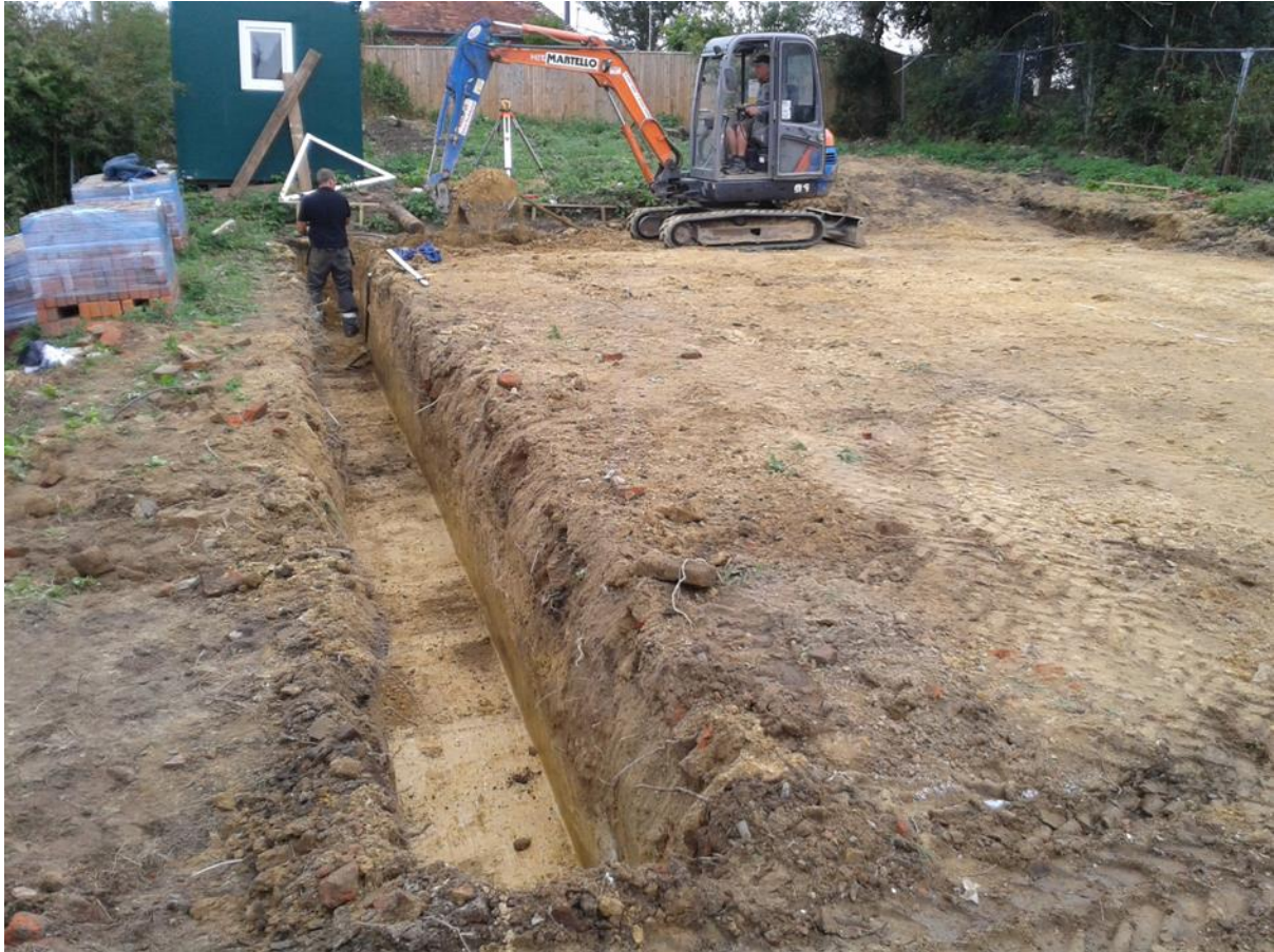
General shot looking west showing southern footing and area of topsoil strip.