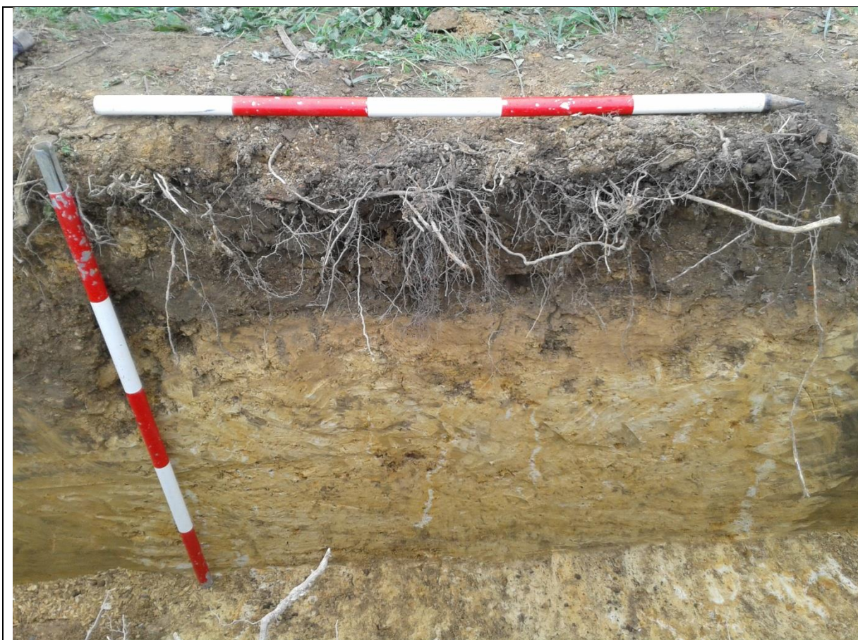
Contexts 1 to 3. North facing section.