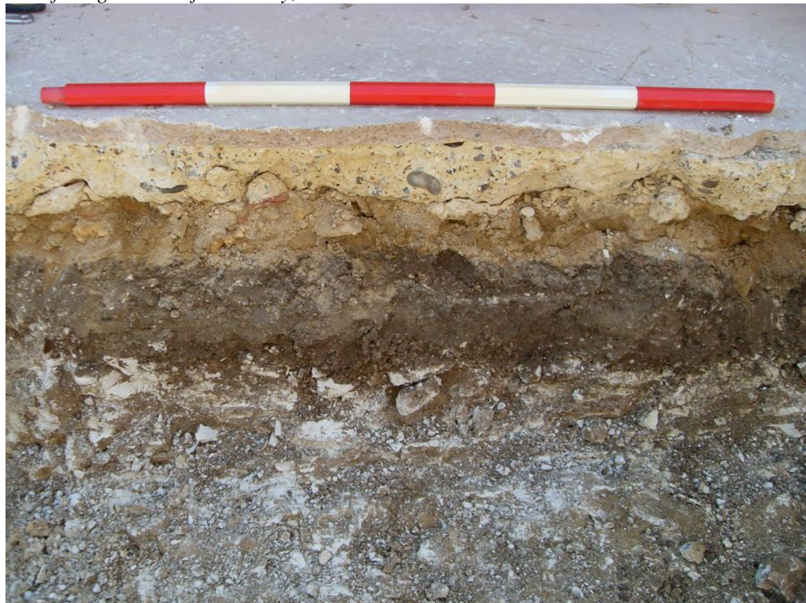
North facing section showing Contexts 2 and 3