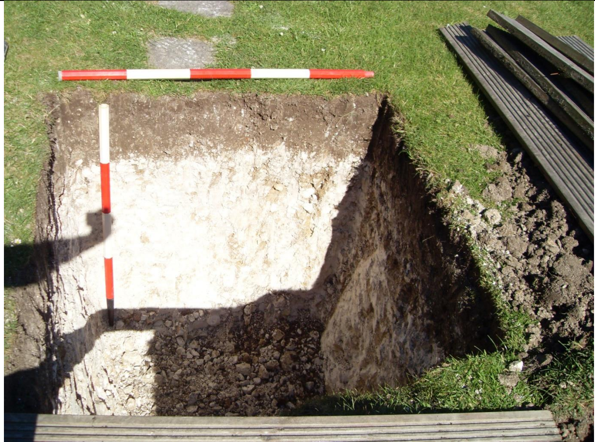
West facing section of soakaway; Contexts 1 & 2.