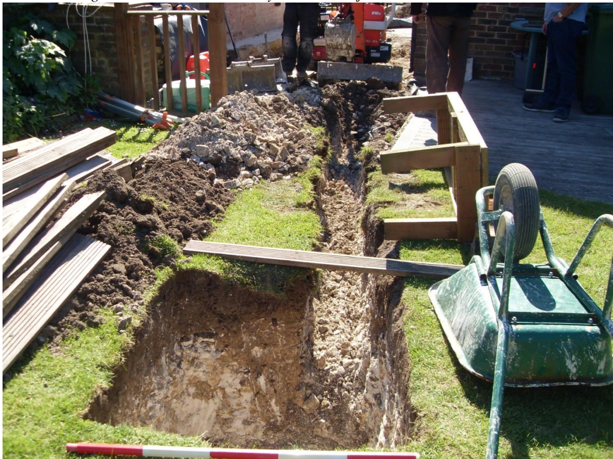
Photo showing area monitored-Soakaway and area adjacent to house.