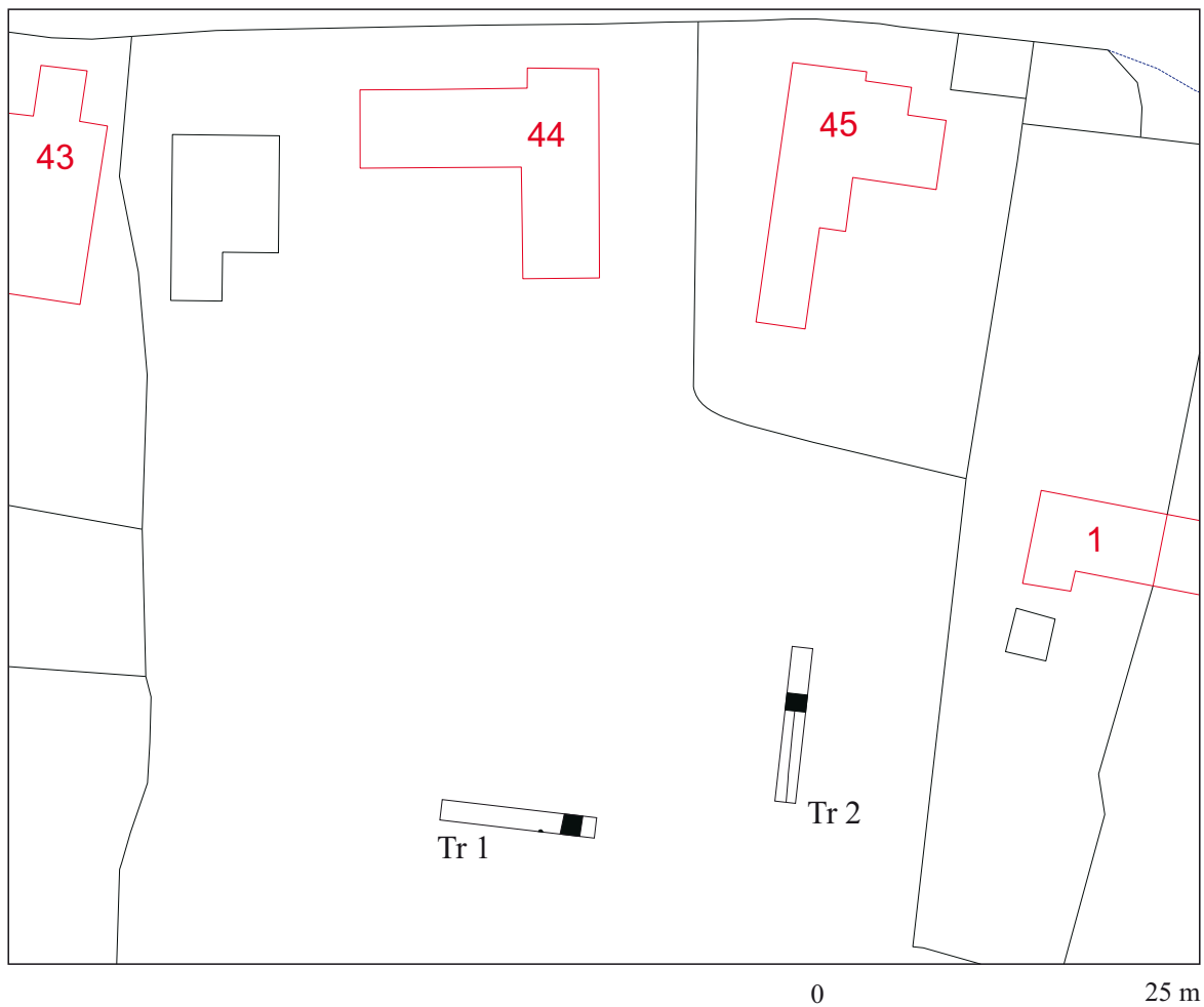
Figure 1. Site location