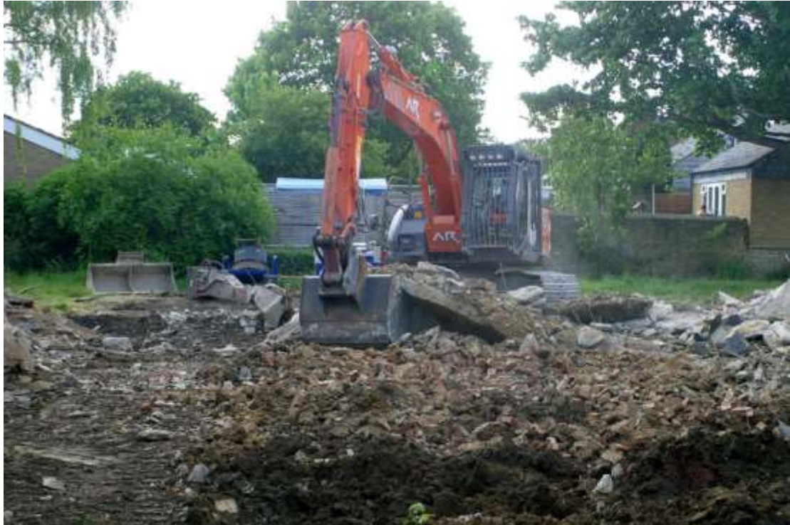
Plate 1: Demolition works in south part of monitored area, looking west.