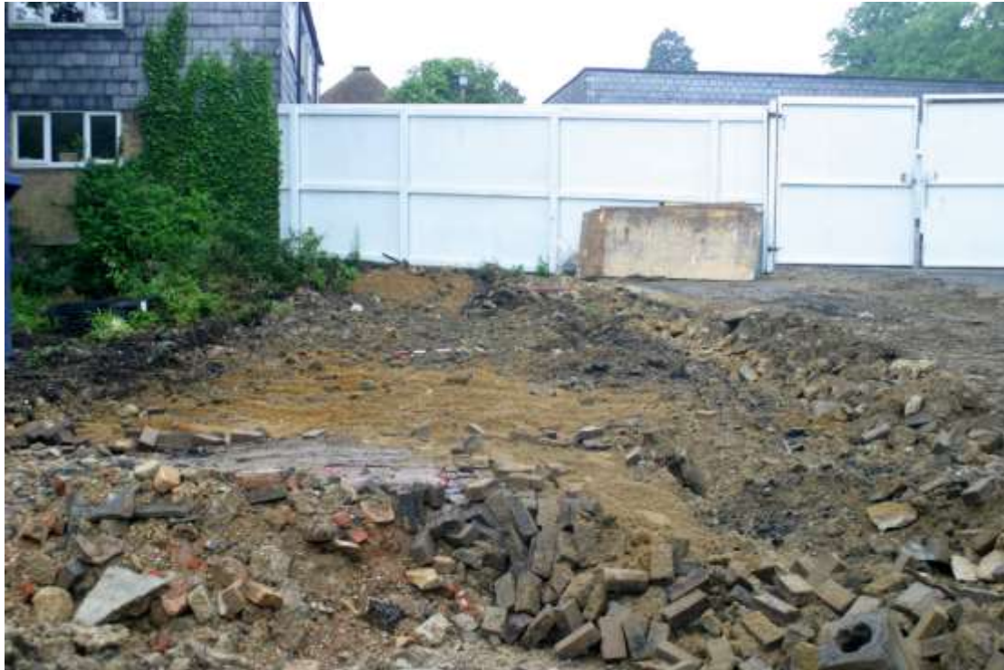
Plate 9: General overview of driveway after removal of paving blocks, looking west.