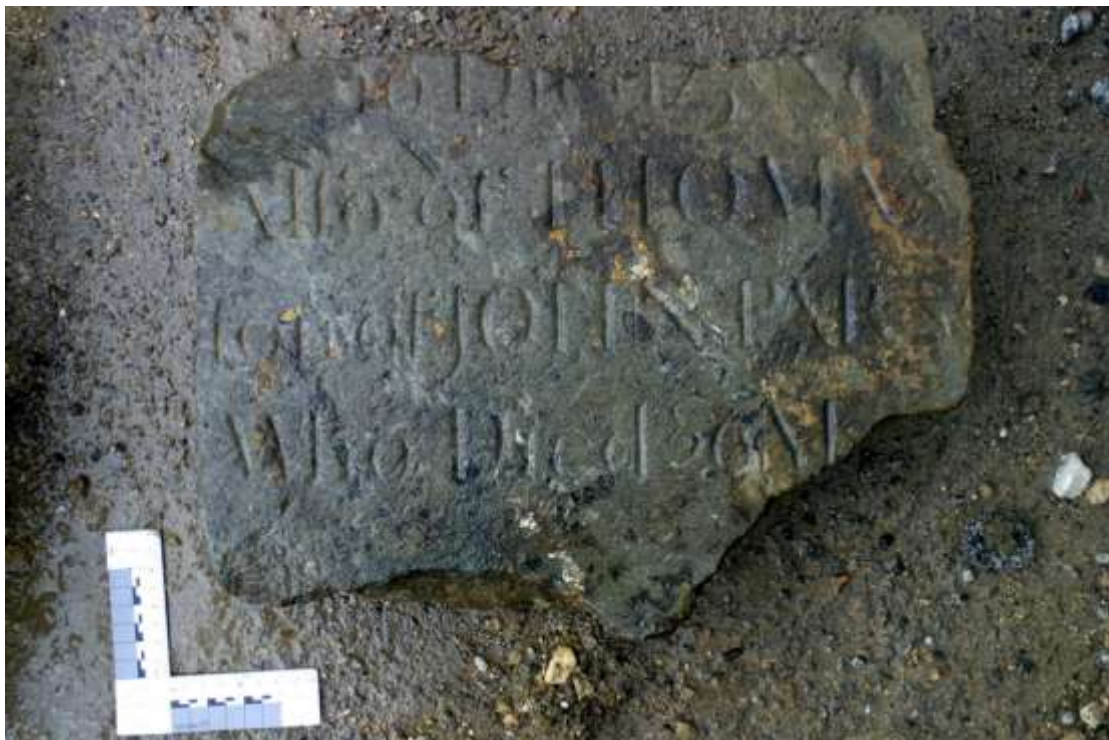
Plate 10: Fragment of gravestone.