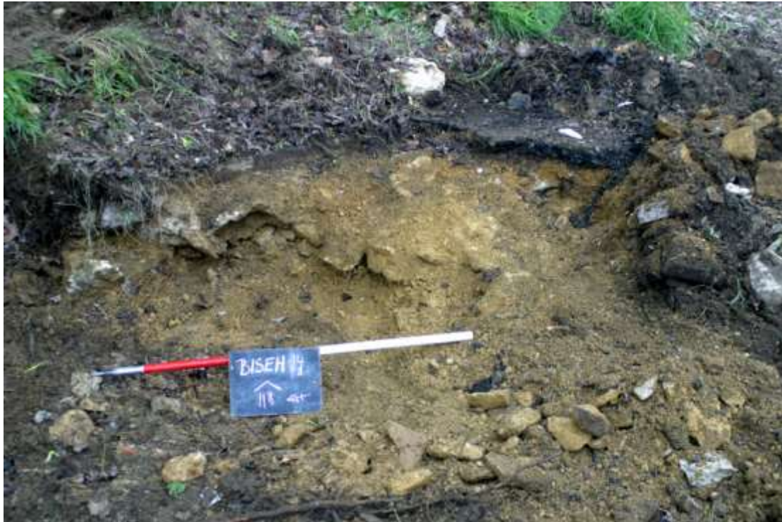
Plate 7: Remains of wall 118 , looking east.