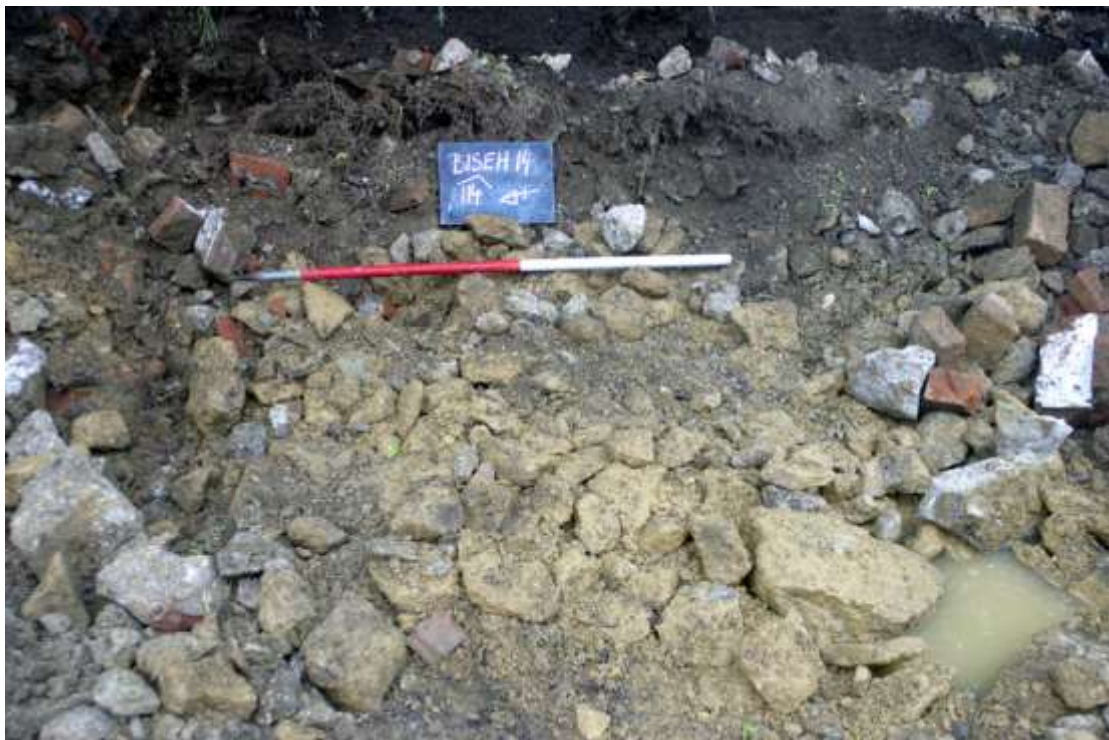
Plate 6: Stone rubble from the wall 114 , looking east.