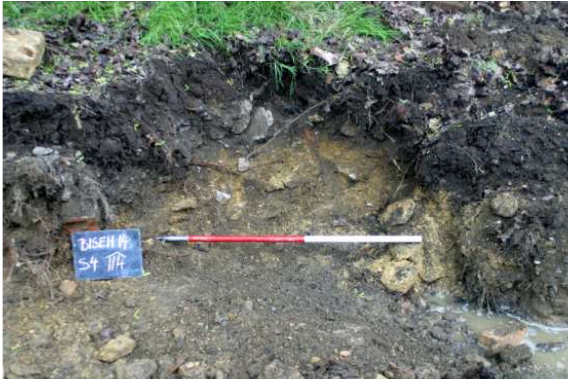
Plate 5: Remains of wall 114 , looking east.