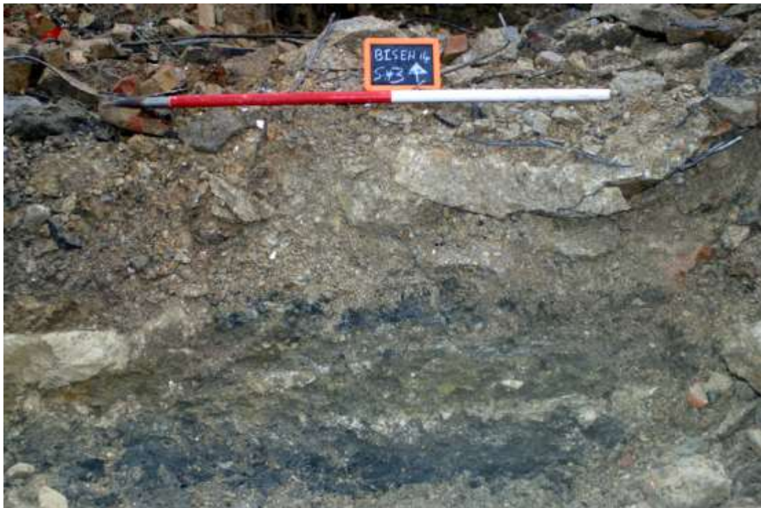
Plate 4: View of floor and occupation deposits (108), (109), (110), (111) and (112), looking north.