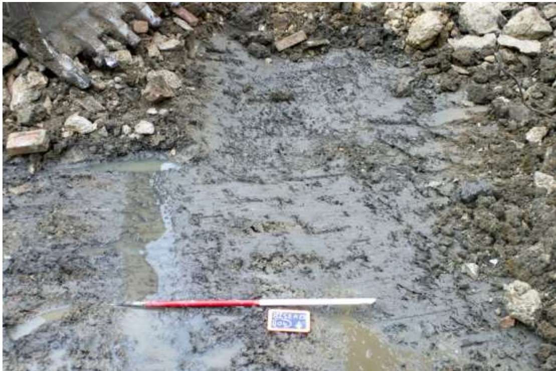
Plate 2: Alluvial deposit (104), looking south.