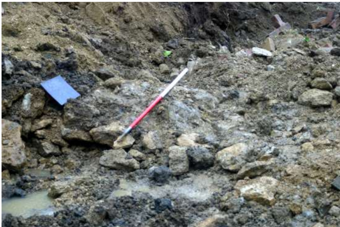
Plate 8: Remains of wall 120 , looking southwest.