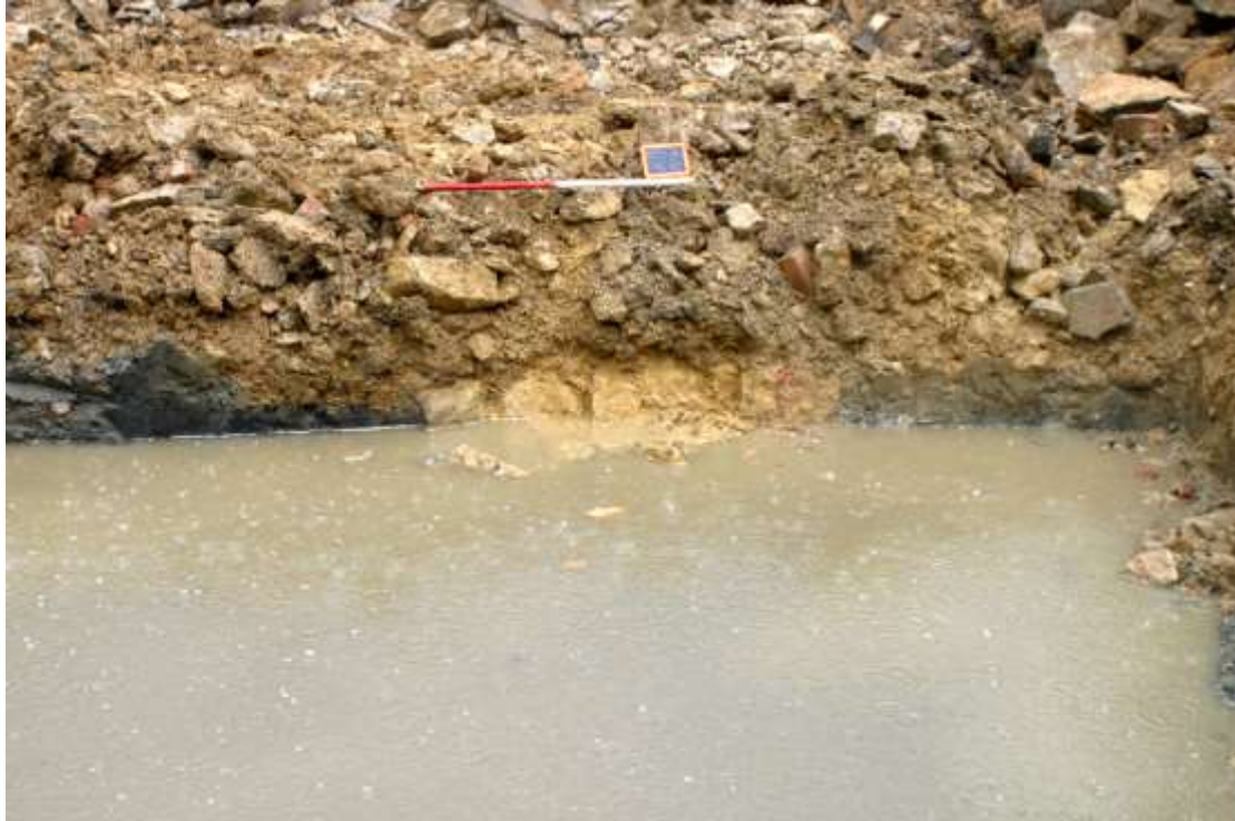
Plate 3: General overview of wall 106 and alluvial deposits (105) and (107), looking east.