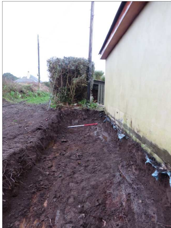
Trench on southern side of garage, looking west