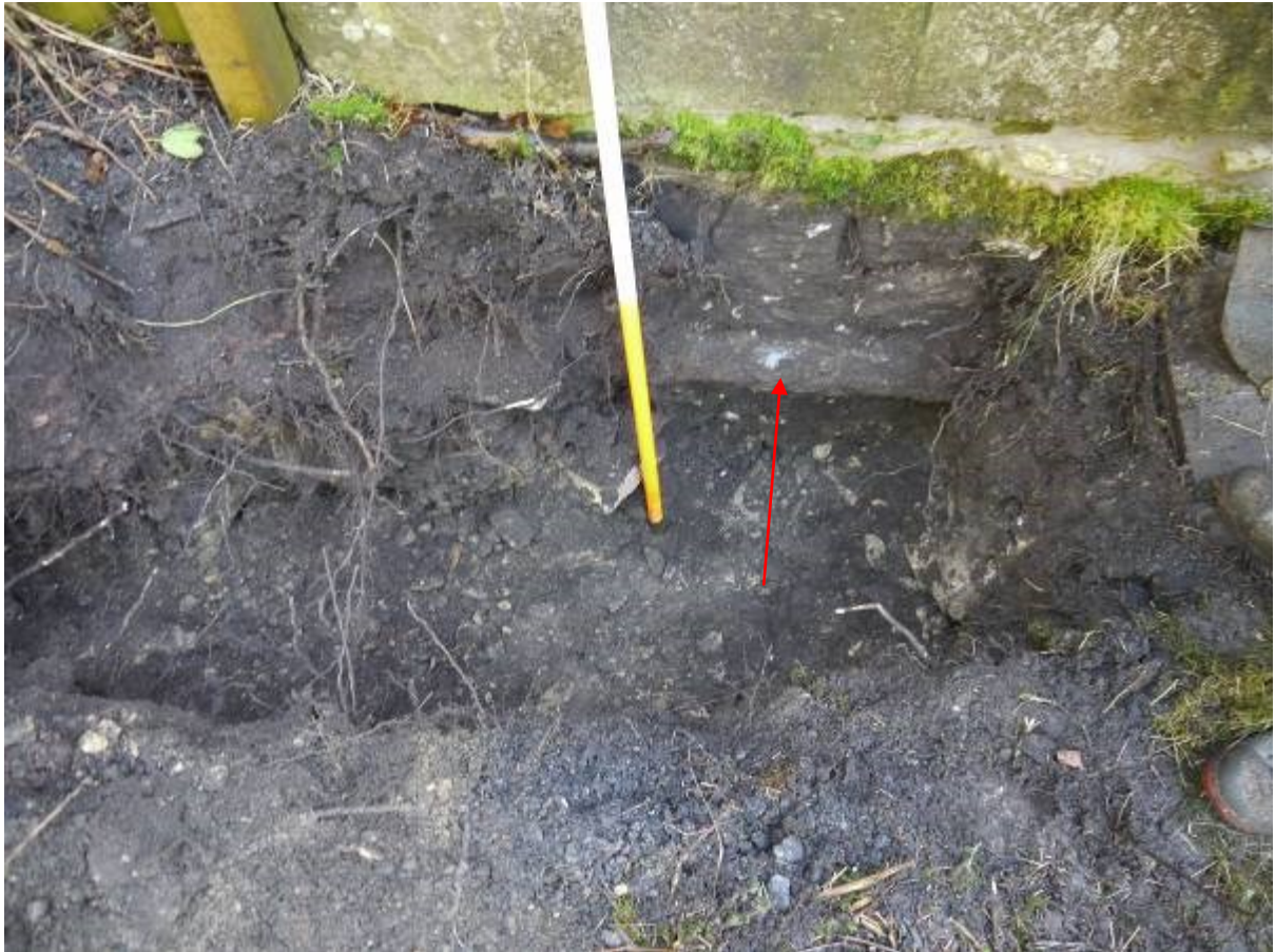
Illustration 4 Start of trench adjacent to wall of The Pineapple showing line of cast iron pipe (marked by red arrow) against wall face and soil deposit above natural sandstone slabbing.