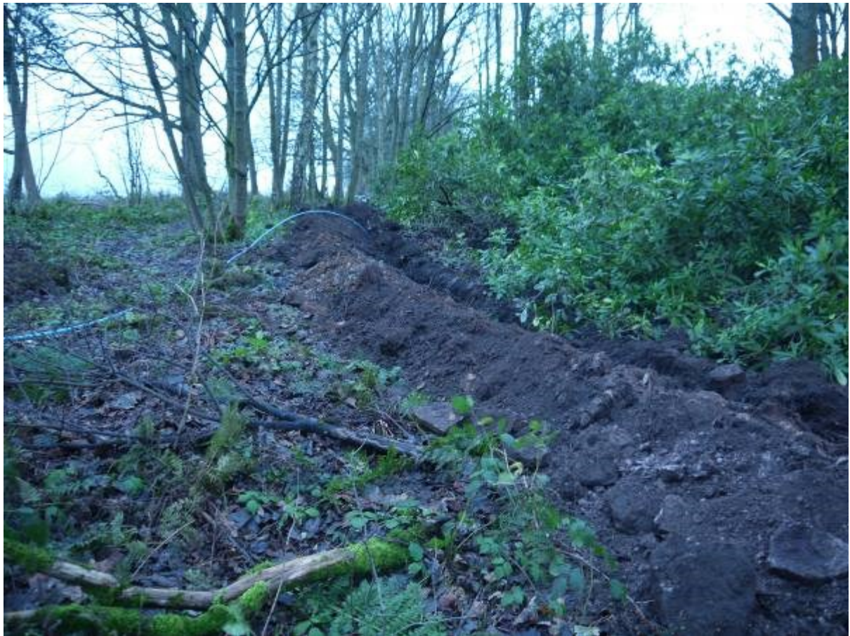
Illustration 9 Course of pipe trench running down hill towards fence around Garden Cottage