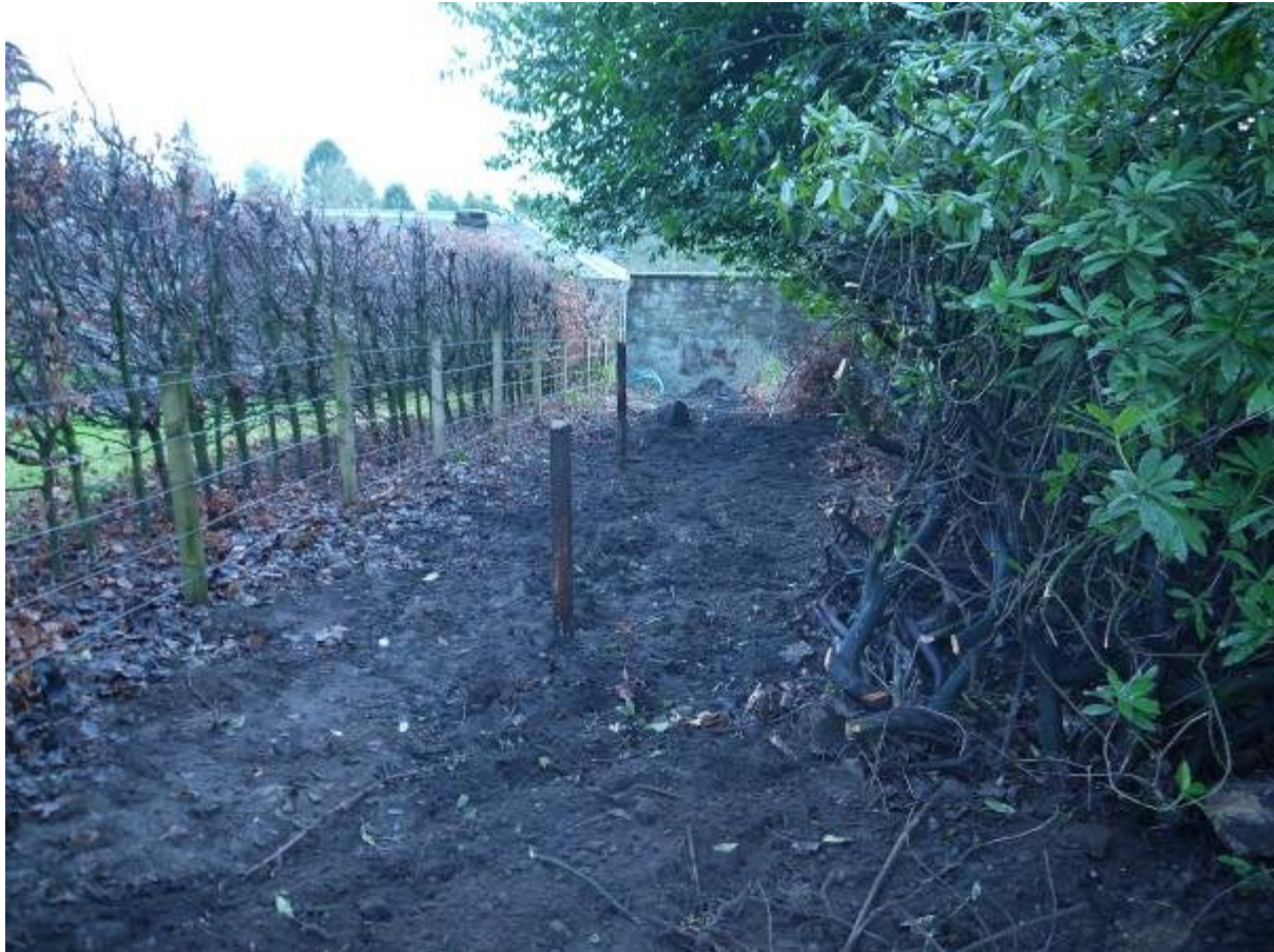
Illustration 5 Line of pipe trench (marked with wooden stakes) running towards The Pineapple and adjacent to fence line