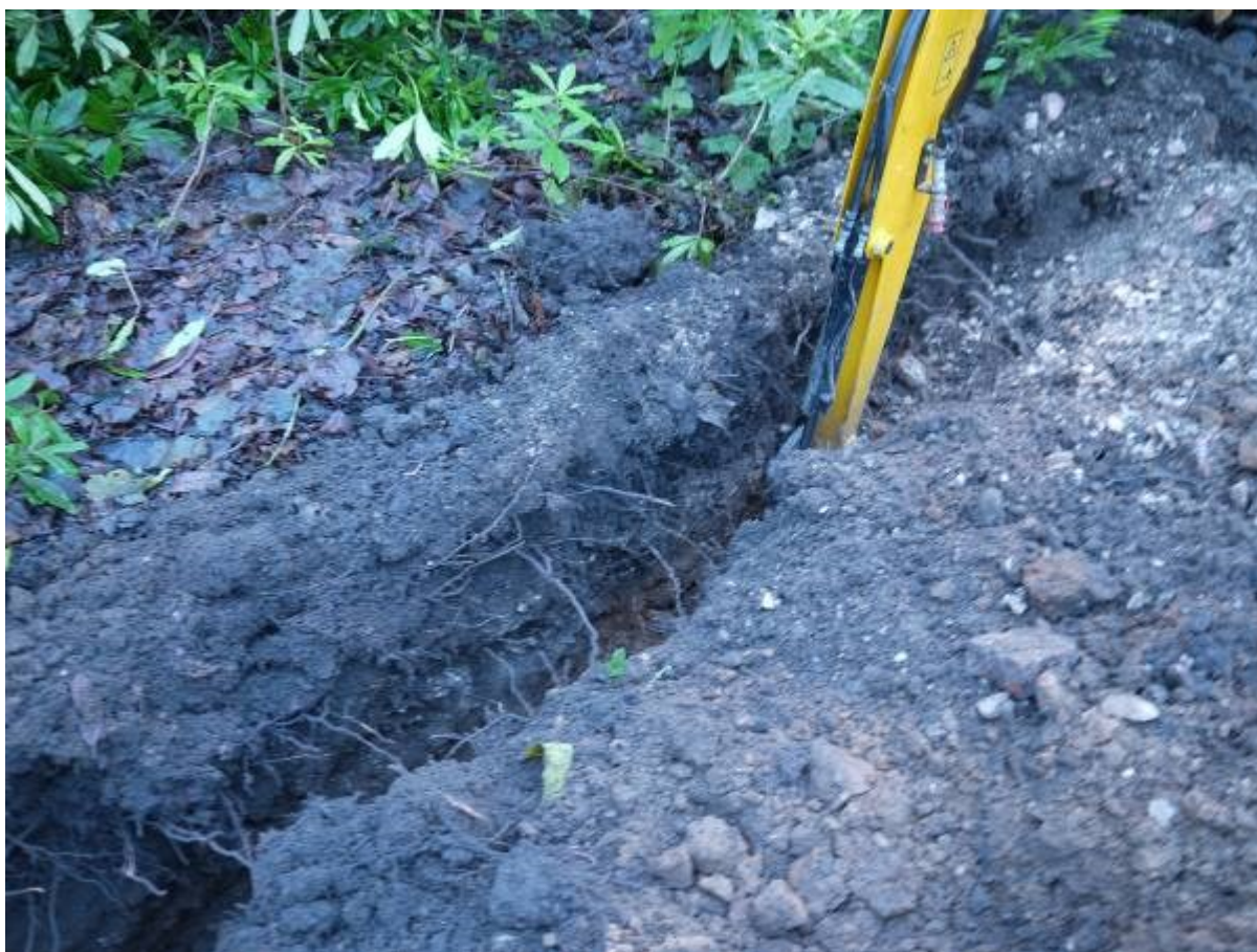
Illustration 8 Course of pipeline to North of walled garden showing deep soil deposit above natural sandstone slabbing and deposit of loose bricks and mortar waste (marked B on Illus 2)