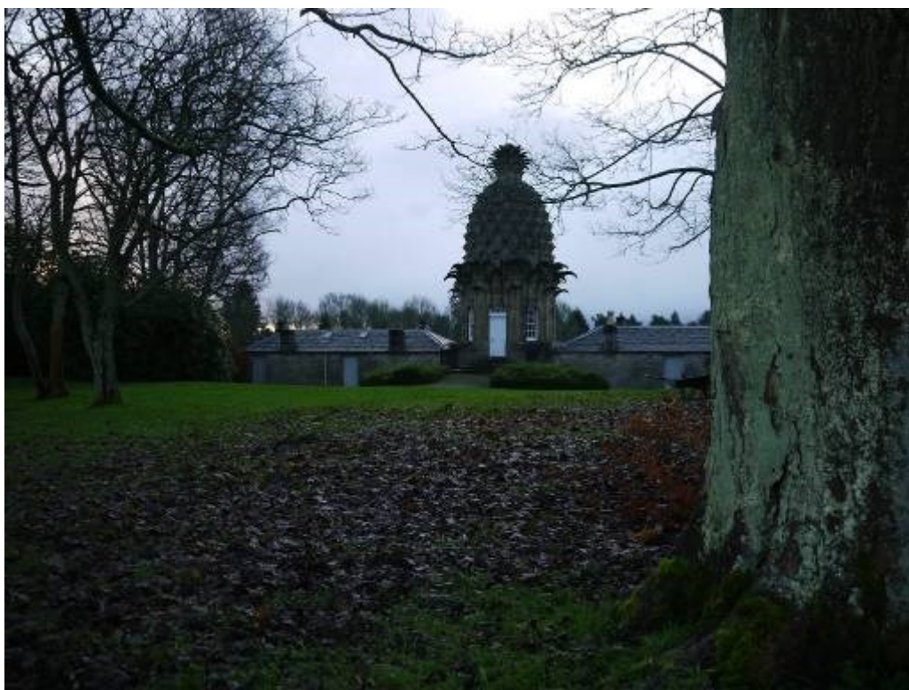
View of The Pineapple, Dunmore from the North