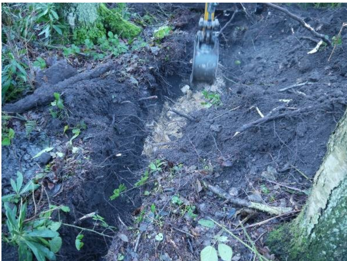
Illustration 6 Course of pipe trench to North of walled garden showing exposed surface of natural sandstone slabs below soil deposit (marked A on Illus 2)