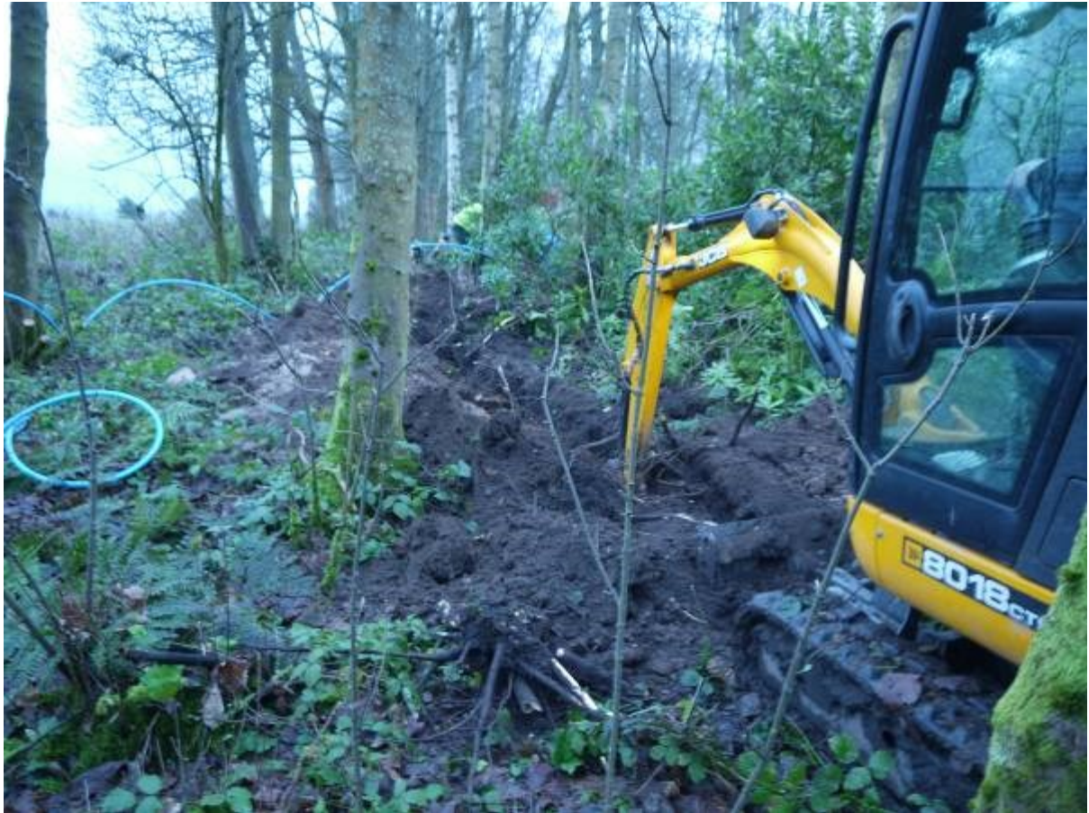
Illustration 7 Course of pipeline through forestry to North of walled garden