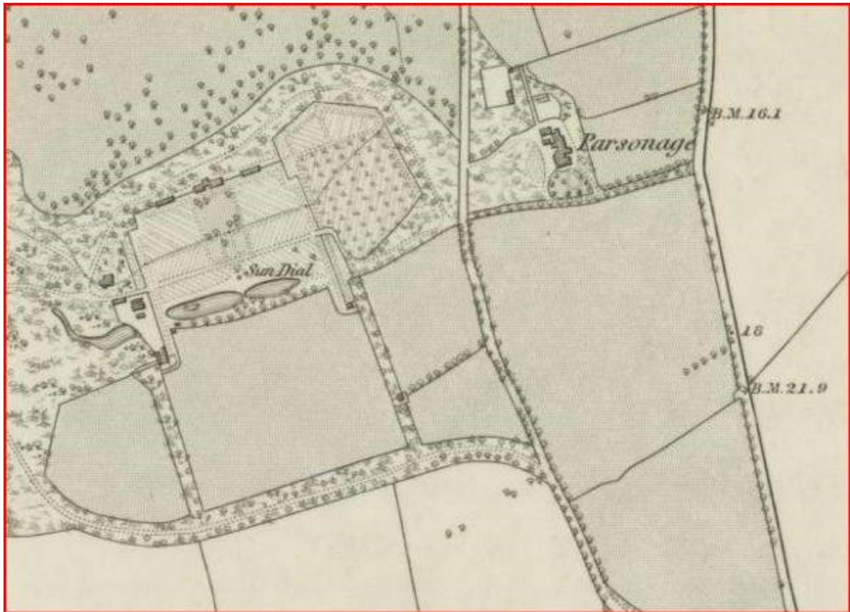
Illustration 2 The Pineapple and walled garden as shown on 1 st Edition Ordnance Survey map of 1862