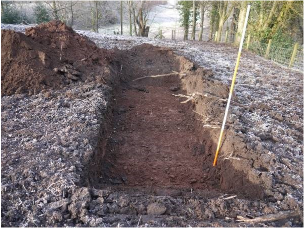
Illus 6 Trench A looking West