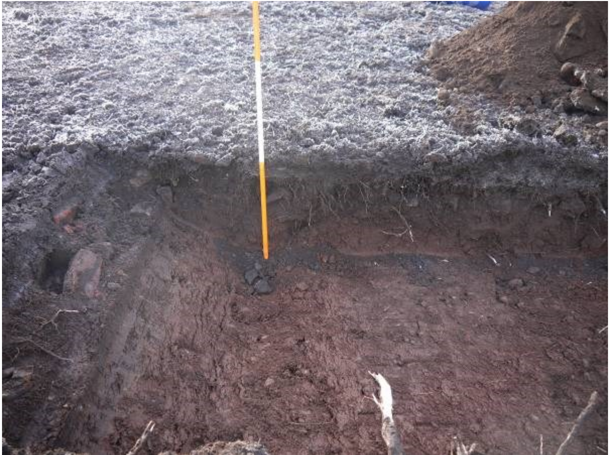
Illus 7 North facing section of Trench A