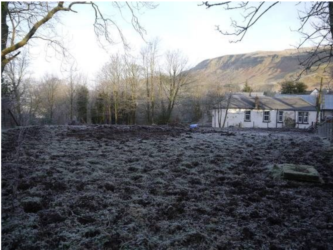
Site of new house looking North West (Campsie Fells in background)