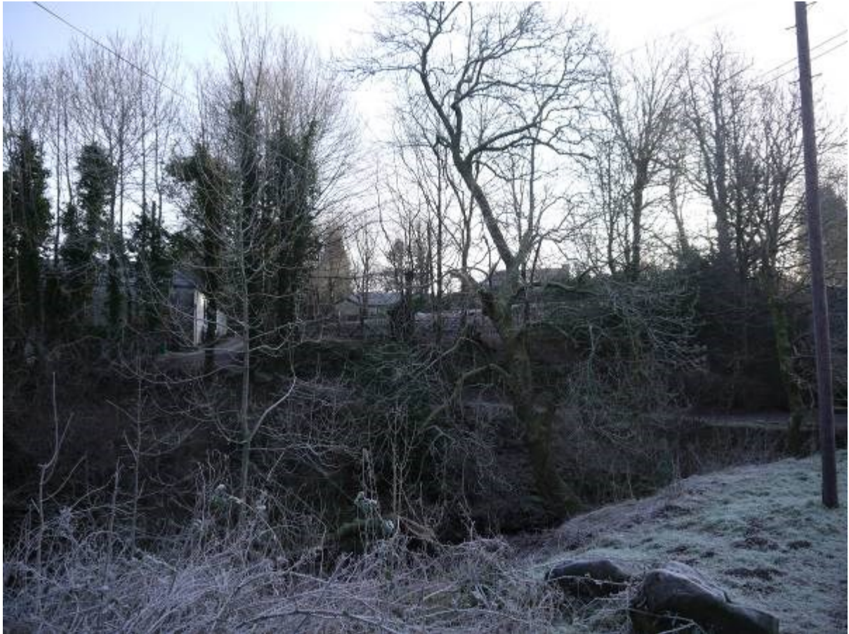
Illus 3 Site location (behind trees to right of building) looking East