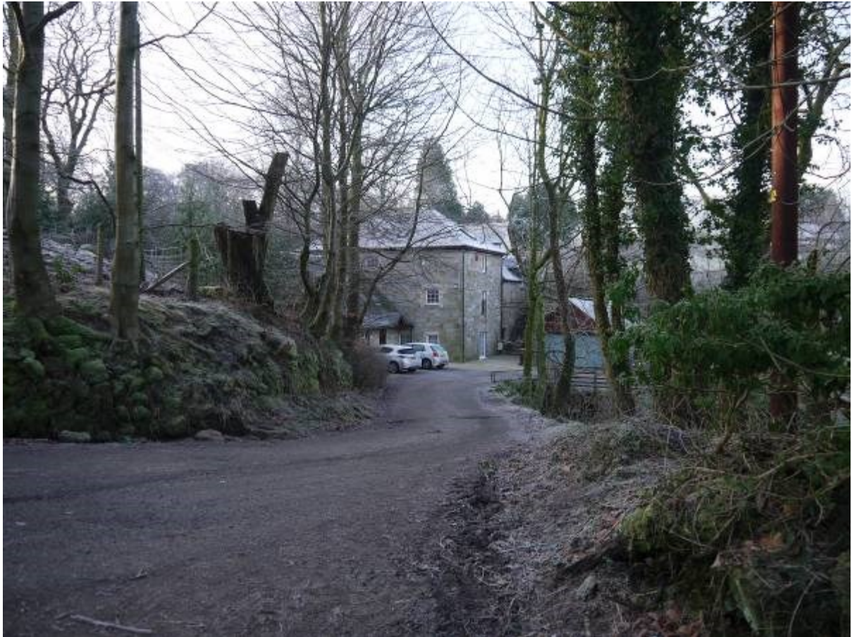
Illus 4 Milndavie mill looking South West (site behind two trees on left side of picture)