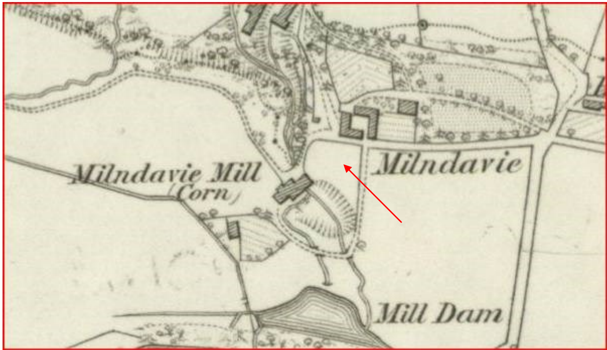
Illus 2 site at Milndavie Road as shown on 1 st Edition Ordnance Survey map of 1862