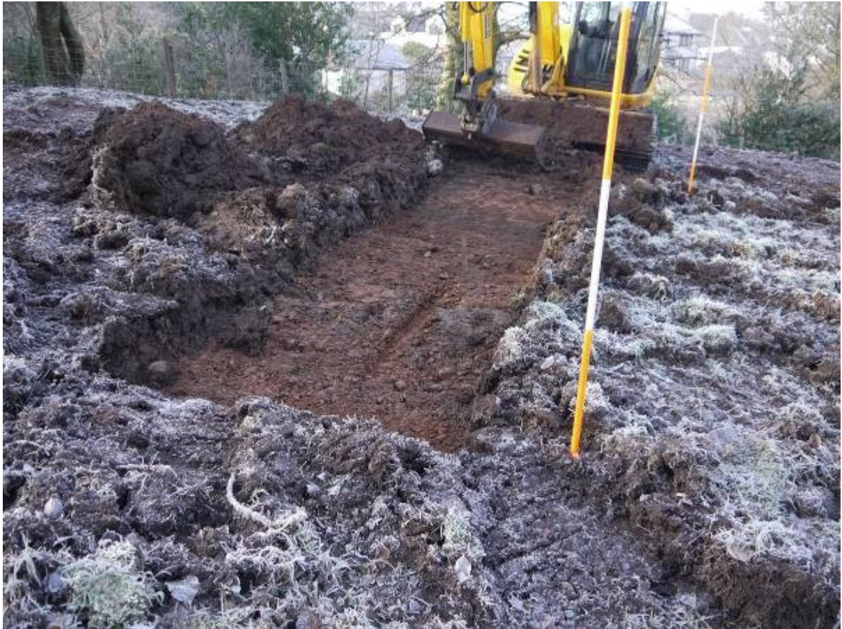
Illus 8 Trench B looking South West