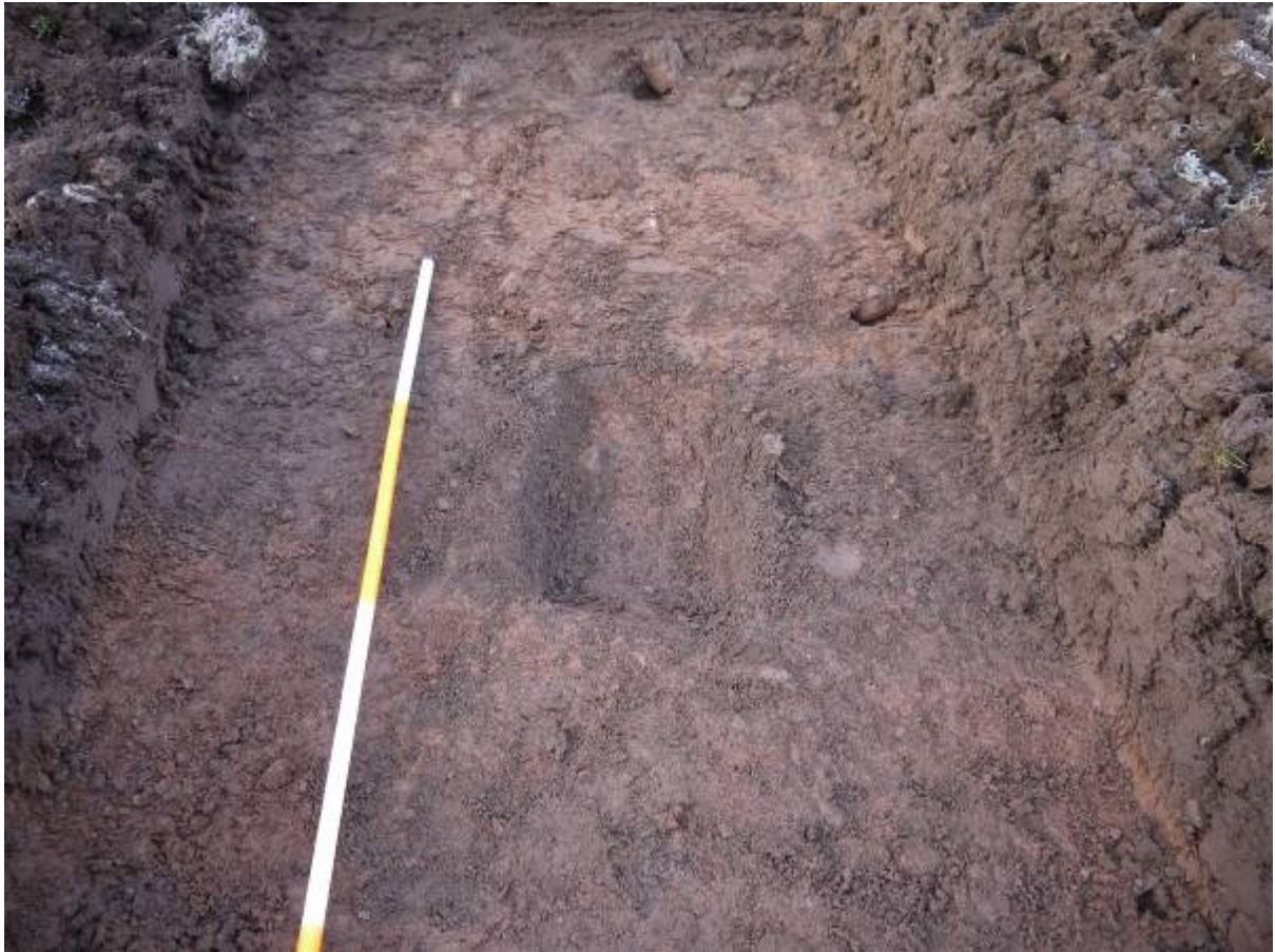
Illus 9 Linear field drain trench in Trench B