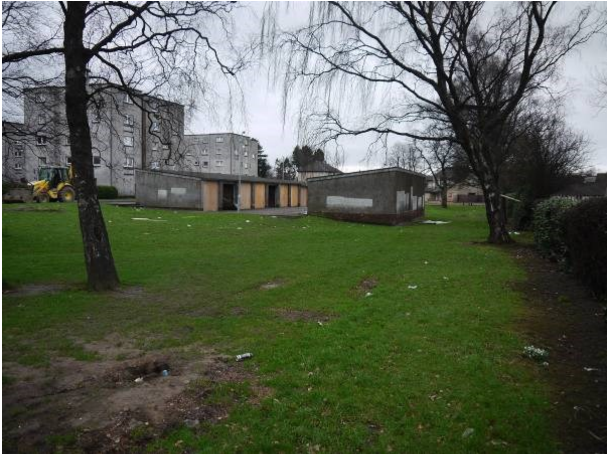
Illus 3 Site location (greenfield section in foreground) looking South East