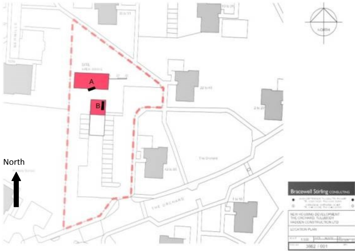
Illus 5 Location of Trenches A and B (based on supplied architects plan) Scale 1:500 at A3