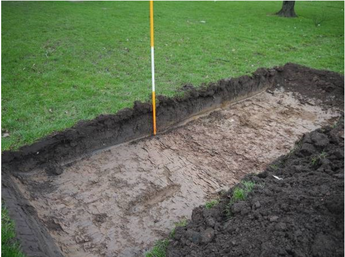
Illus 7 South facing section of Trench A showing natural clay