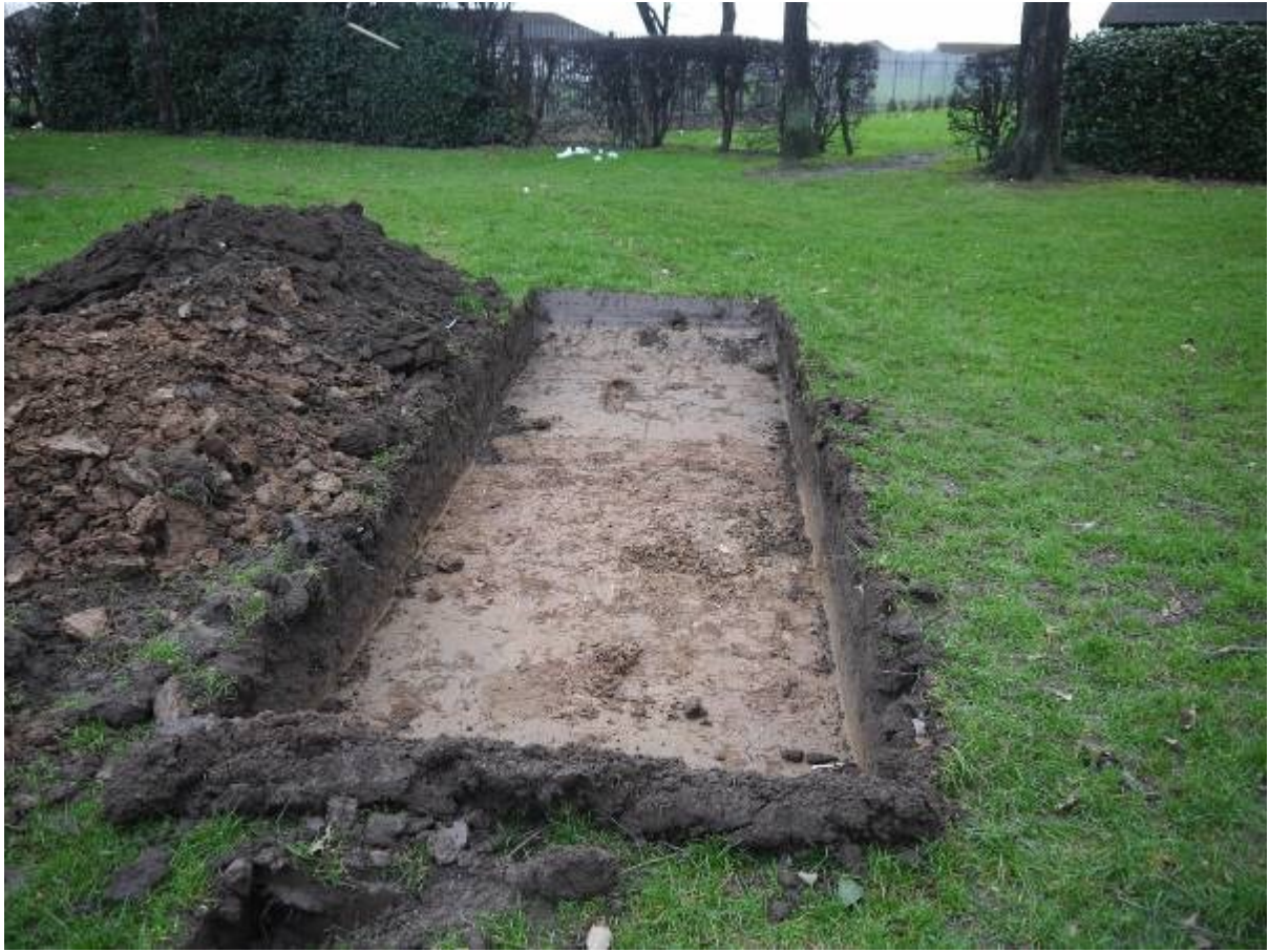
Illus 6 Trench A looking South West showing natural clay