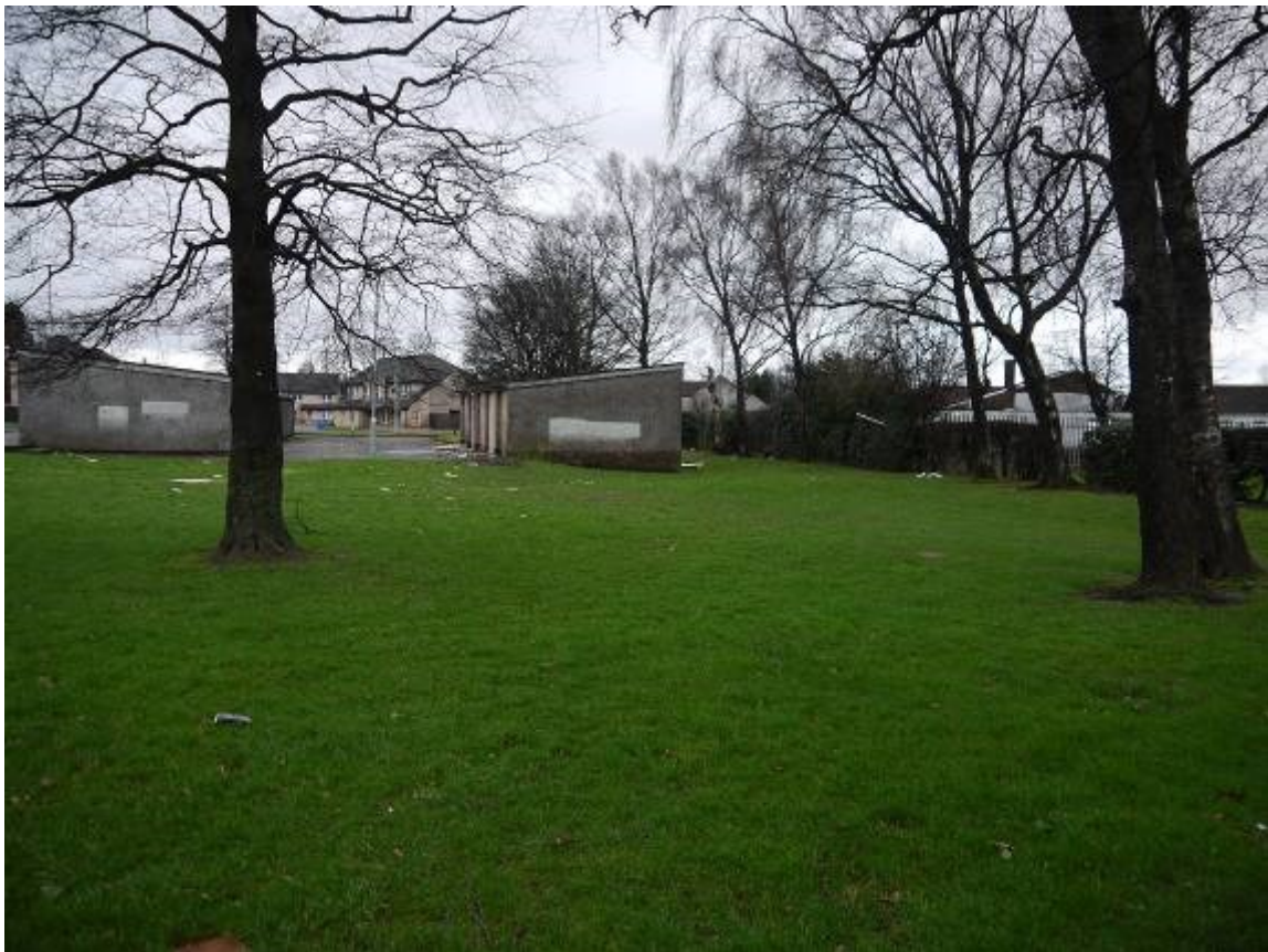
General view of greenfield part of site looking South, The Orchard, Tullibody

The Orchard, Tullibody, Clackmannanshire Council