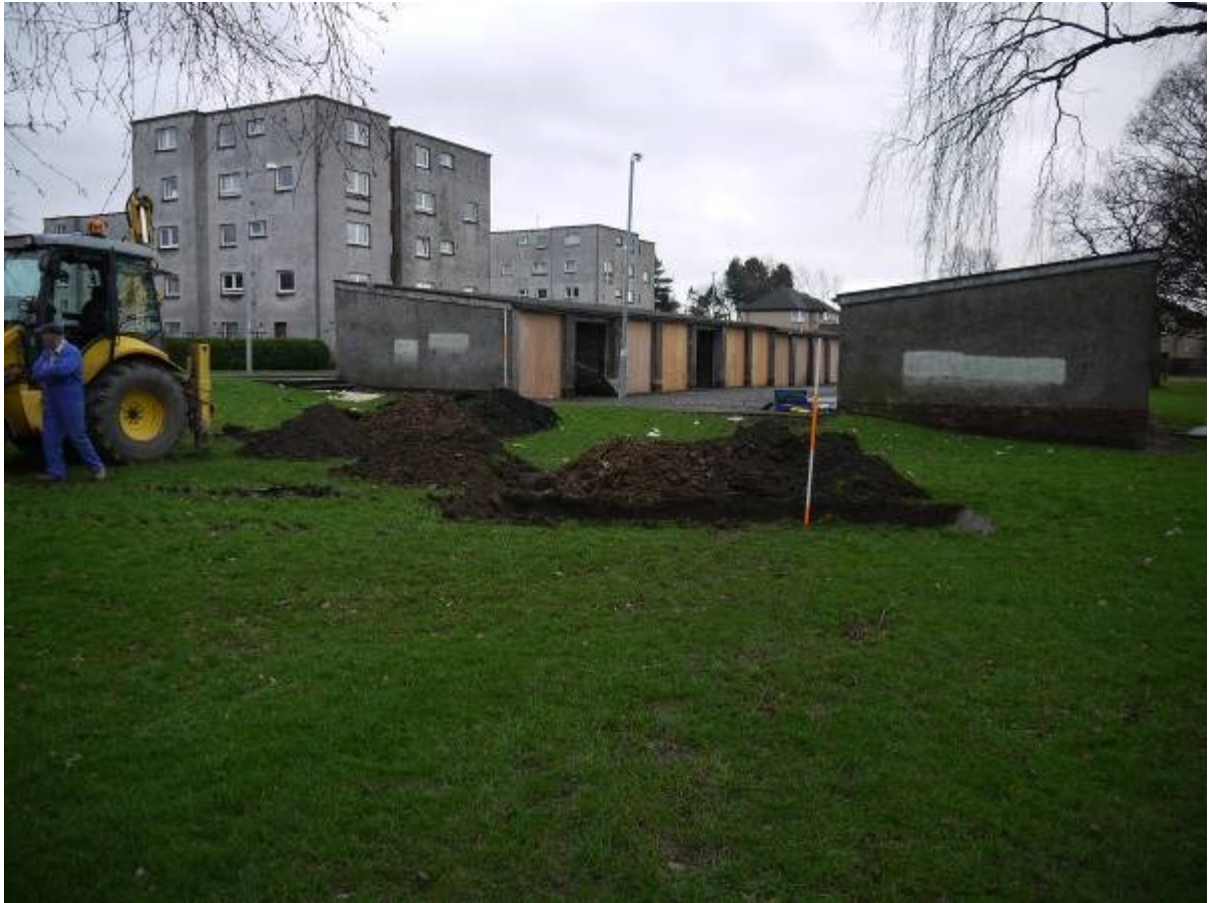
Illus 4 Trenches A and B after excavation