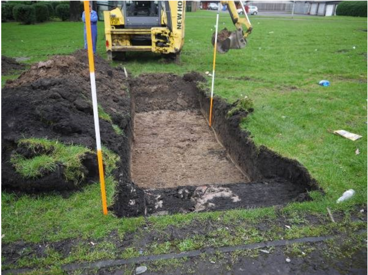
Illus 8 Trench B looking North showing natural clay