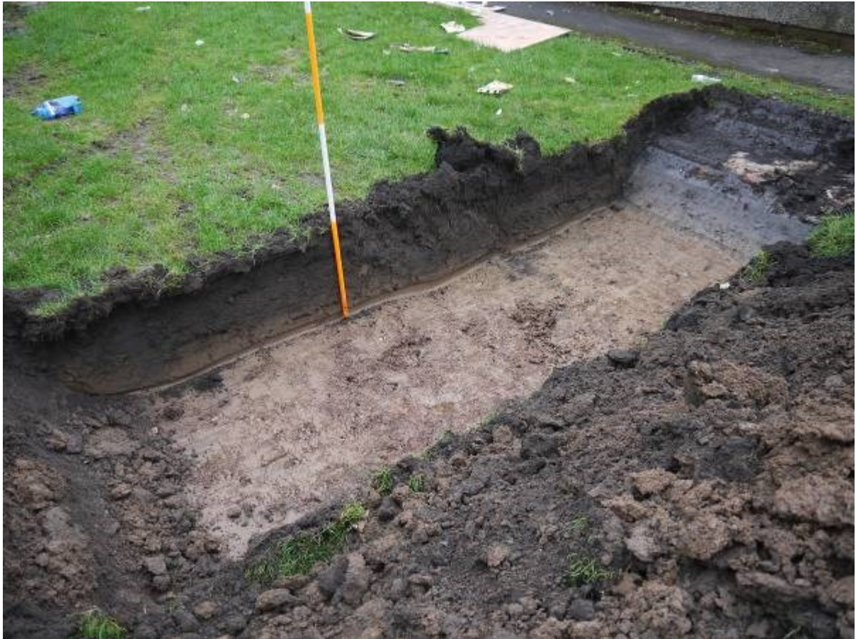
Illus 9 West facing section of Trench B showing natural clay