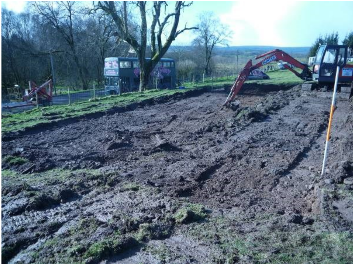
Illus 5 Stripped footprint for livery barn looking West