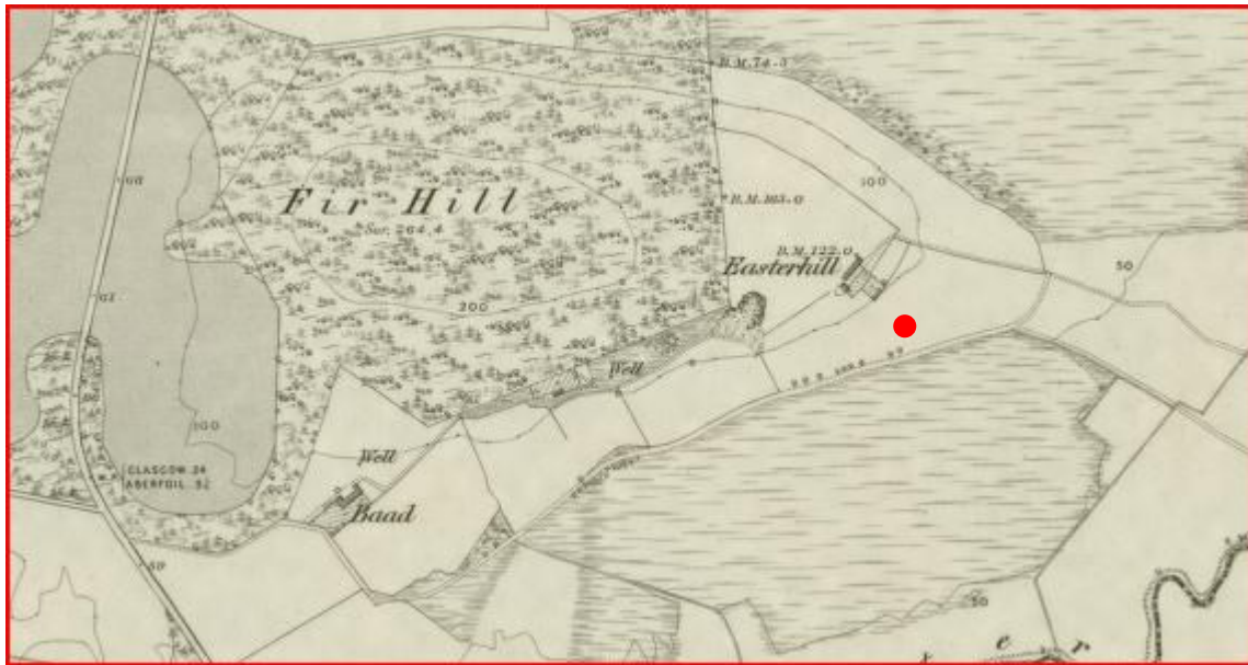
Illus 2 site (red dot) as shown as shown on 1 st Edition Ordnance Survey map of 1862