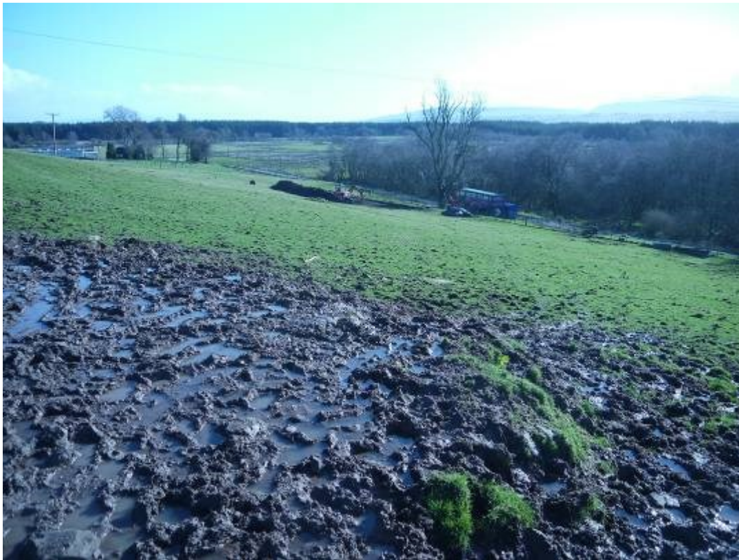
General view of site location looking South East (Flanders Moss in background)