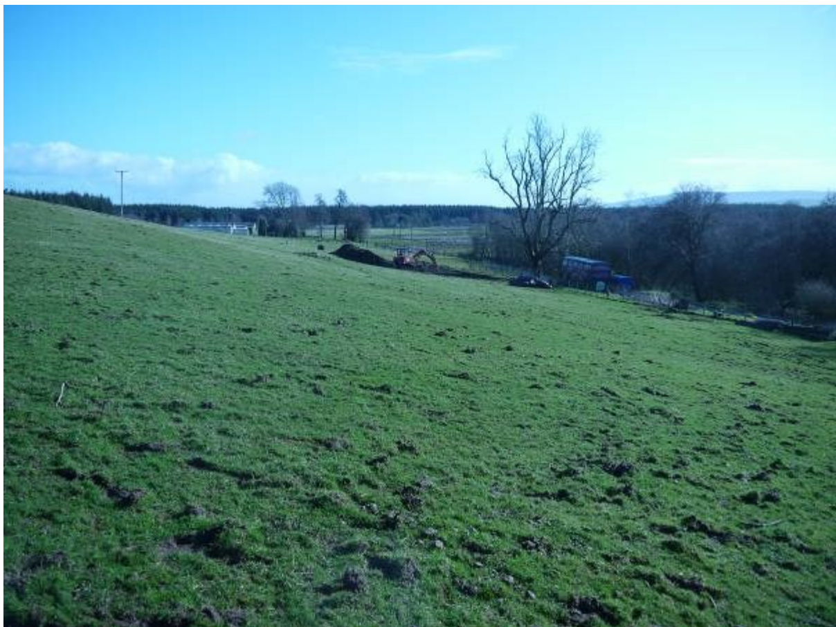
Illus 4 Site location looking South East