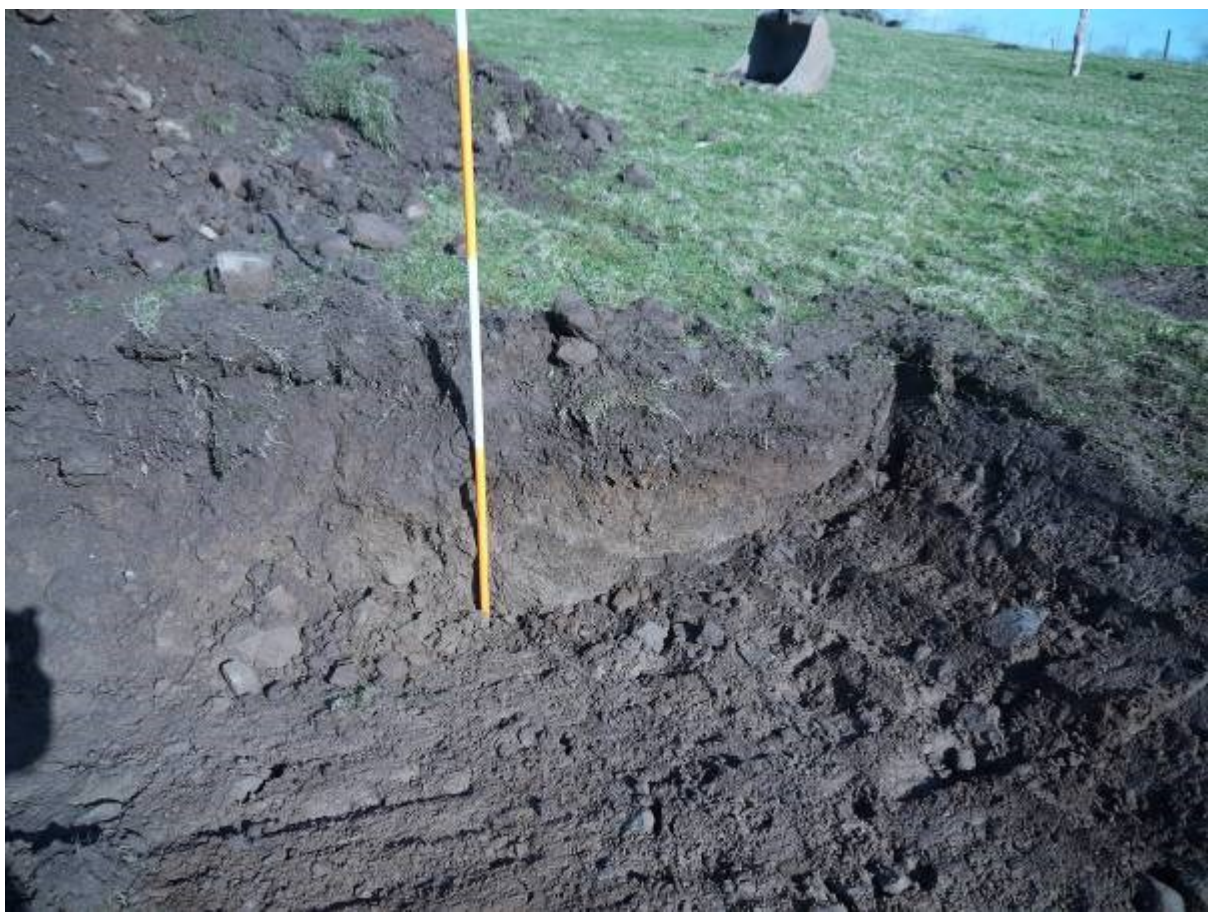
Illus 7 Section of Northern side of stripped footprint showing shallow soil depth above natural gravel