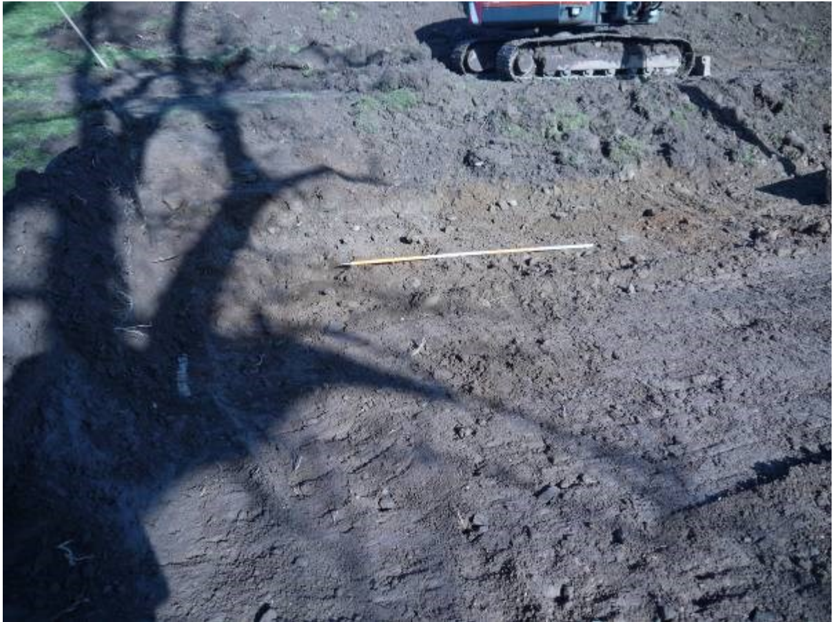
Illus 6 Stripped footprint at its Western end, ranging rod lying on natural gravel