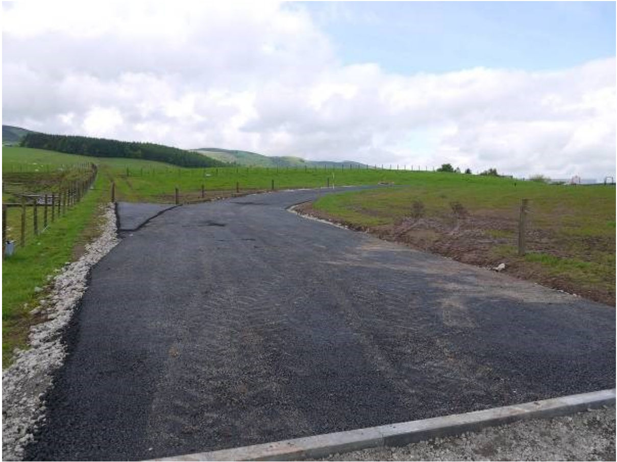
Illustration 7 General view of eastern end of access road looking south west