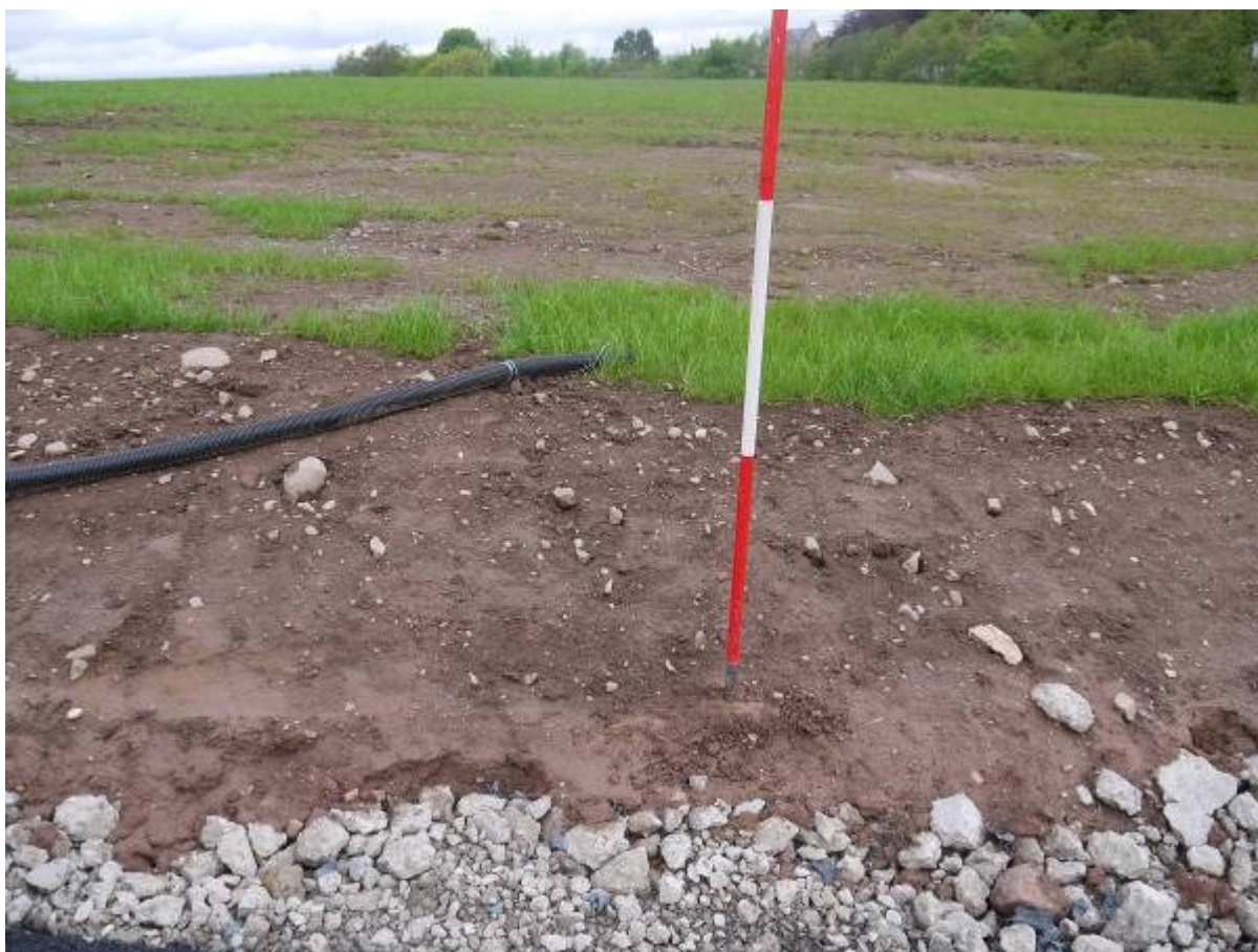
Illustration 6 Surviving soil profile on north side of road (at 3 on Illustration 3) showing dark brown sandy clay (ploughsoil) above pink brown natural clay and stones