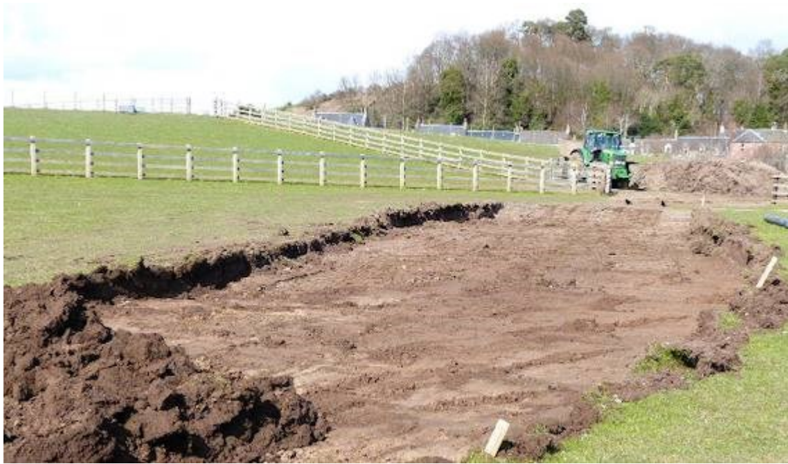
Illustration 5 Course of central section of road during soil stripping (natural clay visible below plough soil)