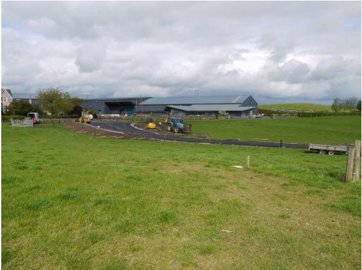
Illustration 4 General view showing built up section of road at western end (see 1 on Illustration 3) looking north west