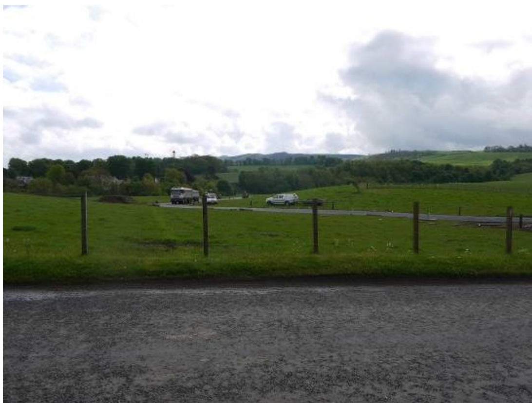
General view of course of new road looking south east