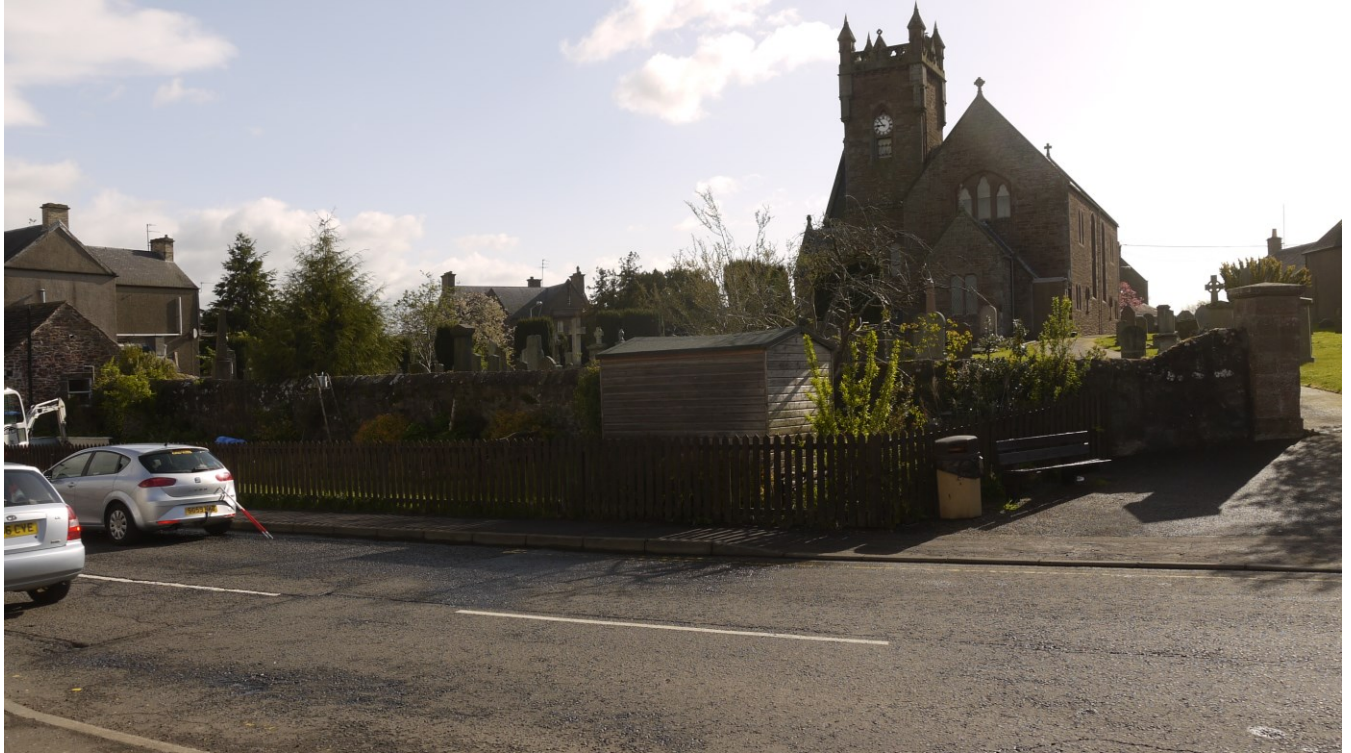
Development site looking east