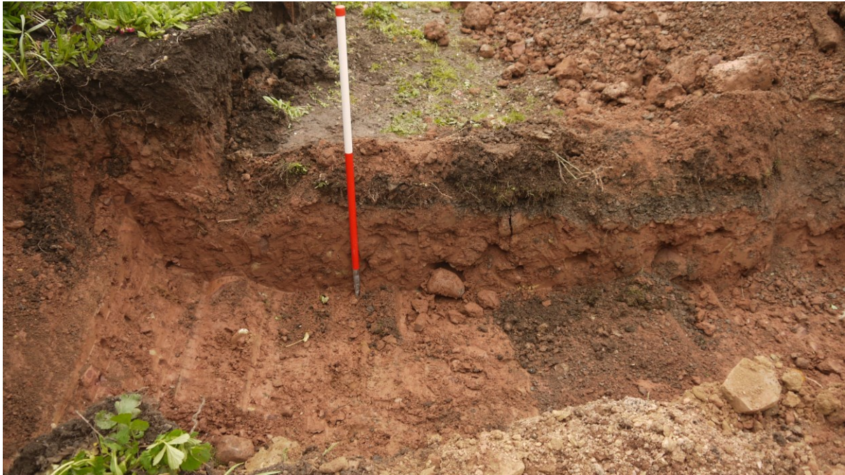
Illustration 6 North facing section of Northern foundation trench looking south, showing garden soil and laid type 1 stones on natural