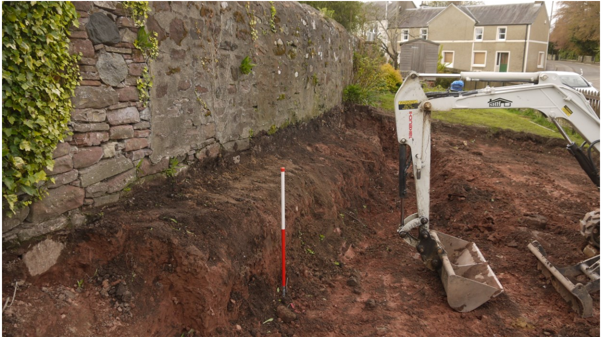
Illustration 7 Fully exposed western face of Meigle churchyard wall looking south