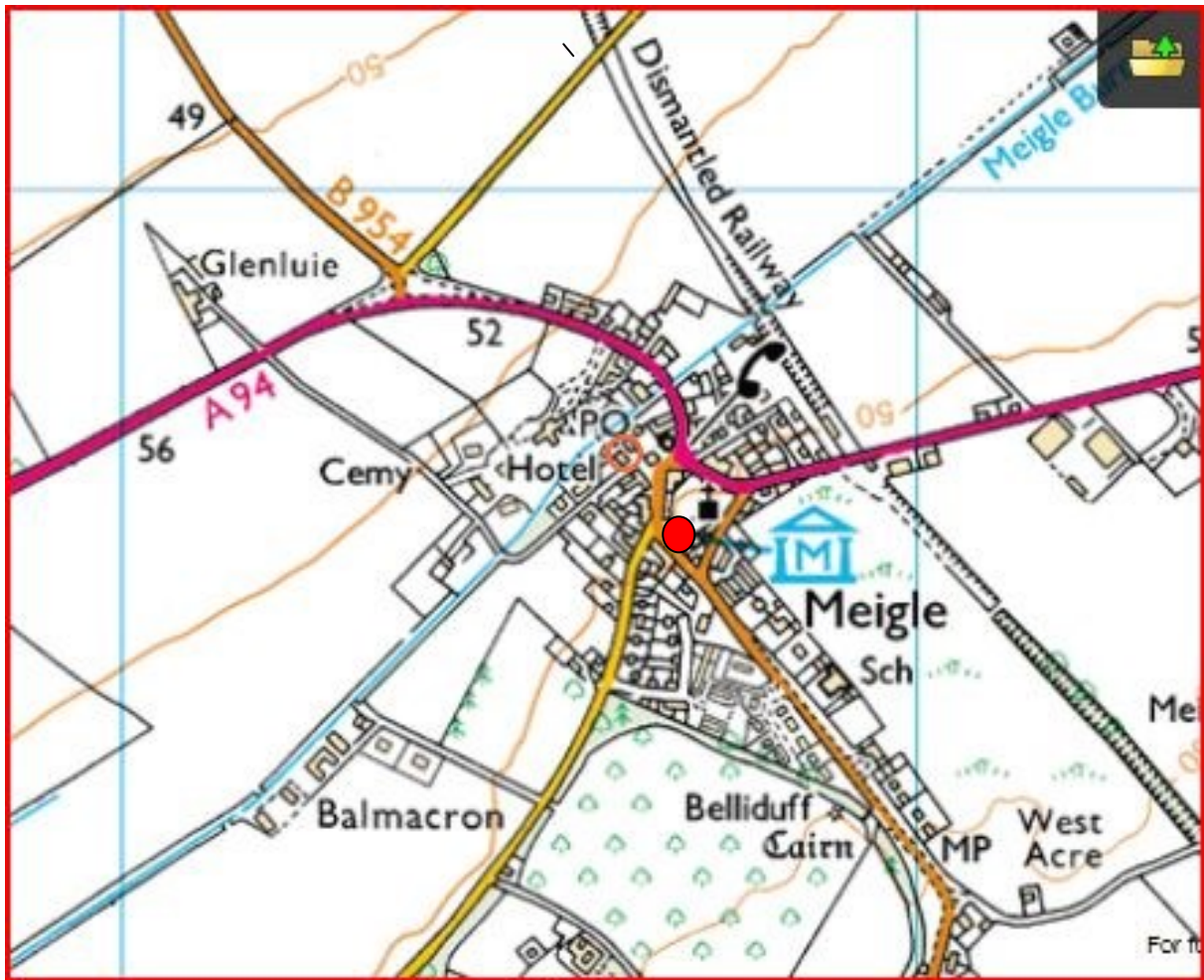
Illustration 1 Site Location (red dot) (based on Ordnance Survey map Crown Copyright 2014. All Rights Reserved. Licence number 100049628)