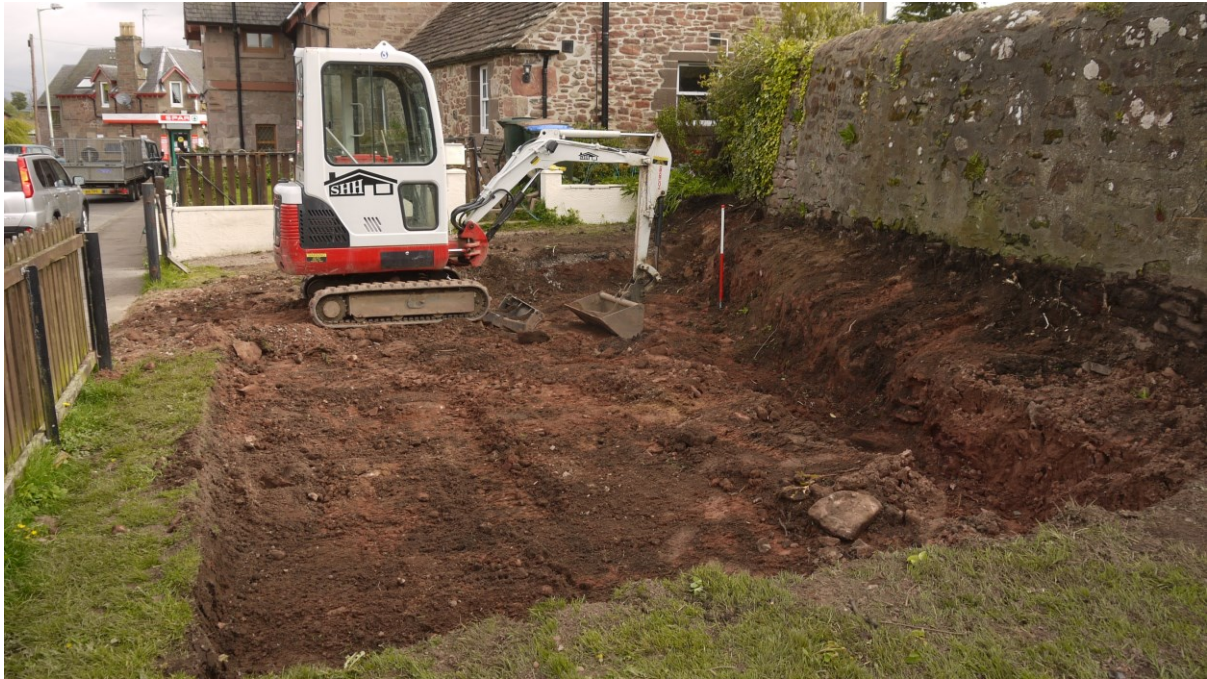
Illustration 5 Site foot print on completion of ground stripping and commencement of foundation trenches looking North