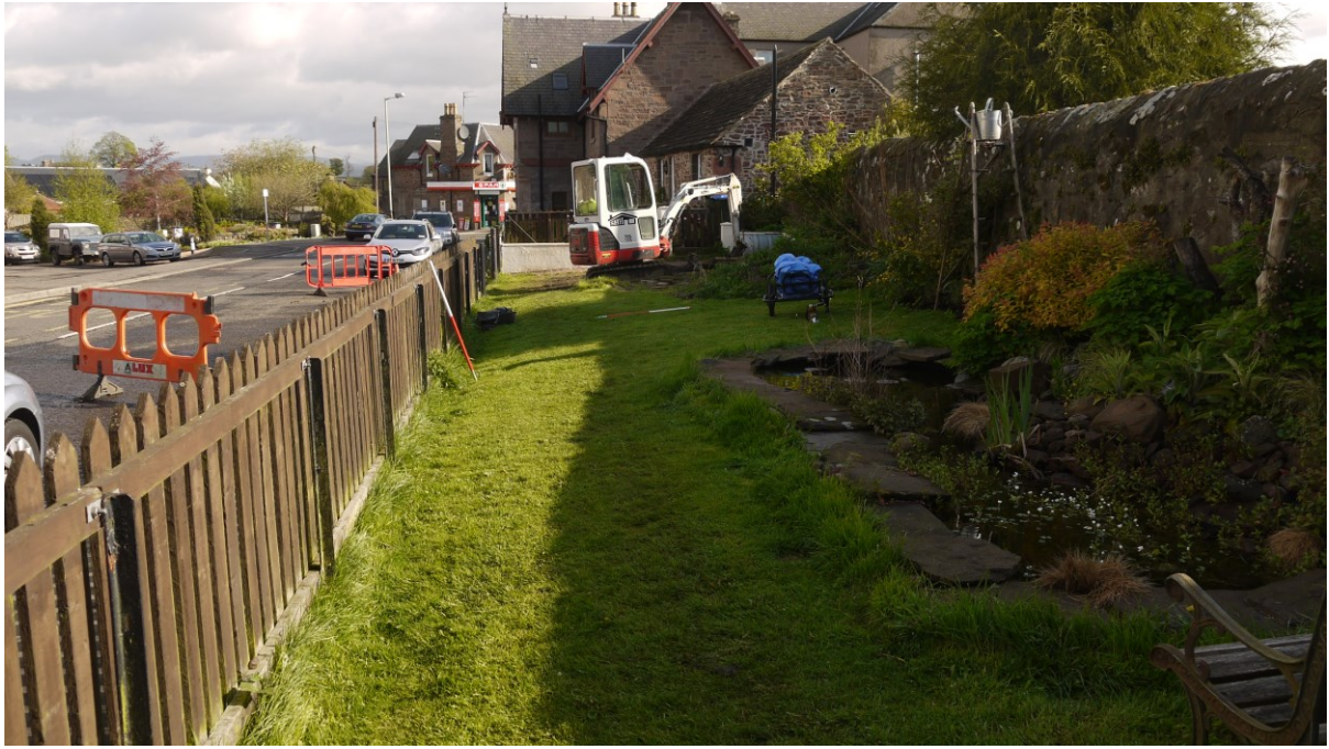
Illustration 4 Development site before commencement of ground works looking North