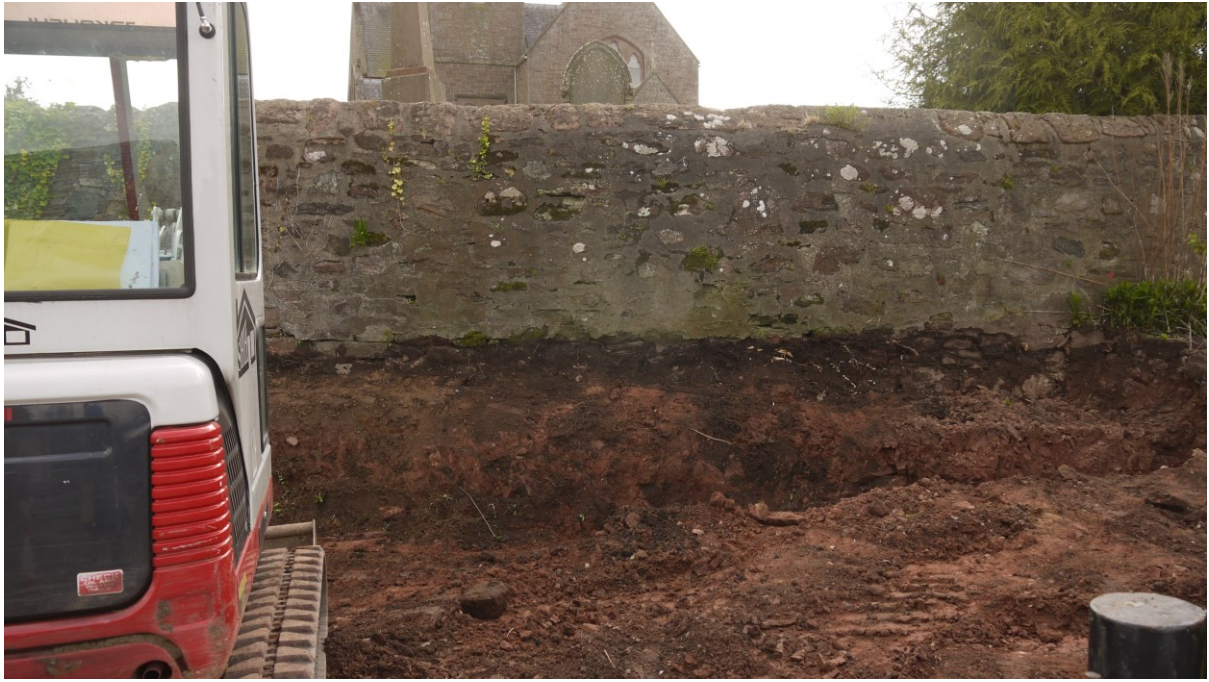
Illustration 8 Fully exposed western face of Meigle churchyard wall looking east with church visible in background