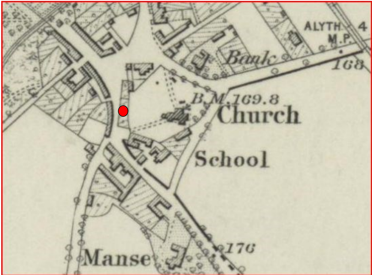
Illustration 2 Site (red dot) as shown on First Edition Ordnance survey map of 1867