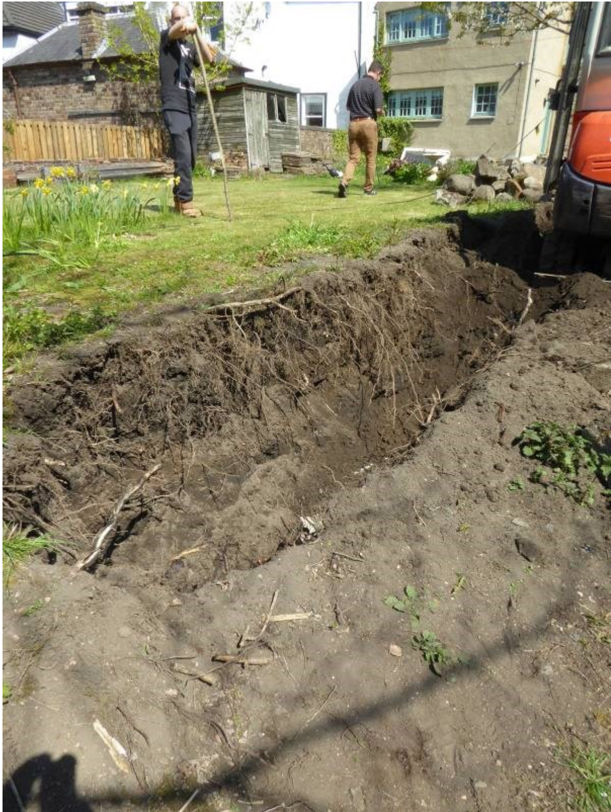
Illustration 10 South facing section of Northern foundation trench for garage looking North East