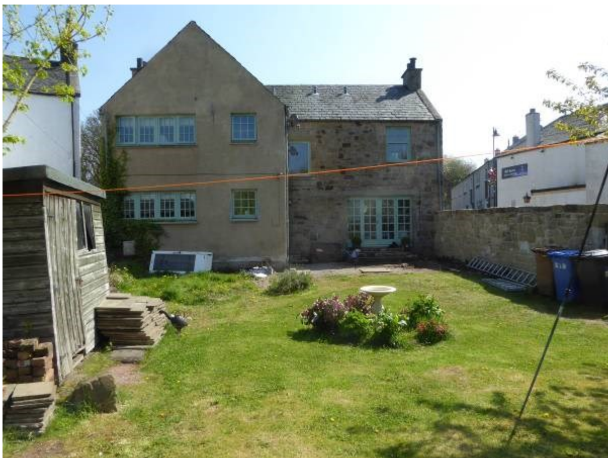
Illustration 4 General view of rear of Kirk House, 8 The Square, Torphichen looking East