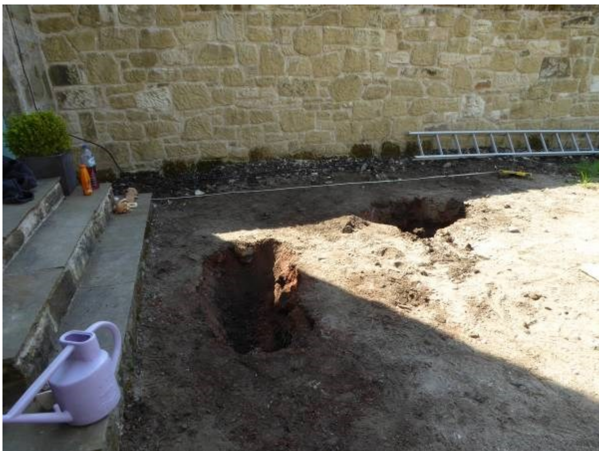
Illustration 6 General view of test pits 1 and 2 looking South