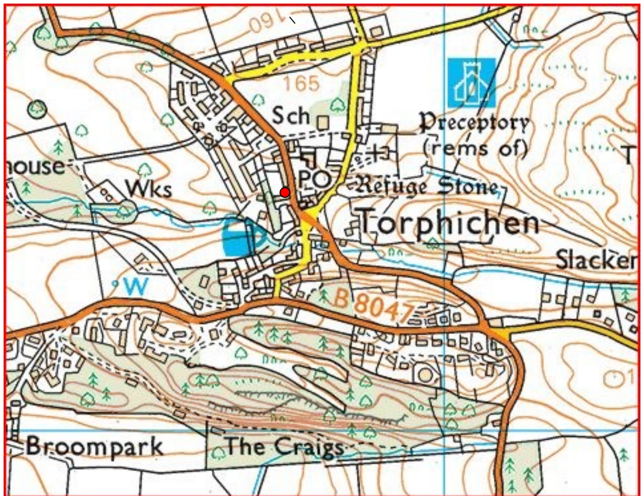
Illustration 1 Site Location (red circle) (based on Ordnance Survey map Crown Copyright 2014. All Rights Reserved. Licence number 100049628)