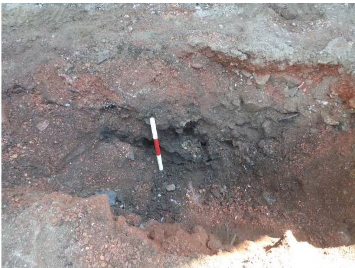
Illustration 8 Excavated Test Pit no 2 looking South