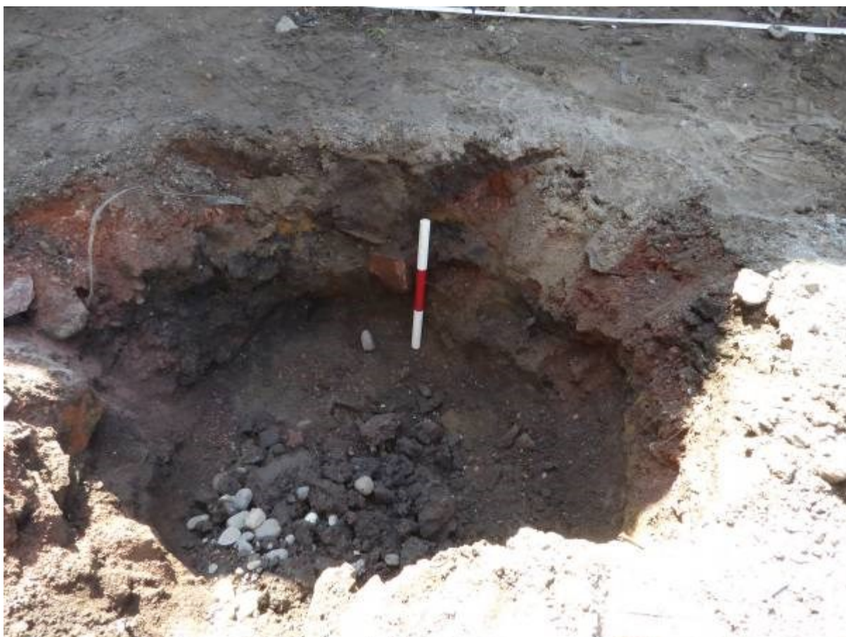
Illustration 7 Excavated Test Pit no 1 looking South