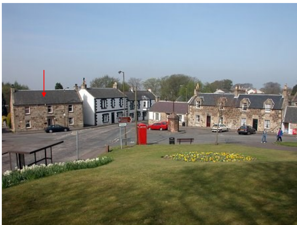
General view of The Square, Torphichen (no 8 indicated by red arrow)