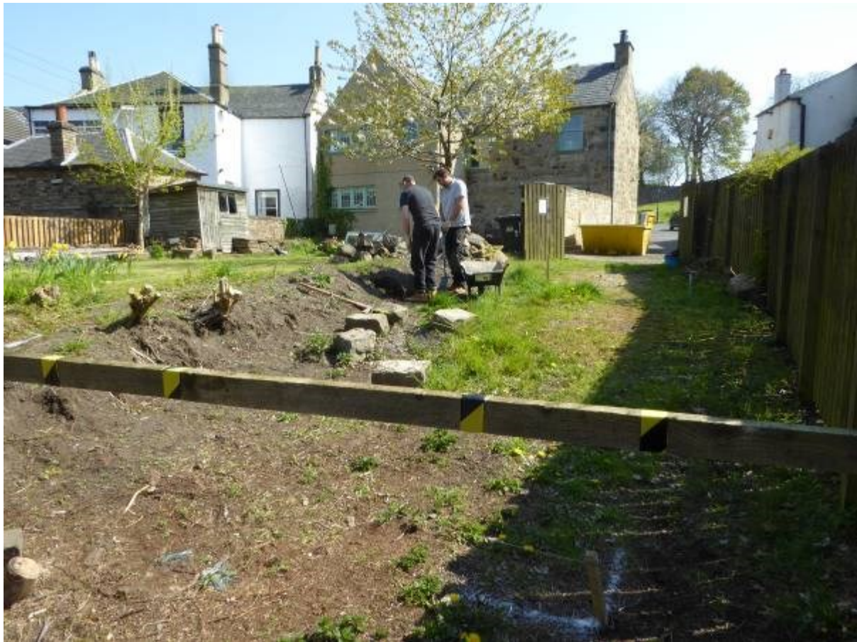
Illustration 5 General view of location of new garage looking East