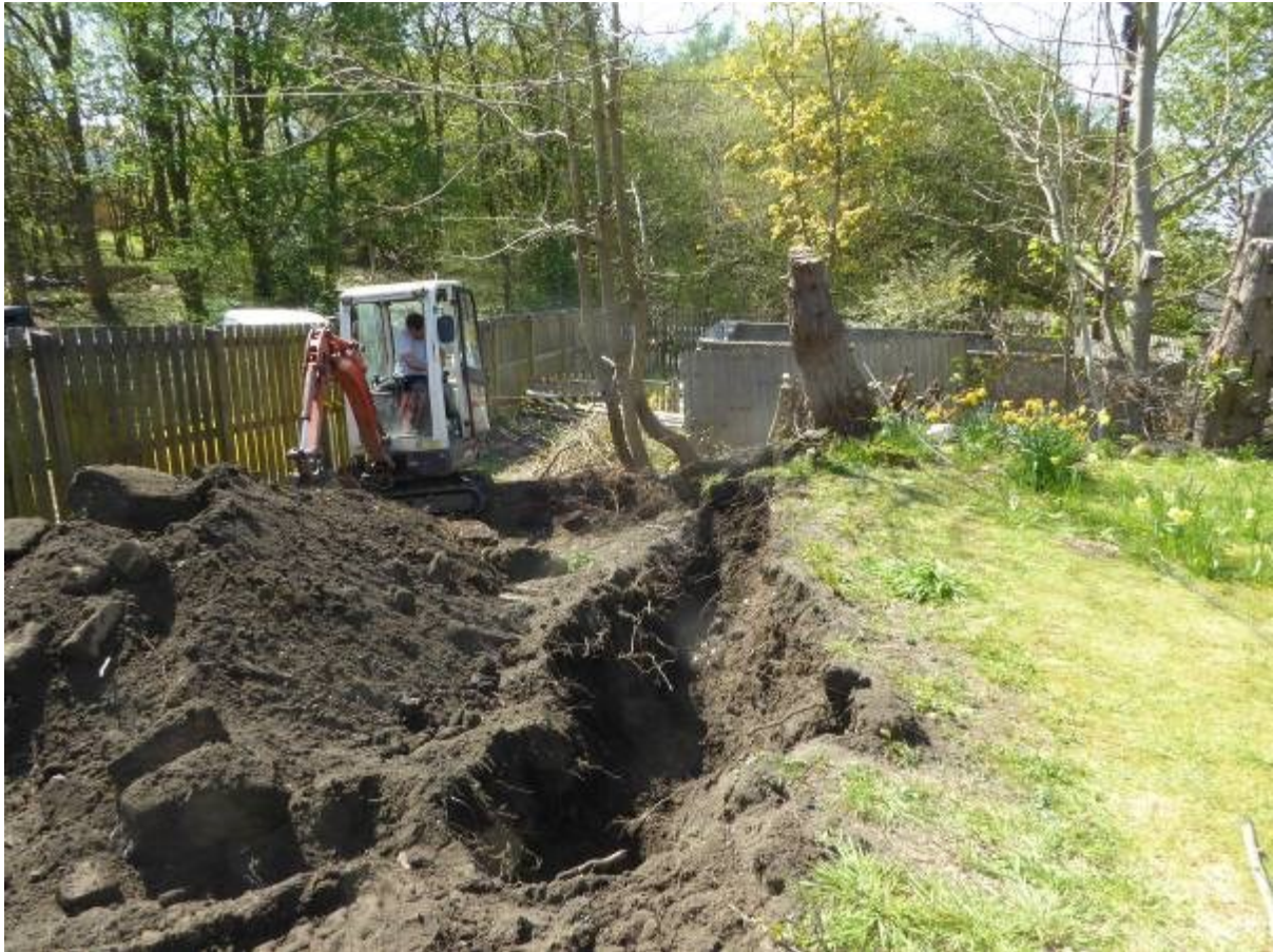
Illustration 13 Excavated Northern and Western foundation trenches for garage looking West with electricity substation in the background