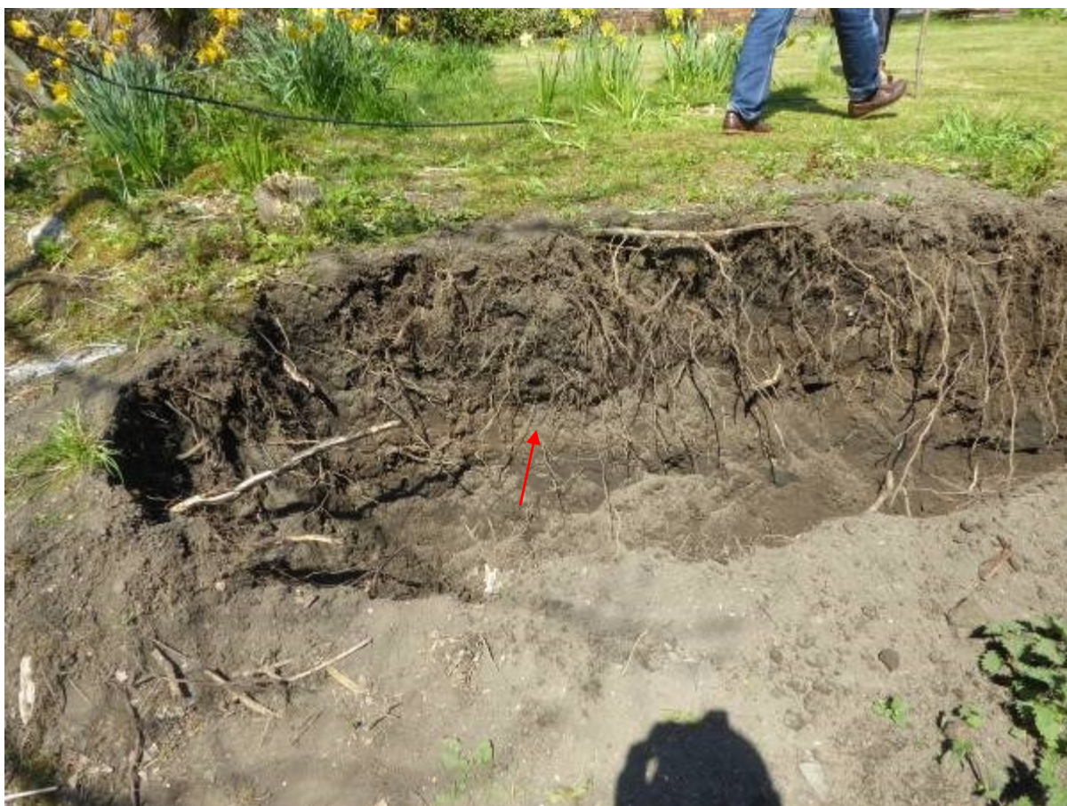
Illustration 11 Detail of South facing section for Northern foundation trench showing potential buried Old Ground Surface 101 (red arrow)