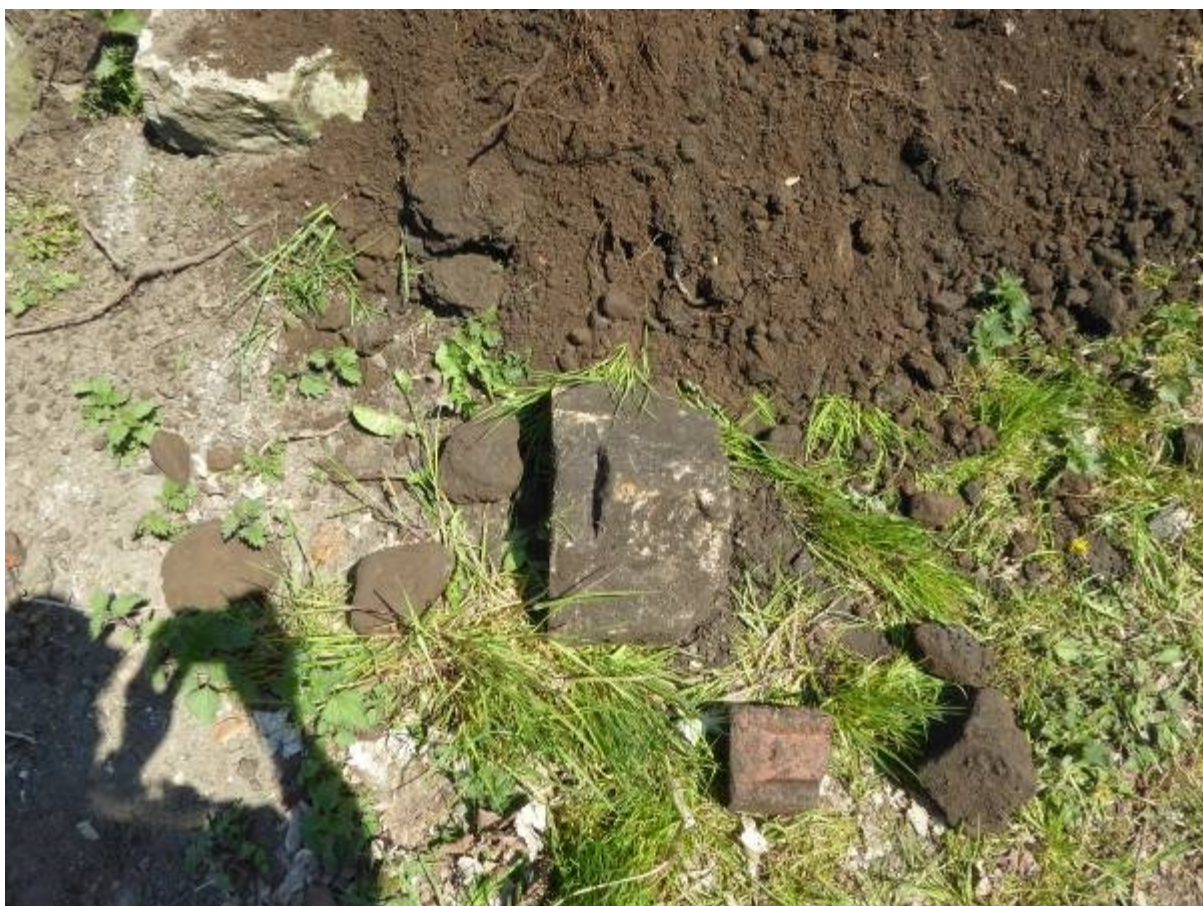
Illustration 12 Reused building stone from Context 103 in Northern foundation trench for garage