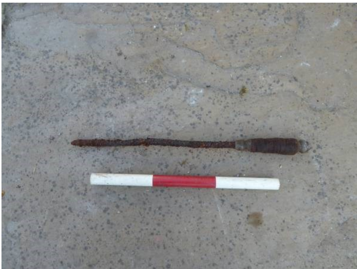
Illustration 9 Poker with leather bound handle from Test Pit 1