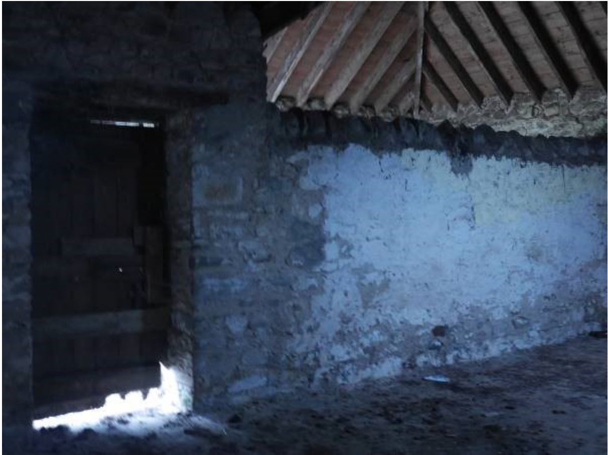
Illustration 19- Detail of lower wall between rooms 4 and 1