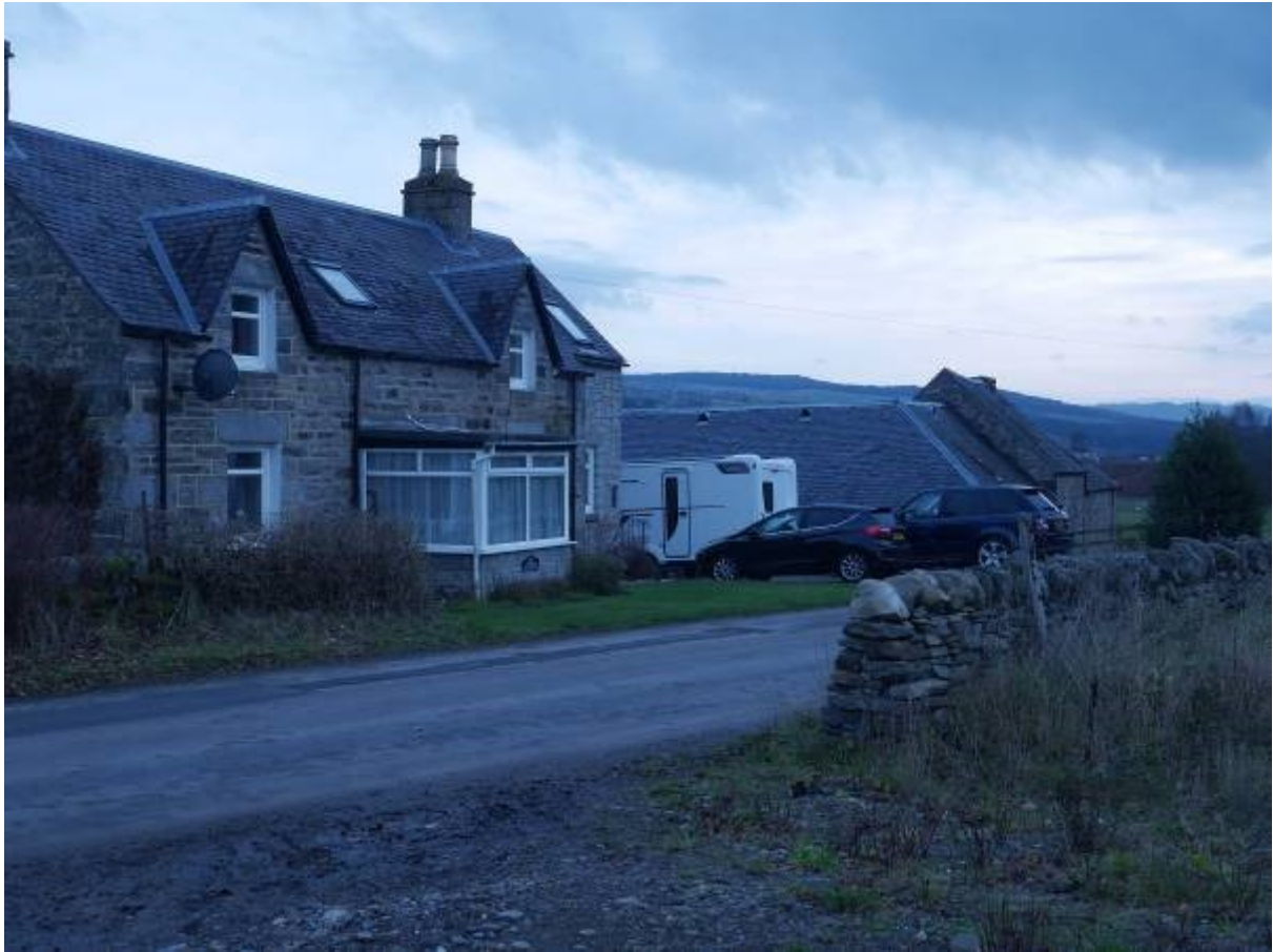
Illustration 5- Wester Ballinluig farm house with steading visible behind parked cars looking South