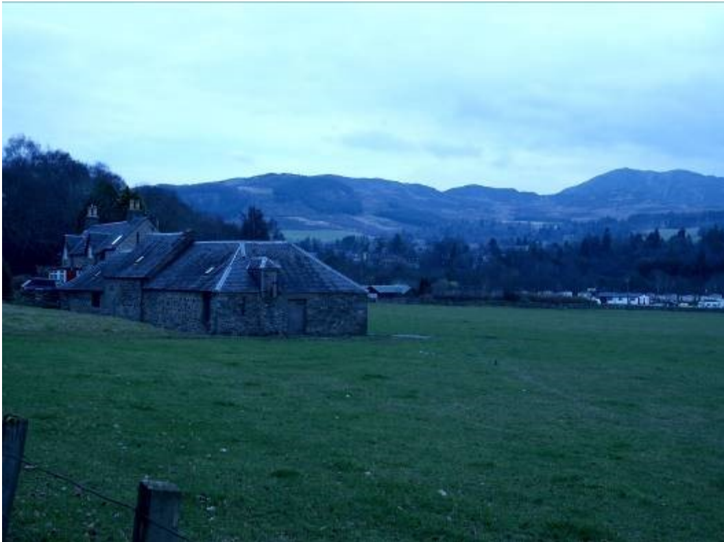
Wester Ballinluig steading from the South, Ben Vrackie in the background