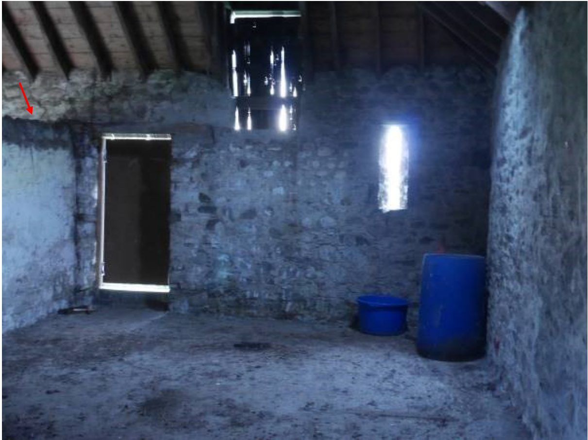
Illustration 18- Interior of southern end of room 1 showing slit window, doorway into room and doorway in roof dormer. Lower wall between rooms 1 and 4 is indicated with a red arrow