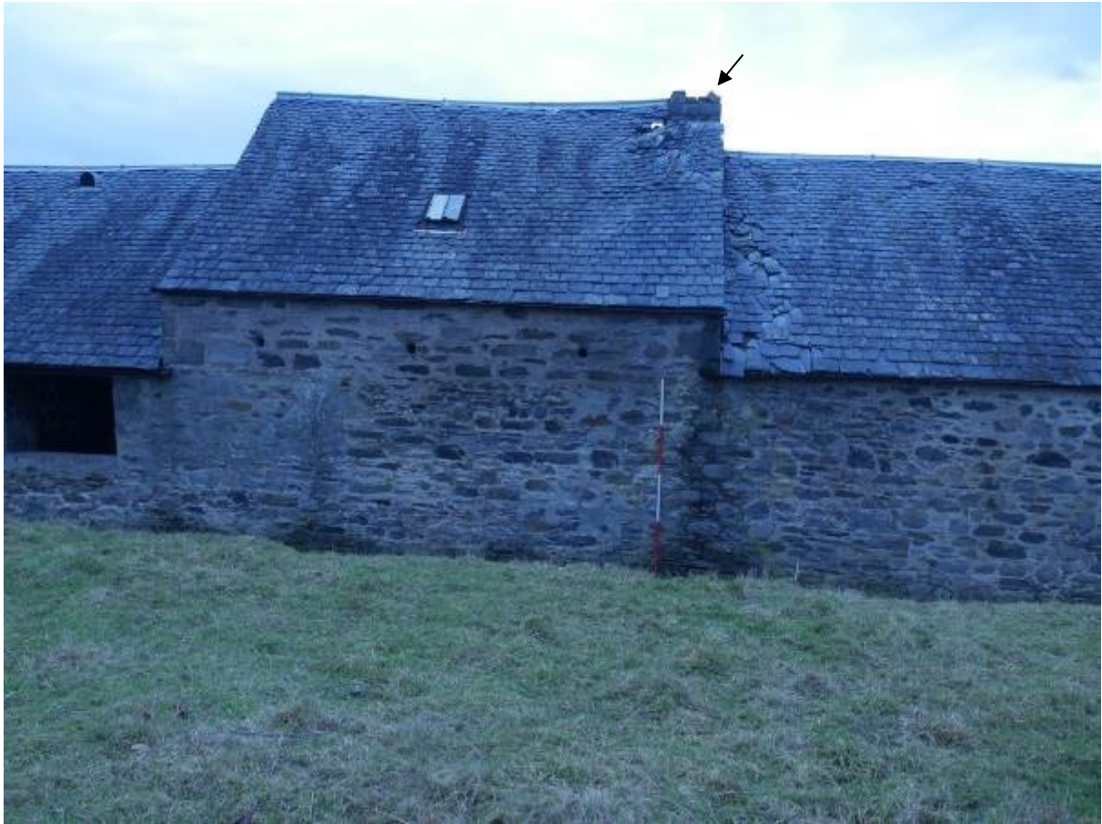
Illustration 8- Detail of North Western elevation showing higher roof line, three holes in wall face, ventilation hole in roof of room 3 and chimney for fireplace in room 1 (black arrow)