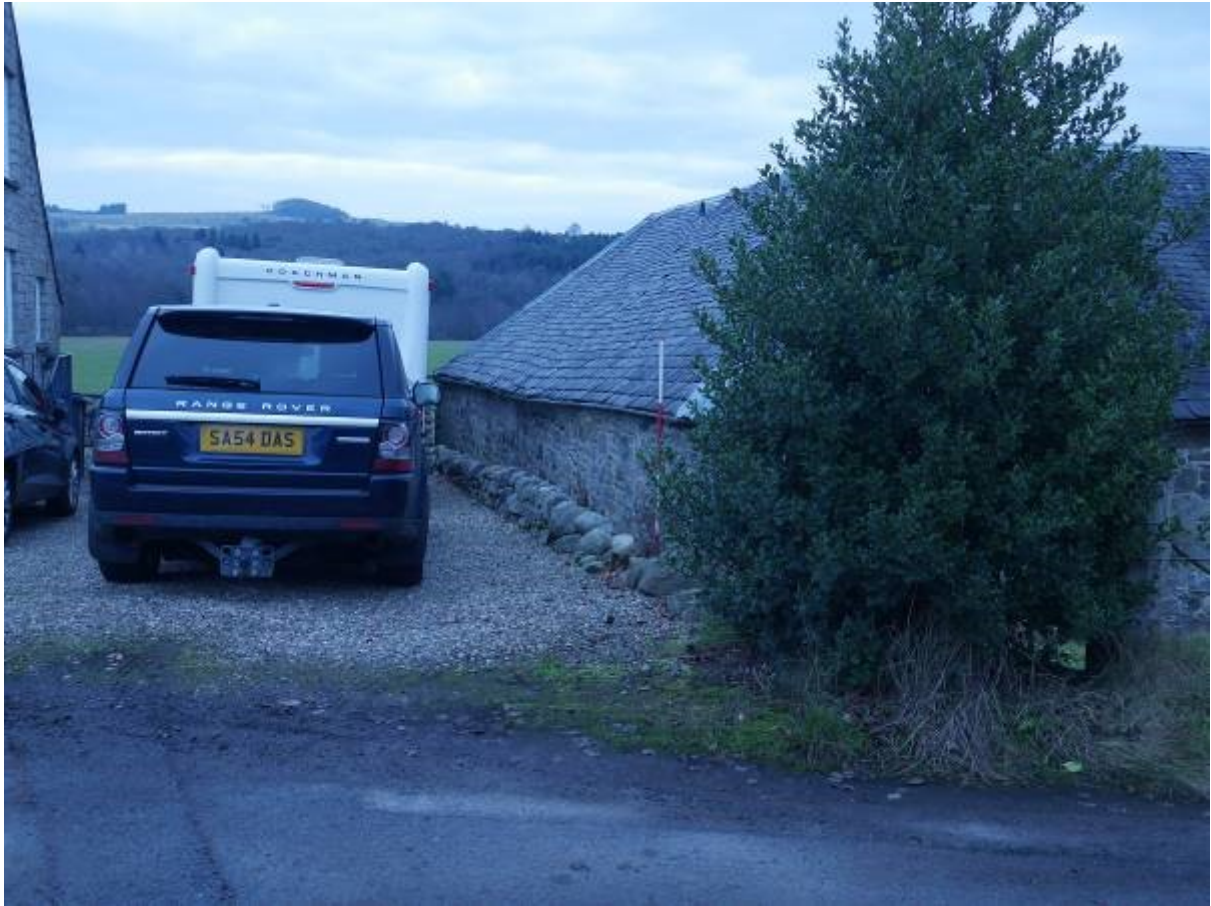
Illustration 16- Northern elevation of room 4