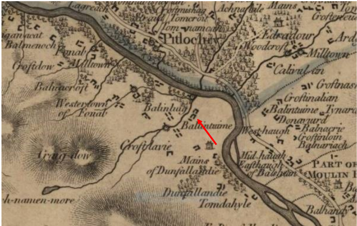
Illustration 2- Ballinluig as marked on Thomas Scobie's map of 1783 (red arrow)