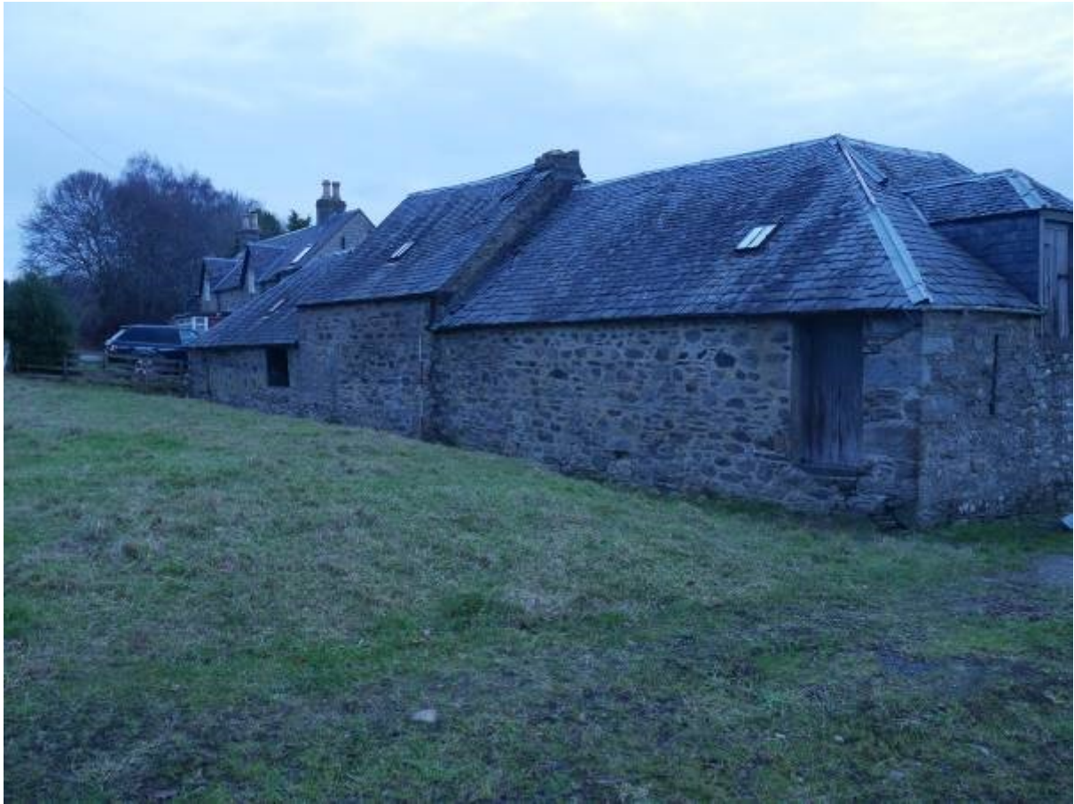
Illustration 7- Northern western elevation of the steading looking North