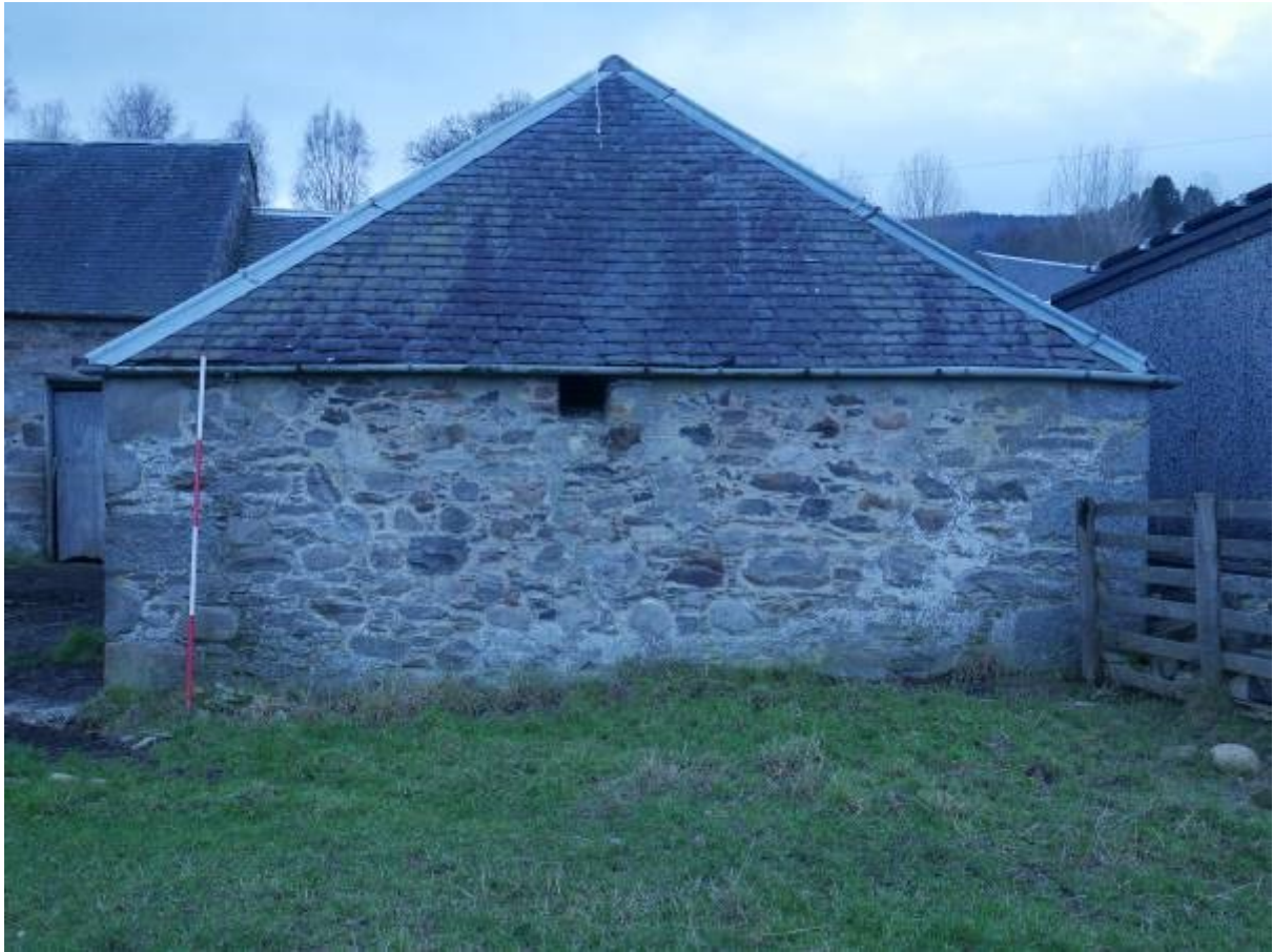
Illustration 15- Eastern elevation of room 4 showing small window in roof line