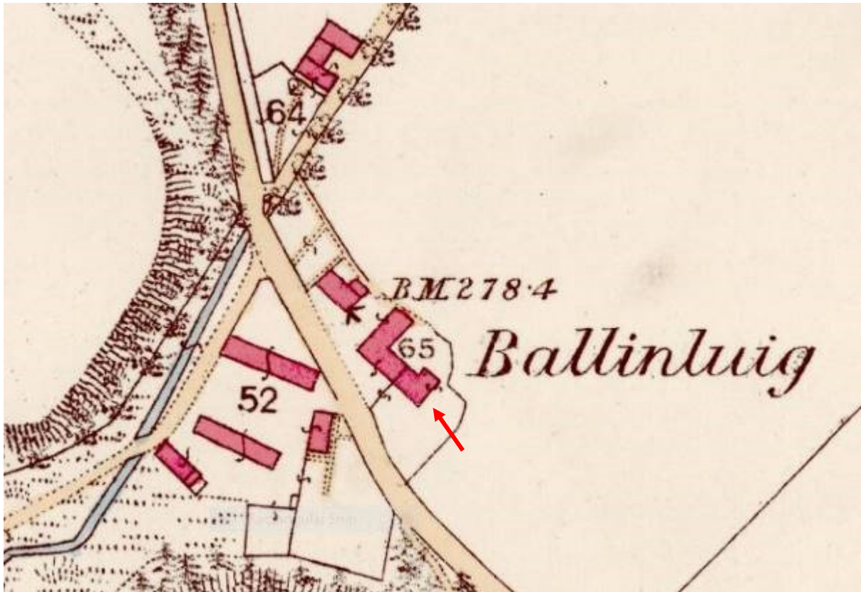
Illustration 3- Ballinluig farm as marked on the First Edition Ordnance Survey map of 1862, steading marked with red arrow