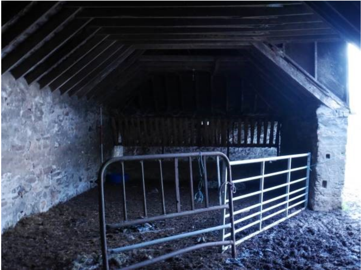
Illustration 22- Interior of room 3 looking East, feeder 3B visible to rear