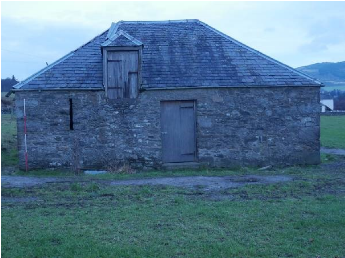
Illustration 10- Southern elevation of steading showing slit window, doorway into room 1 and doorway in roof dormer.