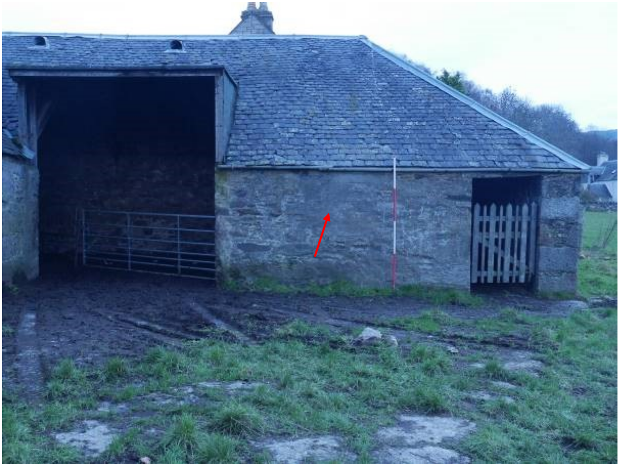
Illustration 14- Southern elevation of room 3 showing main access and doorway into room behind cattle feeder 3b and ventilation holes in roof, red arrow shows location of blocked window.