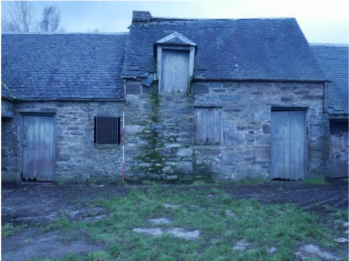
Illustration 13- Eastern elevation of rooms 1 and 2 showing higher roof line, doorways and windows into 1 and 2 and doorway in roof dormer.