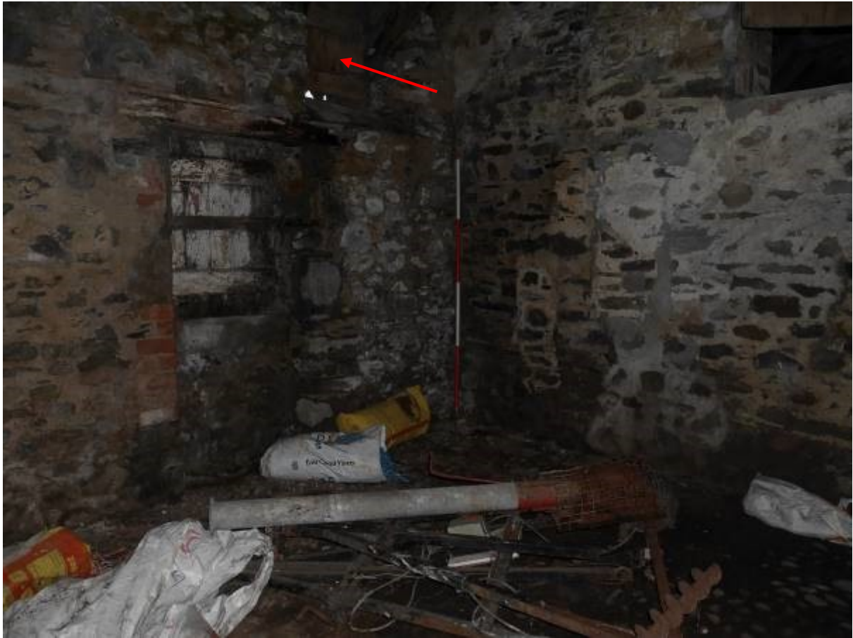
Illustration 20- Interior of room 2 looking South East showing part of Northern face of wall between rooms 1 and 2 and cobbled floor. Doorway in roof line of external eastern indicated by red arrow, shuttered window is also visible.