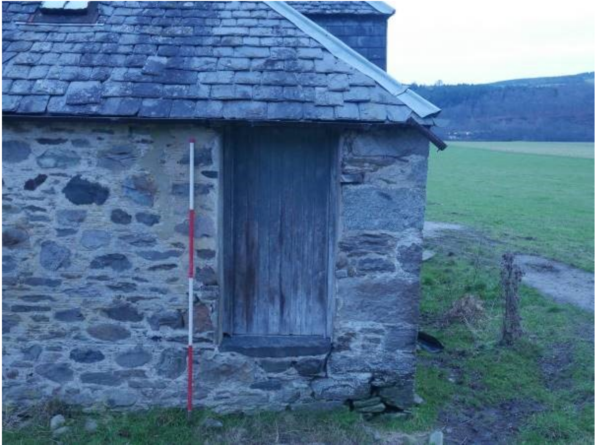
Illustration 9- Southern end of North Western elevation showing doorway raised above ground level