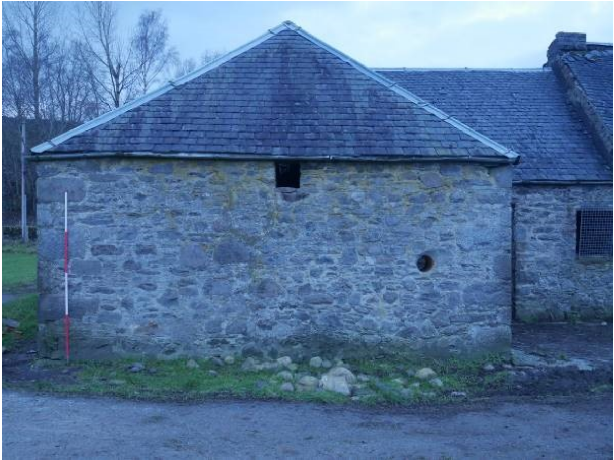
Illustration 11- Eastern elevation of room 4 showing small unglazed window and circular hole in wall