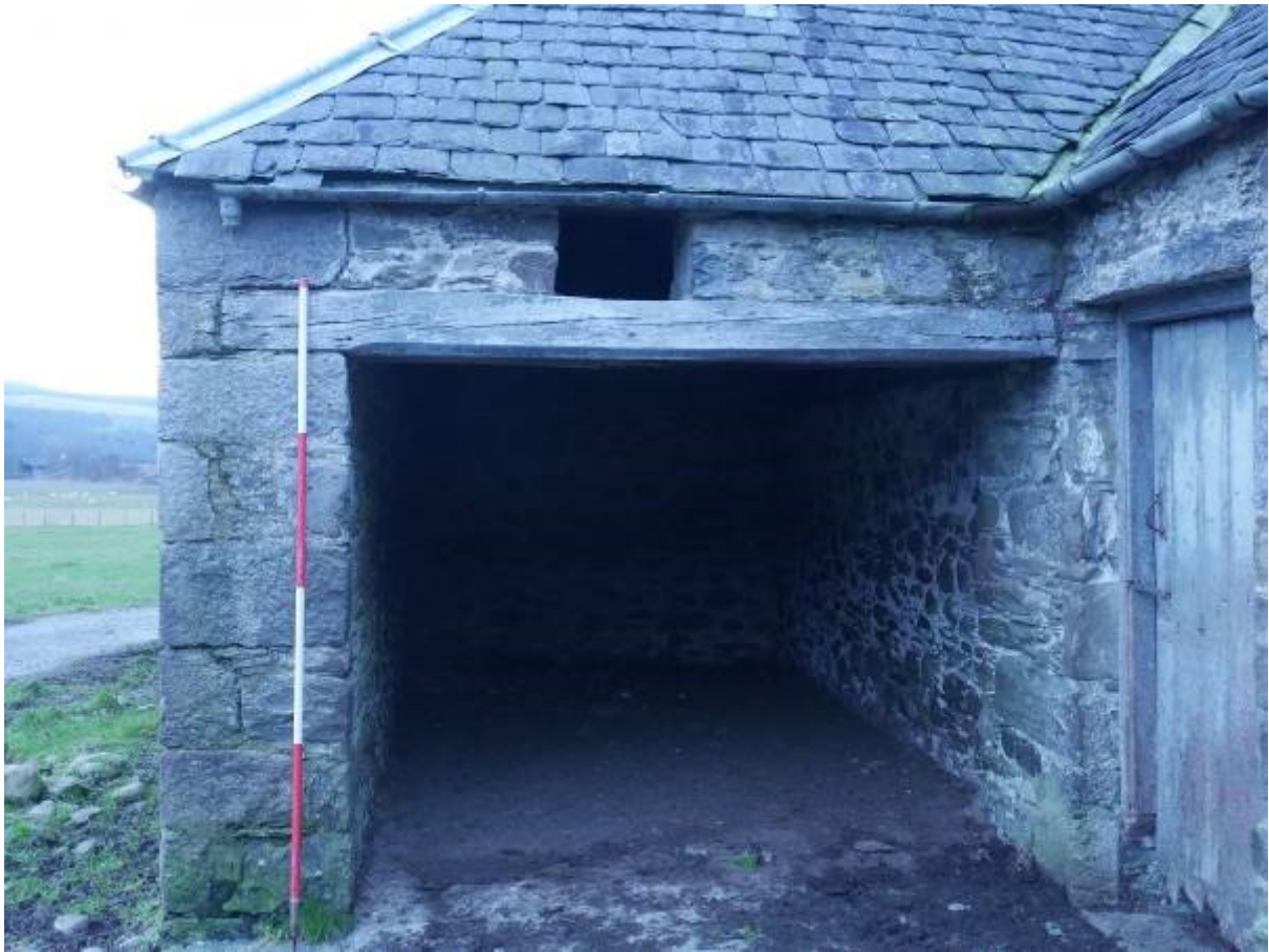
Illustration 12- Northern elevation of room 4 showing main access with wooden lintel and small unglazed window in roof line