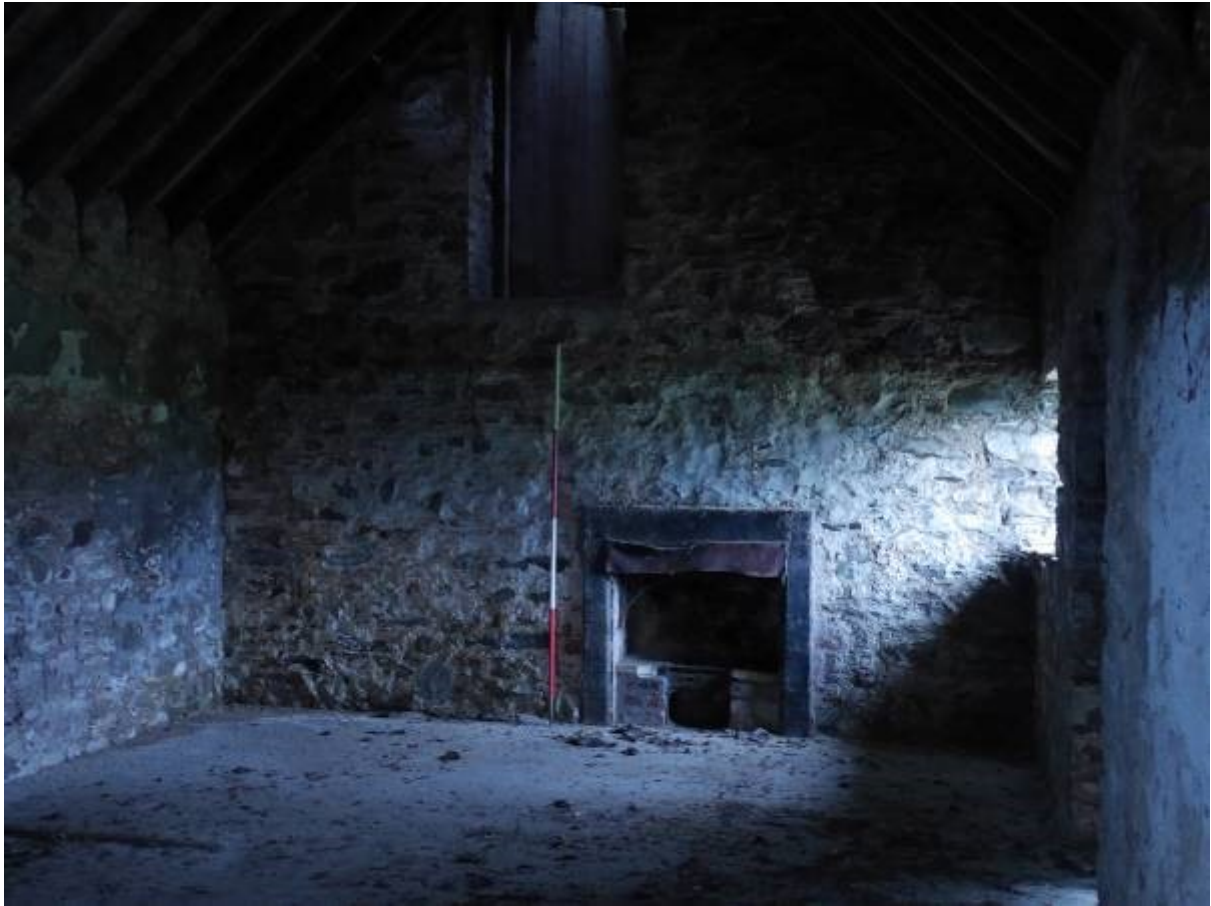
Illustration 17- Interior of northern end of room 1 showing fireplace and doorway providing access to room 2 and a former roof space