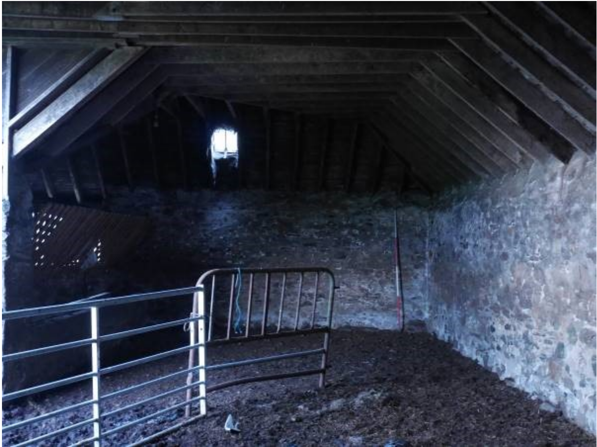
Illustration 21- Interior of room 3 looking West, feeder 3A visible to left