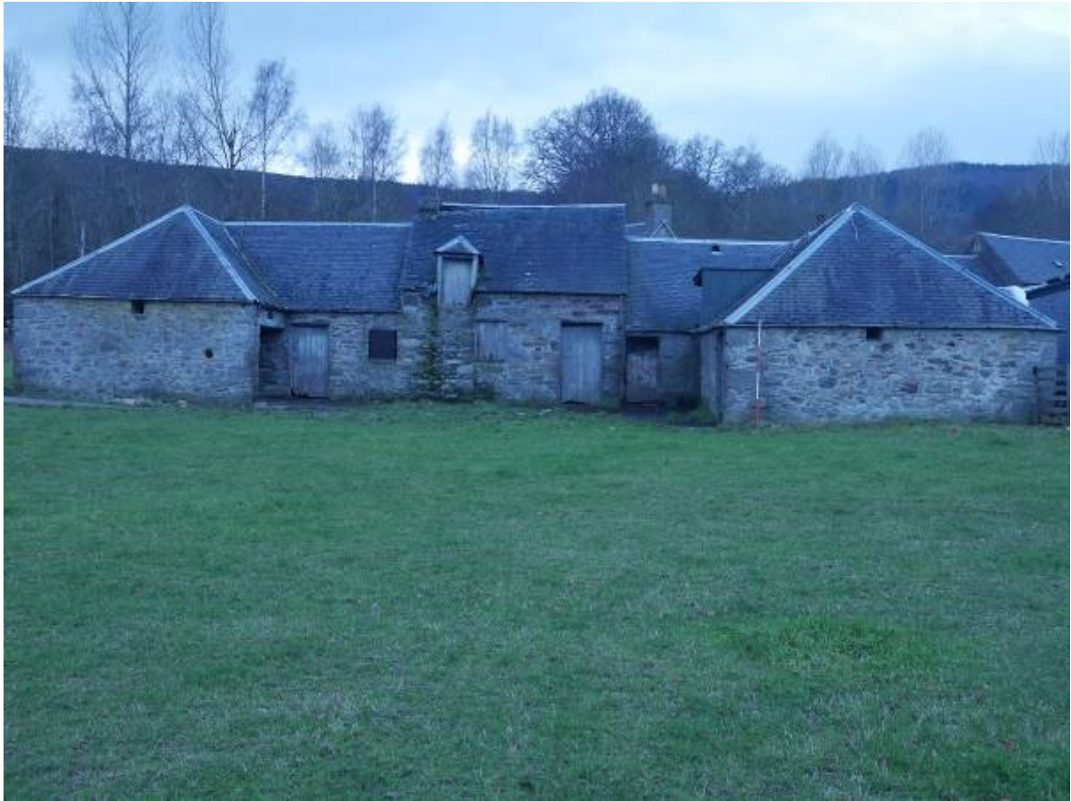
Illustration 23- General view of Eastern side of steading looking South South West