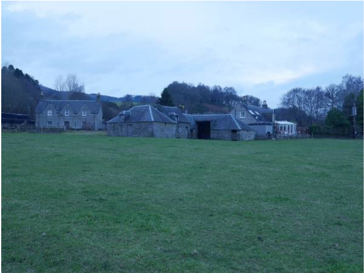
Illustration 6-Wester Ballinluig steading from the South