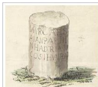
Site details. Click on a point